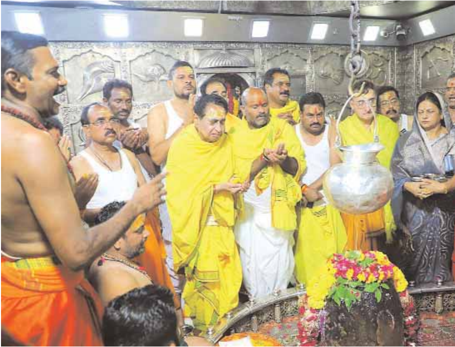
Madhya Pradesh State Congress President Kamal Nath offers prayer at Mahakaleshwar Temple in Ujjain, Madhya Pradesh on Tuesday.

pilot project in Madhya Pradesh. Minister Deora supported the reduction in GST rate on Ostomy devices from 12 percent to 5 percent on account of it being a health utility item and being used repeatedly by critical patients for a long period of time. Minister Deora said that IVF is a ray of hope for childless couples in the present times. He supported the clarification regarding IVF treatment being tax free services as recommended by the Fitment Committee. In order to remove the confusion arising out of having different tax rates on different articles of similar nature under the same head, the Finance Minister has supported the hike in the tax rate on all orthopedic implants to 5 percent.