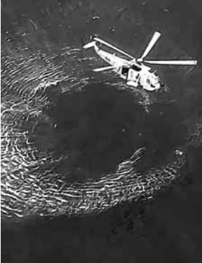
Rescue operation underway after an ONGC helicopter carrying nine persons, including two pilots, fell into the Arabian Sea off the Mumbai coast