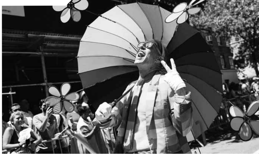
A reveller at the annual NYC Pride March, in New York.