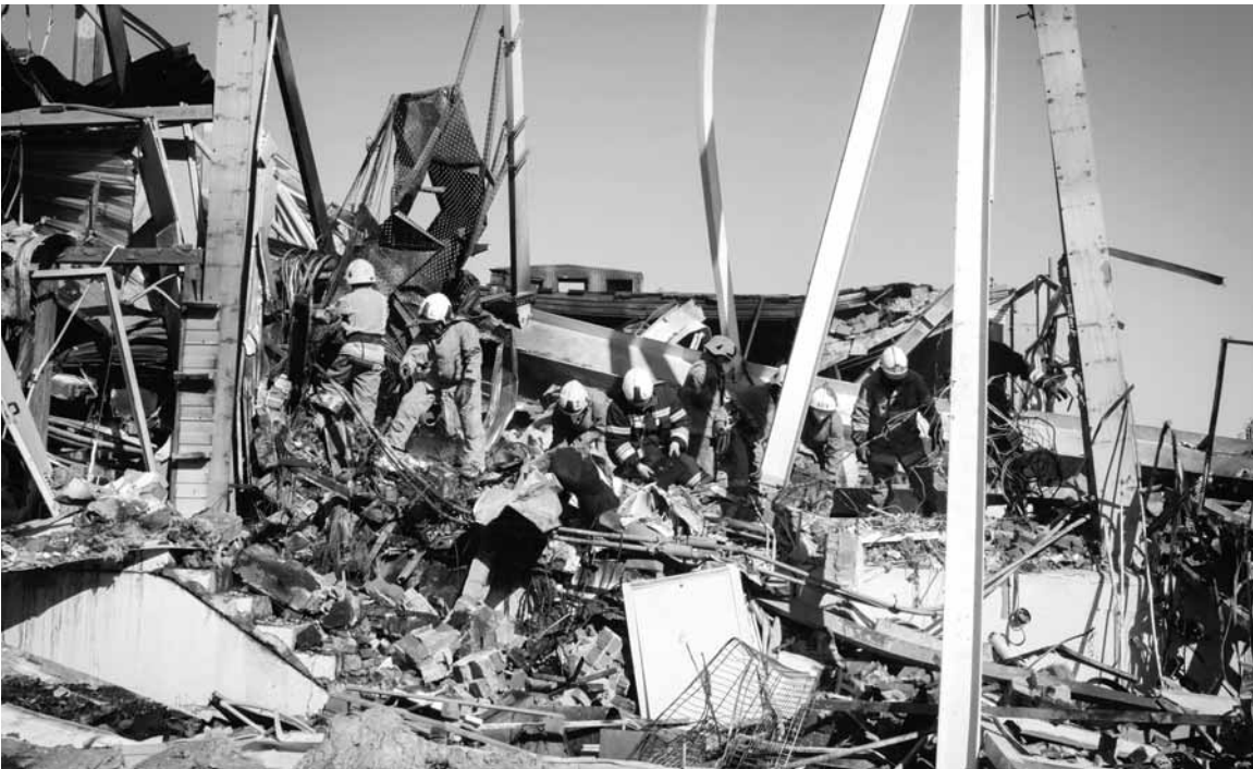
Ukrainian State Emergency Service firefighters work to take away debris at a shopping center burned after a rocket attack in Kremenchuk, Ukraine, Tuesday, June 28

Russia has repeatedly denied it targets civilian infrastructure, even though Russian attacks have hit other shopping malls, theaters, hospitals, kindergartens and apartment buildings in the four-month war.