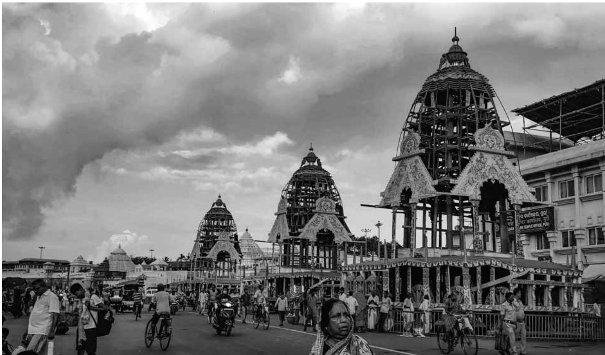
Construction of chariots in the final stages for the annual ‘Rath Yatra’ festival of Lord Jagannath, in Puri on Tuesday.