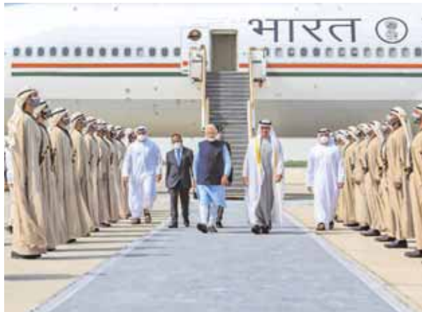
Prime Minister Narendra Modi with UAE President and Abu Dhabi Ruler Sheikh Mohamed bin Zayed Al Nahyan upon his arrival, in Abu Dhabi

Signifying the robust relations with India, the UAE President in a special gesture personally received and then gave a warm send-off to