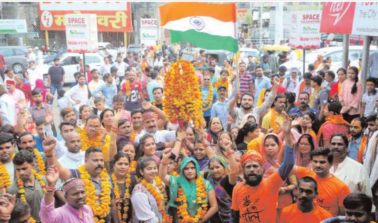
Under the Teerth Yatra Yojana, the first batch of the pilgrims leaves for their annual Amarnath Yatra after a gap of two years due to coronavirus pandemics, at railway station in Bhopal on Tuesday.