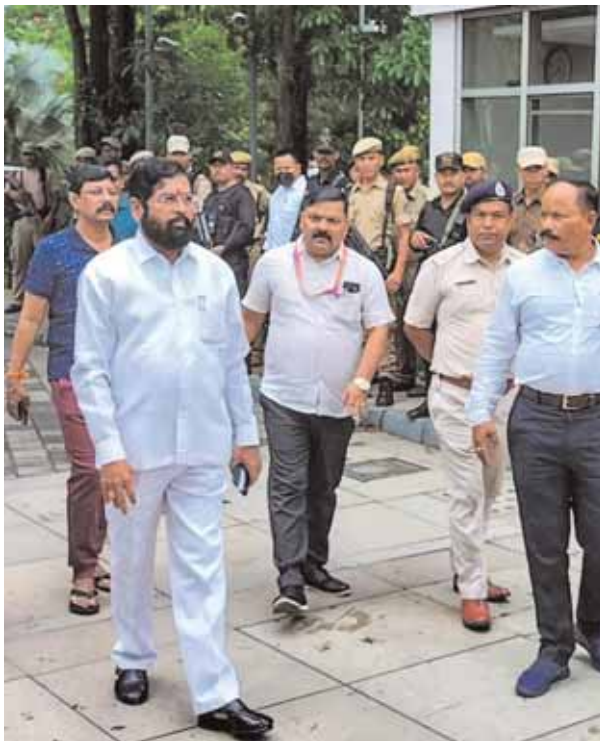
Rebel Shiv Sena leader Eknath Shinde arrives to address media at a hotel where he is staying with other supporting MLAs, in Guwahati on Tuesday

The CM said, "If we all sit together, we can definitely come up with a solution to the political turmoil and cautioned them saying that the rebel group had fallen prey to any kinds of wrong measures, hinting at a possible tie-up with the Opposition BJP."