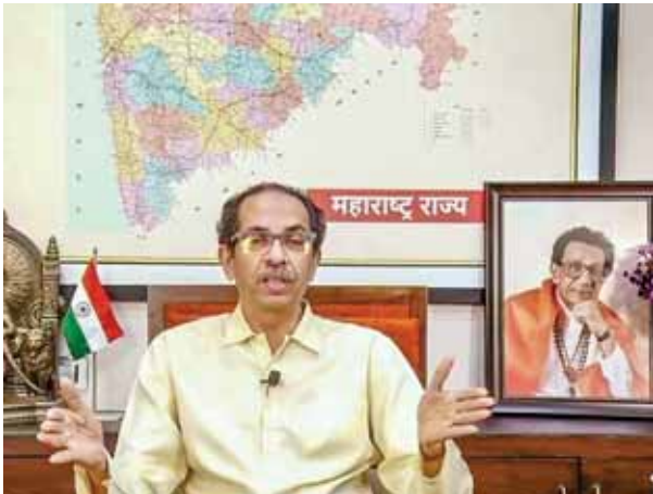
Maharashtra CM and Shiv Sena chief Uddhav Thackeray virtually addresses the people of the State, in Mumbai on Wednesday

On part, Sena president and Chief Minister Uddhav Thackeray played an emotional card as he went live on Facebook and spoke to the people of Maharashtra, wherein he made it clear: "I have no greed for power. Nor would I remain stuck to the chair. Let the rebel MLAs come and tell me that I am not good enough to hold this position. I will quit as both