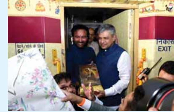
Union Minister for Railways, Communications, Electronics and Information Technology, Ashwini Vaishnav, and the Union Minister for Culture, Tourism and Development of North Eastern Region (DoNER), G. Kishan Reddy flag off 'Bharat Gaurav Tourist Train' on Shri Ramayan Yatra, in New Delhi on Tuesday

"DIAL has a 7.84 MW solar power plant on the airside, whereas as part of stakeholder collaboration, operators of the Cargo terminals at Delhi Airport have added another 5.3 MW rooftop solar power plant," DIAL said.