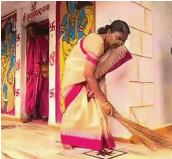
Jharkhand ex-Governor and NDA's Presidential candidate Draupadi Murmu sweeps at Purnandeswar Shiv temple in Rairangpur, Mayurbhanj, on Wednesday