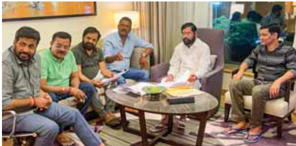
Rebel Shiv Sena leader Eknath Shinde with other MLAs at a hotel in Guwahati on Wednesday

Shinde's reaction came hours after Chief Minister Uddhav Thackeray reached out to the rebels, saying he would quit his post if even one Sena MLA comes and tells him on his face that he was incompetent. The Sena strongman, a Cabinet minister, said the MVA, formed in