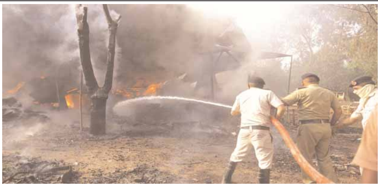
A Major fire broke out on Wednesday in the furniture market in Chandigarh which borders Mohali. Fire officials said furniture and other goods of several shops were gutted in the fire which broke out late afternoon. At least six fire tenders were pressed into service to control the blaze, the cause of which is yet to be known. Chaos reigned in the Sector 53 furniture market after the fire broke out there, with shopkeepers and their workers rushing to rescue their goods and putting them outside on the road.