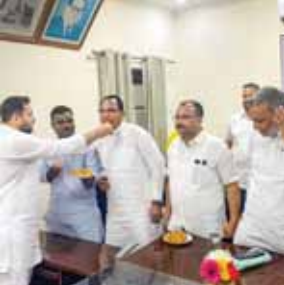
RJD leader Tejashwi Yadav offers sweet to AIMIM MLAs after they joined the RJD in Patna on Wednesday