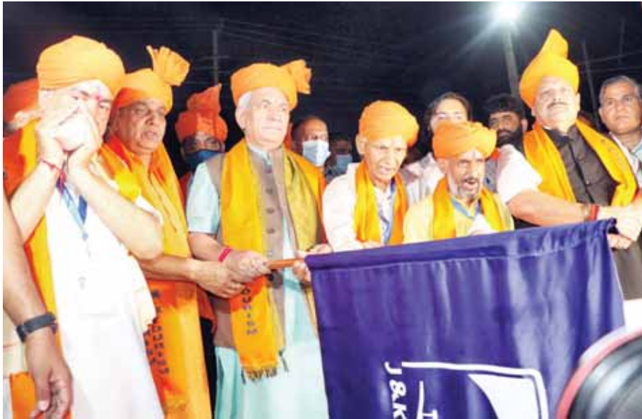
Jammu & Kashmir Lt Governor Manoj Sinha flags off the first batch of pilgrims for the Amarnath Yatra 2022 after conducting a puja at the Bhagwati Nagar base camp in Jammu on Wednesday

The atmosphere inside the base camp was upbeat since