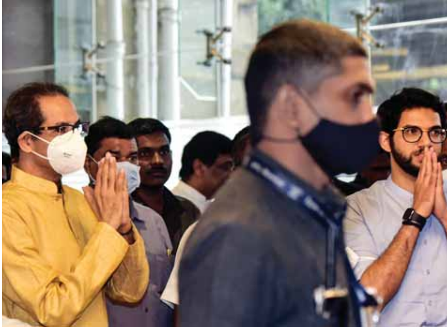
Maharashtra Chief Minister Uddhav Thackeray with Maharashtra Minister Aaditya Thackeray leaves after attending a Cabinet meeting, in Mumbai on Wednesday

Singhvi questioned the act of the Governor in showing undue haste in calling for floor test. "The Governor is bound to act on the aid and advice of the Council of