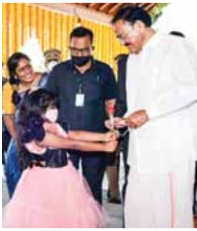
Vice President M Venkaiah Naidu being greeted by a young girl near Kelambakkam in Chennai

As per Article 68 of the Constitution, the election to fill the vacancy caused by the expiration of the term of office of the outgoing Vice President is required to be completed