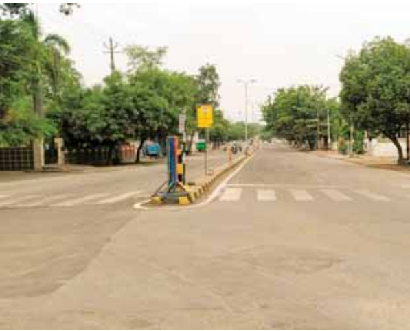
Streets wear a deserted look amid restrictions following the murder of tailor Kanhaiya on Tuesday, in Udaipur on Wednesday

Stones were hurled at a burial ground and some people tried to vandalise its gate as the procession passed by. Elsewhere in Rajasthan, markets were closed in Sojat (Pali), Bhinmal and Sanchore (Jalore) and Reodar (Sikar) in protest