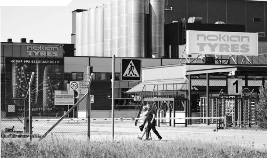
Men walk at the Nokian Tyres manufacturing plant in Vsevolozhsk, outside St Petersburg, Russia