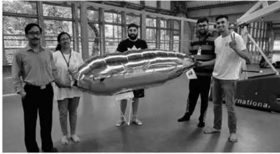
City's Aerospace and Electronics students BLIMP'ed their way to IIT Bombay Students of Punjab Engineering College, Chandigarh under the guidance and sponsorship of Chandigarh's Drone-tech and AI startup SoFly Innovations Pvt. Ltd. have built a unique remotely piloted aircraft for the 'Airship Regatta 2022' competition which was held at IIT Bombay.