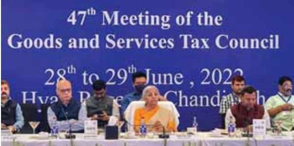
Union Finance Minister Nirmala Sitharaman chairs the 47th meeting of the GST Council in Chandigarh on Wednesday

However, the council decided to refer the report of