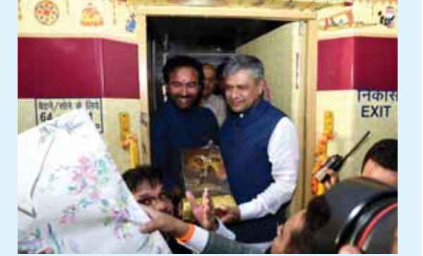
Union Minister for Railways, Communications, Electronics and Information Technology, Ashwini Vaishnaw, and the Union Minister for Culture, Tourism and Development of North Eastern Region (DoNER), G. Kishan Reddy flag off 'Bharat Gaurav Tourist Train' on Shri Ramayan Yatra, in New Delhi on Tuesday