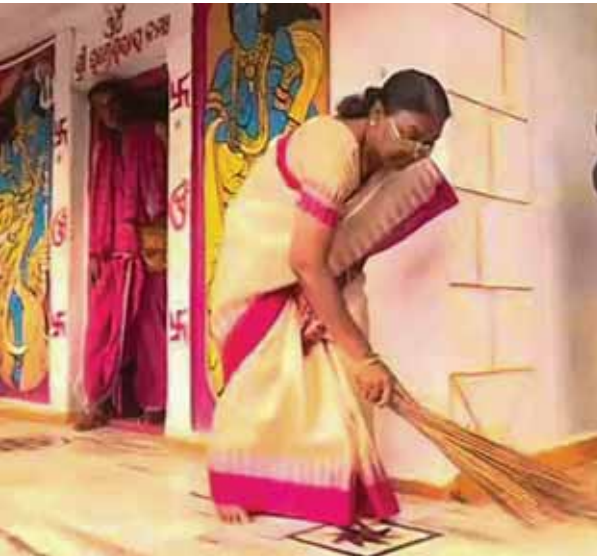
Jharkhand ex-Governor and NDA's Presidential candidate Draupadi Murmu sweeps at Purnandeswar Shiv temple in Rairangpur, Mayurbhanj, on Wednesday