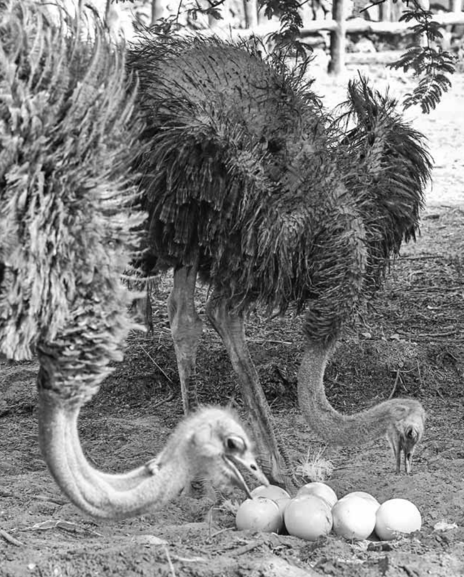
A pair of ostrich attend to their eggs at the Jaipur Zoo, in Jaipur on Wednesday.