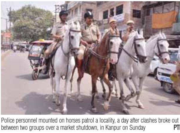
Police personnel mounted on horses patrol a locality, a day after clashes broke out between two groups over a market shutdown, in Kanpur on Sunday

A heavy police force remained deployed in the sensitive localities on Sunday also. Only a few shops opened in the markets and people desisted from going out of their houses. Sources in the police said that during the investigation, it was observed that efforts were made to tamper with and erase footage from the DVRs of