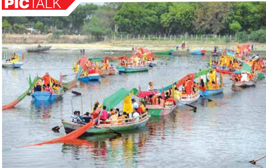
Devotees cover the Yamuna river across with sarees during 'Chunar Manorathi', in Mathura