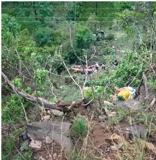
Rescue operation underway after a bus carrying pilgrims fell into a deep gorge, in Uttarkashi district on Sunday

Union Home Minister Amit Shah expressed grief at the mishap and called Chief Minister Pushkar Singh Dhami to take stock of the situation. Shortly afterwards, the Chief Minister reached the disaster