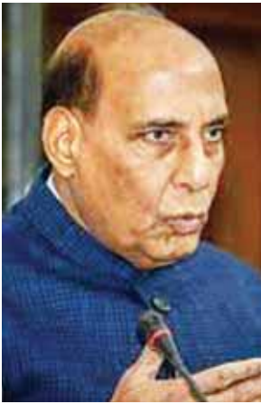
'Aatmanirbhar Bharat' and 'Make in India, Make for the World'," they said.

"This project is significant in the context of the growing defence industry cooperation with Vietnam and exemplifies Prime Minister Narendra Modi's vision of