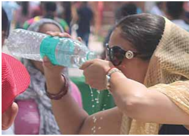
Celsius and the minimum temperature of 29 degrees Celsius, predicted the weather department.

On 11th June, the city will witness a partly cloudy sky with the possibility of rain or thunderstorm with a maximum temperature of 41 degrees