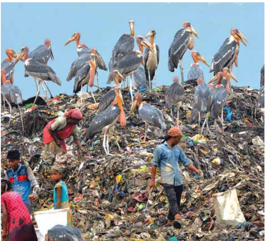
Rag pickers look for recyclable materials as greater Adjutant Storks perch at the Boragaon garbage dumping site, in Guwahati on World Environment Day