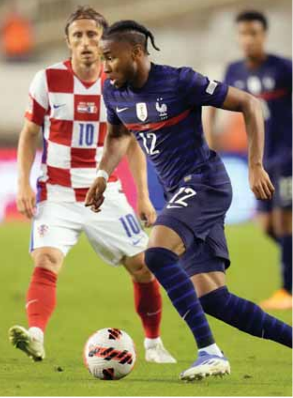
■ SPLIT

Andrej Kramaric scored a late penalty as Croatia salvaged a 1-1 draw at home to world champions France on Monday that left both teams still chasing a first win in the Nations League.