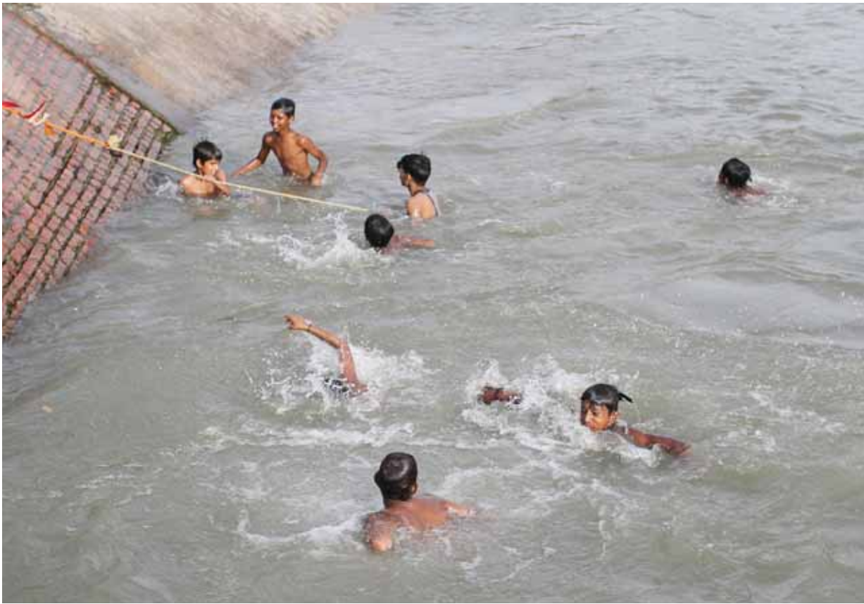
Children beating heat in Bawana canal in Delhi on Tuesday