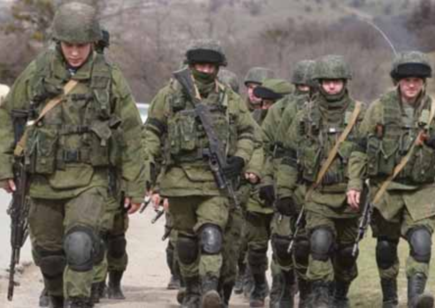
AP ■ KYIV

Russia claimed Tuesday it has occupied large swathes of eastern Ukraine after a relentless, weeks-long barrage and the recent deployment of more troops. Russian Defence Minister Sergei Shoigu said Moscow's forces have "liberated" 97 per cent of the Luhansk region. Russia appears bent on capturing the entire eastern Donbas part of Ukraine, which is made up of the Donetsk and Luhansk regions. That goal appears to be its most immediate ambition in Ukraine. But while the Kremlin's forces have superior firepower, the Ukrainians defenders — among them the country's most well-trained forces — are entrenched and have shown the capability to counterattack. Shoigu claimed that Russian forces have seized the residential quarters of Sievierodonetsk and are fighting to take control of an industrial zone on its outskirts and the nearby towns. Sievierodonetsk, the administrative center of the Luhansk region, has recently been the focus of the Russian offensive. Sievierodonetsk and nearby Lysychansk are the only two Donbas cities holding out against the Russian invasion, which is being helped by local pro-Kremlin forces. Shoigu added that the Russian troops were pressing their offensive toward the town of Popasna and noted that they have taken control of Lyman and Sviatohirsk and 15 other towns in the region.