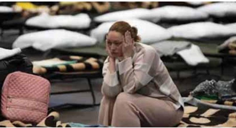
AP ■ UNITED NATIONS

Sexual violence in Ukraine, especially against women and girls, remains prevalent and underreported, and the humanitarian crisis in the war-torn country is turning into "a human trafficking crisis," the U.N. Special envoy for sexual violence in conflict said Monday. Pramila Patten told the U.N. Security Council that there is a gap between its resolutions aimed at preventing rape and other sexual attacks during conflicts and the reality on the ground for the most vulnerable -- women and children. As of June 3, she said, the U.N. Human rights office had received 124 allegations of conflict-related sexual violence — 97 of them involving women and girls, 19 against men, seven against boys and one gender unknown. Verification of the cases is continuing. Patten said Ukraine's prosecutor general informed her during a visit in May that a national hotline reported the fol-