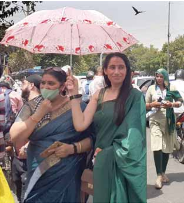
Two women share an umbrella to shield themselves from the scorching sun in the national Capital on Tuesday

The maximum temperature in the Capital may drop to