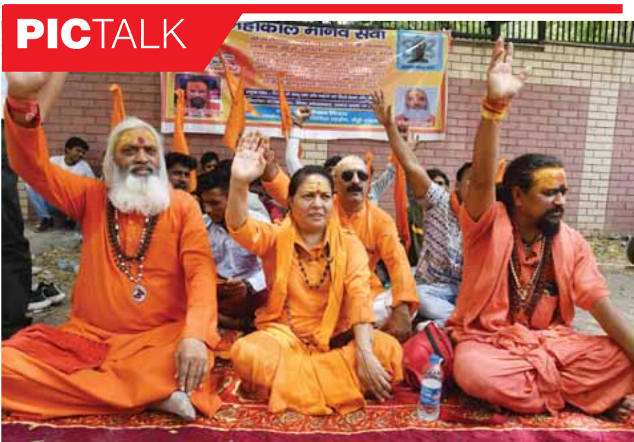
Hindu groups protest outside Delhi CM's House, against pension given to maulanas, in New Delhi on Tuesday