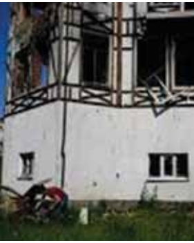
AP ■ MOSCOW

The Russian military says it has destroyed several artillery systems provided by the West in the latest series of strikes on Ukrainian targets. Maj. Gen. Igor Konashenkov said Tuesday that the Russian artillery hit a howitzer supplied by Norway and two other artillery systems given to Ukraine by the United States. He said that the Russian artillery barrage destroyed other Ukrainian equipment in the country's east while the Russian air force hit Ukrainian troops and equipment concentrations and artillery positions. Konashenkov's claims couldn't be independently confirmed.