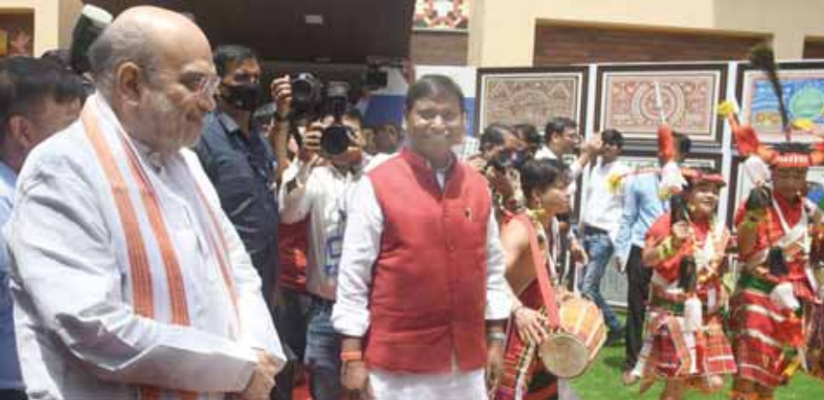
Union Home Minister Amit Shah with Union Ministers Arjun Munda and Kiren Rijiju during inauguration of the National Tribal Research Institute, as part of the 'Azadi Ka Amrit Mahotsav' celebration by the Ministry of Tribal Affairs, in New Delhi on Tuesday

Shah said Prime Minister Narendra Modi has accorded top priority to research and education since he came to power. "Under the Congress Government, in 2014, Rs 7 crore had been set aside for this purpose. In 2022, we have kept Rs 150 crore for it," Shah said. Modi Government has increased the budget for Eklavya residential schools from Rs 278 crore to Rs 1,418 crore this financial year, he said. "I believe that only a tribal child can bring the 'best medal' in the Olympics as sports is a part of tribal traditions. "They are 'natural' sportspersons and only need guidance, coaching, practice and a platform to showcase their talent," Shah said. The Government spends Rs 1.09 lakh on each tribal student in Eklavya residential schools as against Rs 42,000 earlier, he added. Shah highlighted the BJP has the most number of tribal MPs and Ministers. "Previous Governments would talk about tribal development but did they provide clean drinking water to tribals or build toilets in their houses? Did they give health cards to