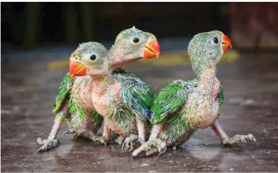
Newly-hatched parakeets rest after being rescued at a preservation centre in Dimapur on Tuesday.

Meanwhile, Uttar Pradesh continued to record fresh Covid cases in three digits with 128 infections witnessed in the last 24 hours. However, 184 patients recovered during the same period. The additional chief secretary said that there were a total of 910 active cases of Covid in the state as on Tuesday.