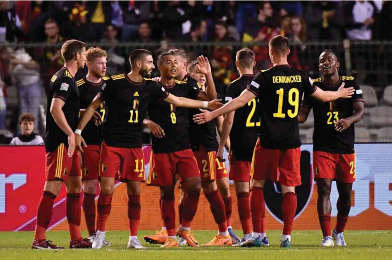
PARIS

Belgium lost their opening game to neighbours Netherlands but responded with an increasingly dominant performance and finished the game with five goals in just over 30 minutes. "It brings extra emotion when you lose against your rivals so that was definitely a motivator tonight," said Belgium coach Roberto Martinez. "Against The Netherlands we were passive, waiting, insecure. Now we were a team instead of individuals." Belgium suffered another early setback on Wednesday as the visitors took the lead after 28 minutes as star striker Robert Lewandowski struck with his 22nd goal for club and country in 2022.