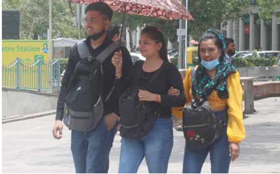
People use scarfs and umbrellas to shield themselves from the hot summer sun in New Delhi on Thursday