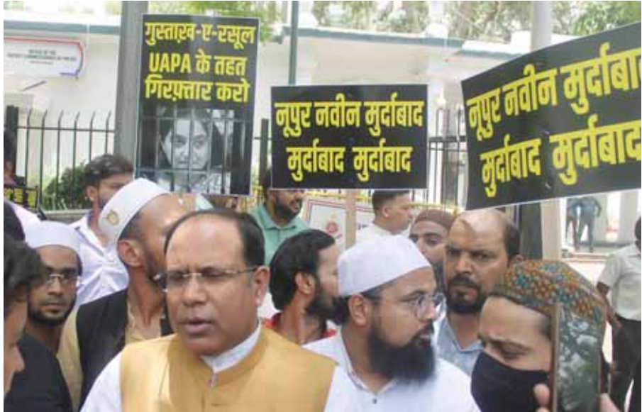
AIMIM activists protest demanding the arrest of former BJP spokesperson Nupur Sharma over her comments against Prophet Muhammad, outside Parliament Street Police Station, in New Delhi on Thursday

Earlier, the Special Cell of Delhi Police registered an FIR against Owaisi, controversial priest Yati Narsinghanand and others for allegedly posting and sharing messages on social media against the mainte-