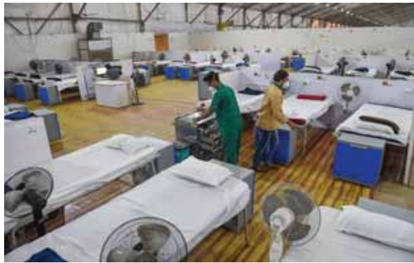
Medical staff at BKC Jumbo Covid Care Centre, prioritised by the BMC to be functional from June 10 amid a rise in Covid-19 cases, in Mumbai on Thursday

There has been a spike in Covid cases in Maharashtra and Kerala. In both States, test positivity rates have crossed the WHO's threshold limit of 5 per cent. There has been a sharp rise in Covid-related hospital-