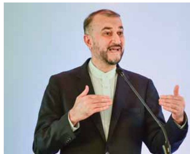
Iranian Foreign Minister Hossein Amir-Abdollahian speaks during an interactive session on promoting investment and trade opportunities between Iran and India, in Mumbai on Thursday