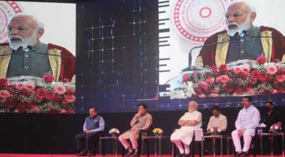
Prime Minister Narendra Modi with Union Ministers Piyush Goyal, Dharmendra Pradhan and Jitendra Singh during inauguration ceremony of Biotech Start-up Expo 2022, at Pragati Maidan, in New Delhi on Thursday

Modi said in order to transcend government-centric approach, the government is encouraging a culture of providing new enabling interfaces. He gave the example of Startup India for startups, IN-SPACE for the space sector, iDEX for defence startups, India Semiconductor Mission for