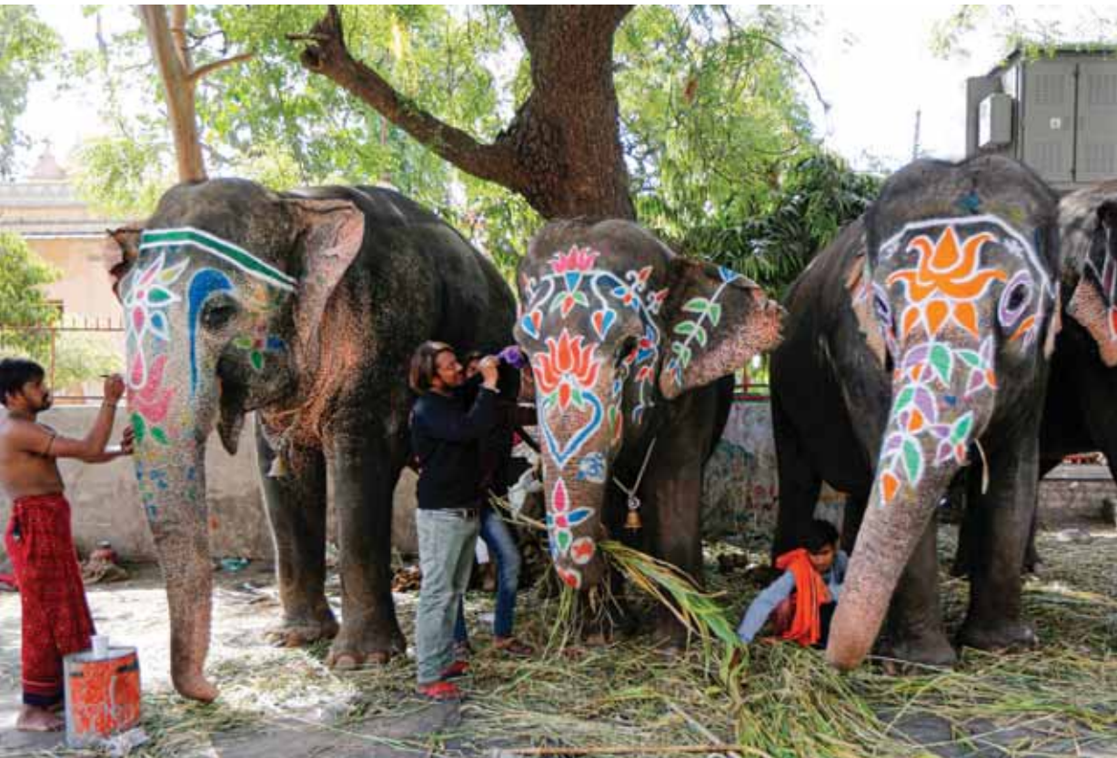
Mathous paint their elephants to prepare them for the upcoming religious procession, 'Jalyatra' outside the Jagannath Temple, in Ahmedabad on Thursday