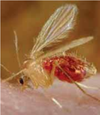
V Leishmaniasis is a tropical/sub-tropical disease, spread by the bite of infected sandfly