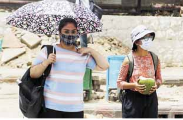
A girl holding an umbrella during the hot summer day in New Delhi on Saturday

An AQI between zero and 50 is considered 'good', 51 and 100 'satisfactory', 101 and 200 'moderate', 201 and 300 'poor', 301 and 400 'very poor', and 401 and 500 'severe'. According to sources in discoms, Delhi witnessed peak power demand of 6991 at 2:23 pm on Saturday.