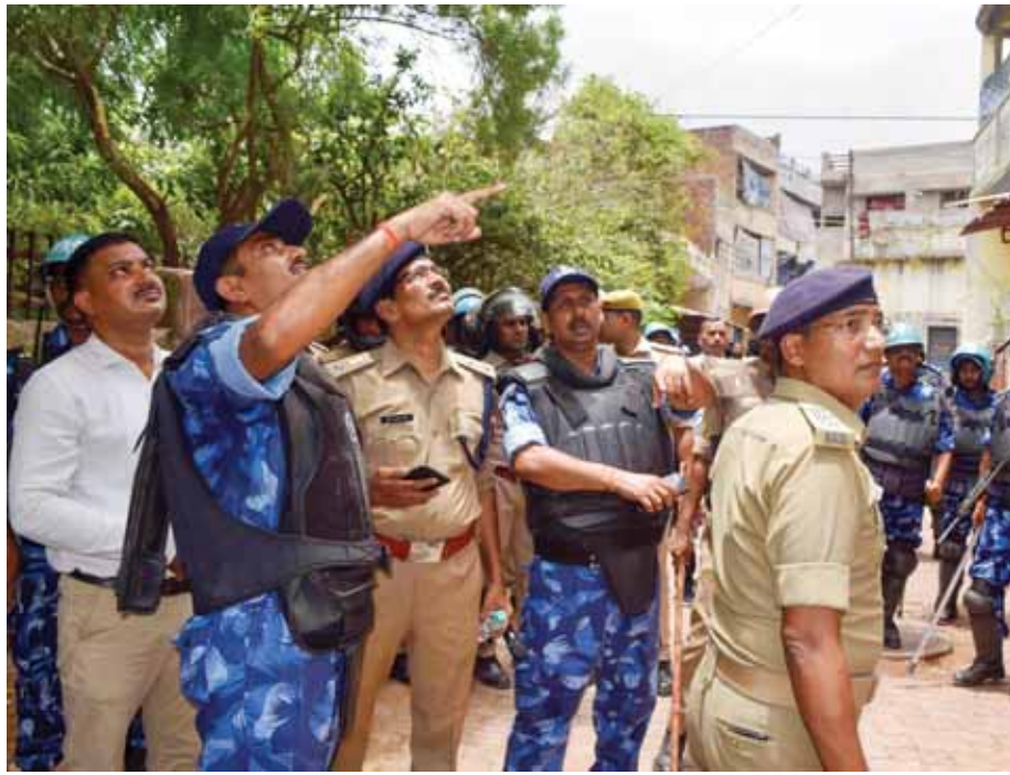
Police personnel inspect illegal structures at Atala area in Prayagraj on Saturday

Chief Minister Yogi Adityanath on Saturday held a review meeting with the team of top officials. "Toughest action will be taken against all those anti-social elements who participated in the anarchist attempts to vitiate atmosphere in various cities of the State. Such people have no place in civilised society. Take care that no innocent is harassed, but ensure not a single guilty