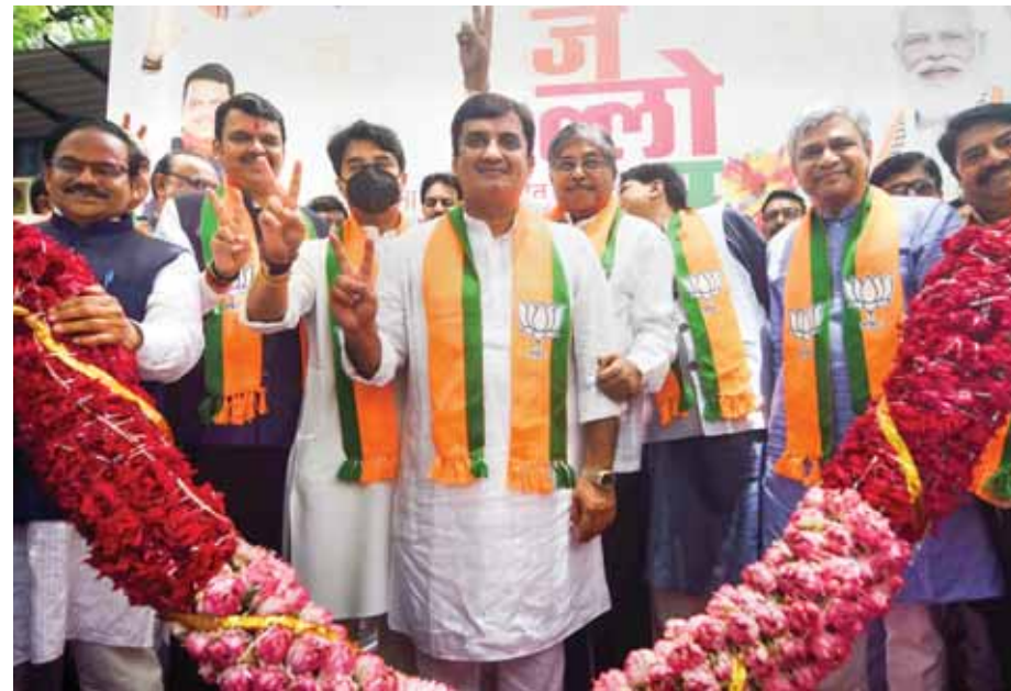
Union Minister Jyotiraditya Scindia and Ashwini Vaishnav, former Maharashtra CM Devendra Fadnis, State BJP president Chandrakant Patil and others flash the victory sign after three members were elected as Rajya Sabha member, in Mumbai on Saturday

While in Haryana, in a jolt to the Congress, the BJP's Krishan Lal Panwar and the saffron party-backed Independent candidate Kartikeya Sharma were declared elected for the two Rajya Sabha seats, after a high drama over allegations of violations of polling rules that