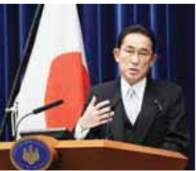
■ SINGAPORE

Japanese Prime Minister Fumio Kishida announced plans on Friday to boost his country's diplomatic and security role in the Asia Pacific to tackle what he described as growing threats in the region amid Russia's invasion of Ukraine. Kishida said Japan will consider acquiring a preemptive strike capability in response to an increasingly assertive China, North Korea and now Russia - a controversial plan that critics say would violate Japan's war-renouncing Constitution. "Ukraine today may be East Asia tomorrow," Kishida said in a keynote address at the Shangri-La Dialogue in Singapore, an Asian security forum. Kishida stressed the importance of cooperation among regional partners, and said he will lay out a "free and open Indo-Pacific plan for