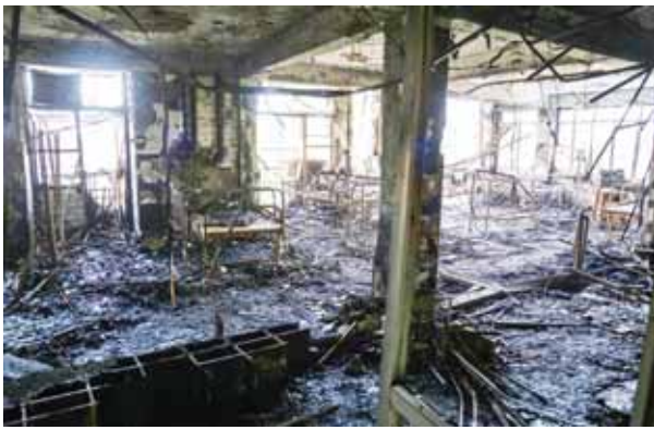
Charred remains after a fire broke out at the intensive care unit (ICU) of a hospital at Rohini area in New Delhi, Saturday morning. A 64-year-old patient died after his oxygen support was disrupted due to a fire at the facility