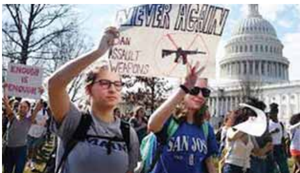
AP ■ WASHINGTON

Thousands of protesters are expected to rally in Washington, DC, Saturday and in separate demonstrations around the country as part of a renewed push for nationwide gun control. Motivated by a fresh surge in mass shootings,