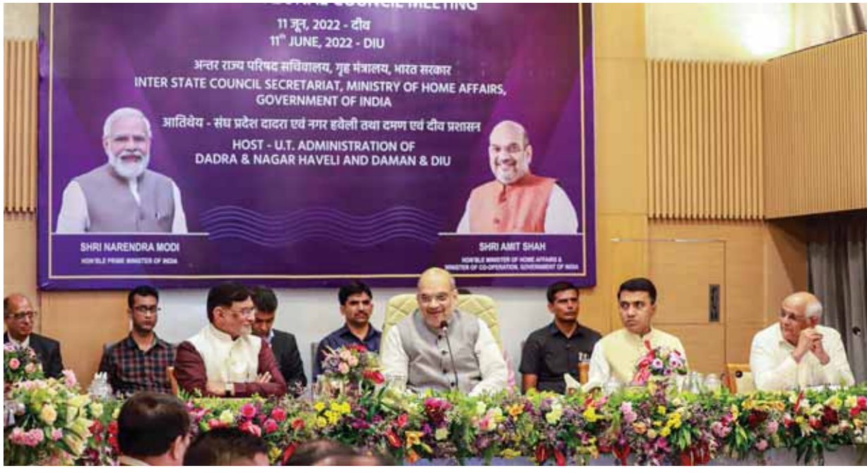
Union Home Minister Amit Shah with Gujarat CM Bhupendra Patel, Goa CM Pramod Sawant and other dignitaries, during the 25th Western Zonal Council meeting, in Diu.

later answered the questions of the diplomats in detail.