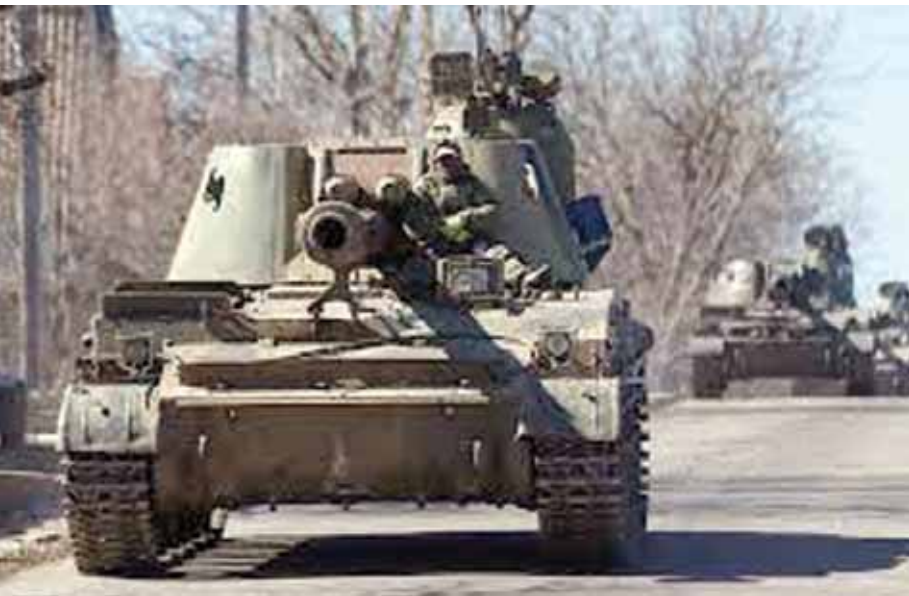
AP ■ KYIV

Ukrainian and British officials warned on Saturday that Russian forces are relying on weapons able to cause mass casualties as they try to make headway in capturing eastern Ukraine and fierce, prolonged fighting depletes resources on both sides. Russian bombers have likely been launching heavy 1960s-era anti-ship missiles in Ukraine, the U.K. Defense Ministry said. The Kh-22 missiles were primarily designed to