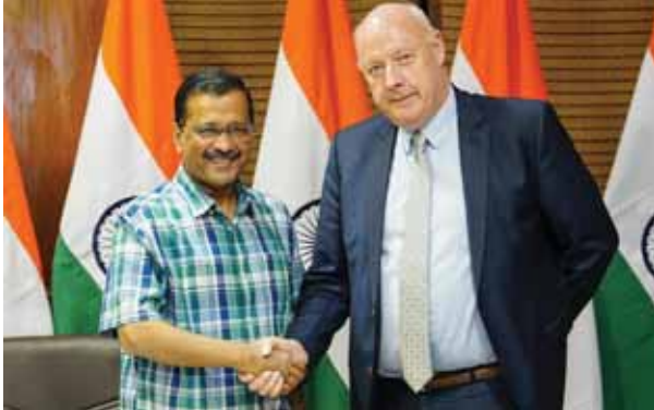
Delhi CM Arvind Kejriwal with Ambassador of Denmark to India Freddy Swain during a meeting, in New Delhi on Monday

ment our water supply capacity. "The state government will soon implement state-of-the-art solutions to enhance the groundwater level and extraction infrastructure. The national capital depends on neighbouring states for raw water. We want to make the city self-sustainable by radically increasing the water table by recharging groundwater," CM said. "A delegation of experts led by the Ambassador of Denmark to India Freddy Swain met with CM Arvind Kejriwal at the Delhi Secretariat. The delegation had come to present Denmark's solutions on groundwater recharge and power generation from stubble to the CM and held an extensive discussion with him on ways in which they can be adapted in Delhi," he said. "It was decided that Delhi and Denmark will further explore avenues of collabora-