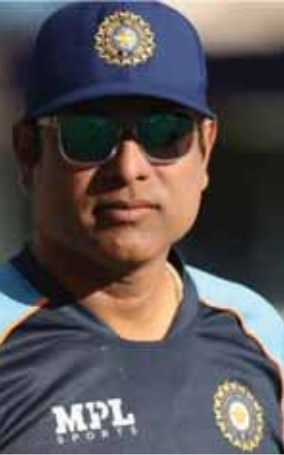
NEW DELHI