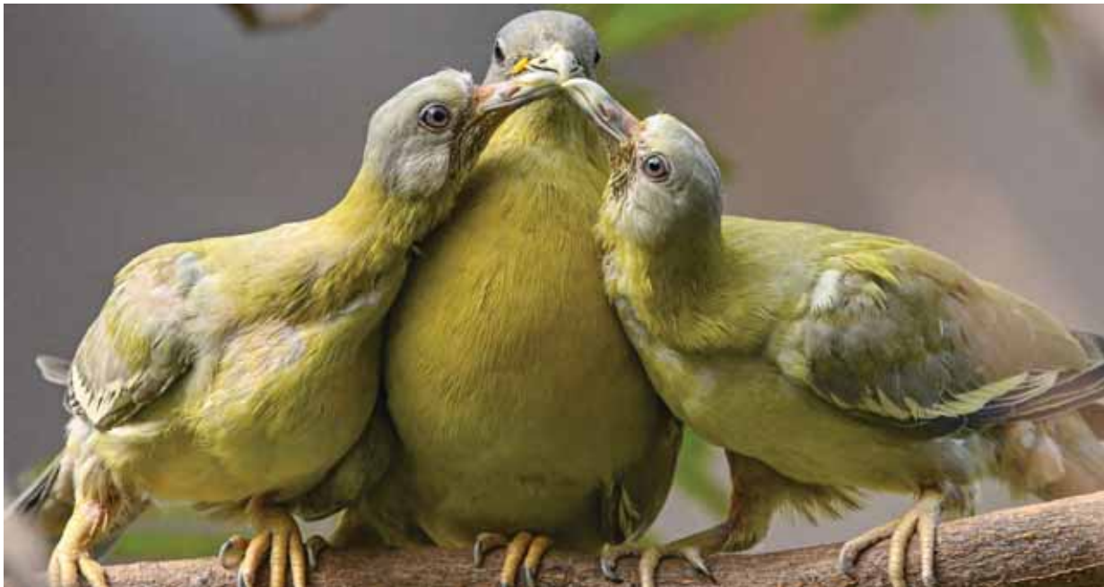
A yellow-footed green pigeon feeds her squabs, in New Delhi on Monday

dhabas pay only Rs100 to Rs120 per day to the children and make them work for more than 12 hours a day. Not only this, Aligarh is a hub of education, which has 3 main universities including AMU, Mangalaytan University and Raja Mahendra Pratap Singh university. Apart from this there are many graduate and post graduate colleges present here. Despite of this fact many children in Aligarh are deprived of education and are engaged in child labour. Majority of them are willing to go to school if an opportunity is given.