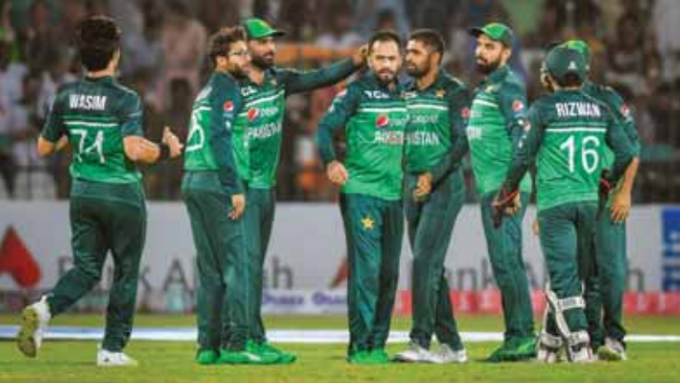
PTI ■ DUBAI

Pakistan have pipped India to climb to fourth spot in the latest ICC men's ODI team rankings after completing a clean sweep over West Indies in a recently concluded home series. New Zealand with 125 points are on top of the table while England are a point below at 124 and Australia are placed third at 107.