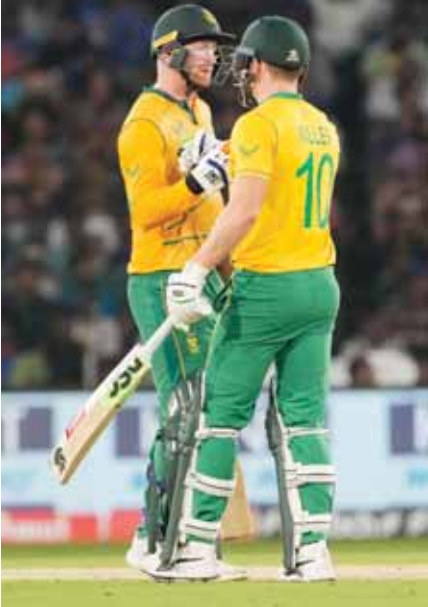
■ NOTTINGHAM