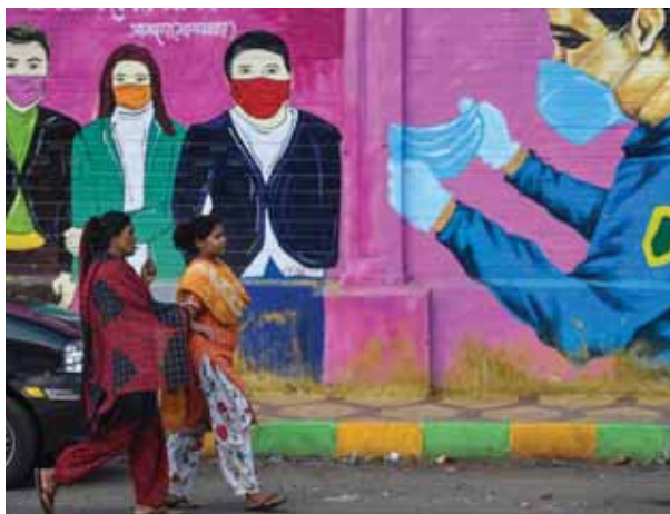
Women walk past a graffiti on a wall urging people to wear face masks in Mumbai, on Monday

She said the Government must explain to the people the booster shot is needed for a