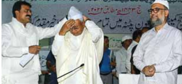
Bihar Chief Minister Nitish Kumar during the send-off ceremony for the first batch of Haj pilgrims, at Haj Bhawan, in Patna

This is yet another stance of the Bihar CM differing with the BJP on ideological issues. Kumar has already shot down the demand for removing loud-speakers from mosques.