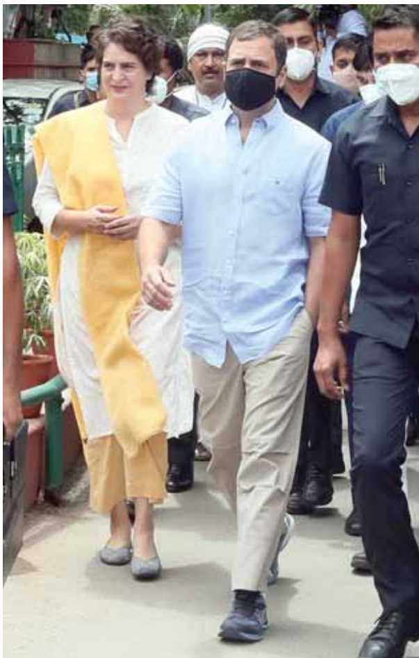
Congress leader Rahul Gandhi leaves for ED office for questioning in the National Herald case, in New Delhi on Monday

When Rahul left the Congress headquarters he was accompanied by party leaders, including Priyanka Gandhi