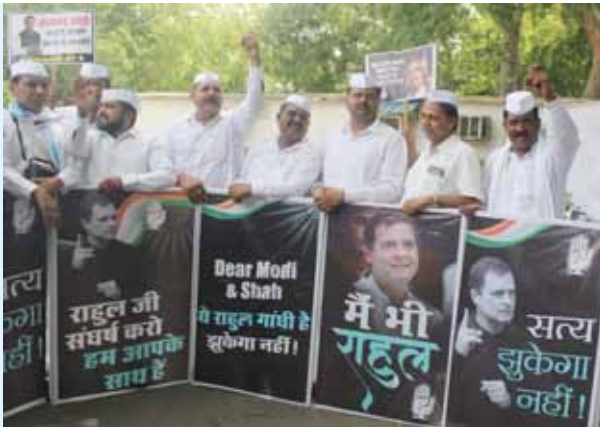
Congress activists stage a protest against summoning of party leader Rahul Gandhi in the National Herald case, outside AICC office in New Delhi on Monday

Tughlak Road Police Station regarding injuries to Congress leaders/workers during police action but no such incident of use of force by police took place as per our knowledge and no MLC case has been reported so far," the statement by the police concluded.