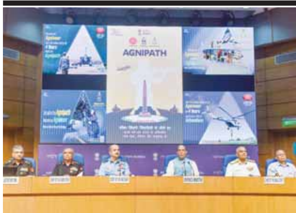
Defence Minister Rajnath Singh with three services chiefs General Manoj Pande (Army), Air Chief Marshal VR Chaudhari and Admiral R Hari Kumar (Navy) during a press conference at National Media Centre in New Delhi on Tuesday