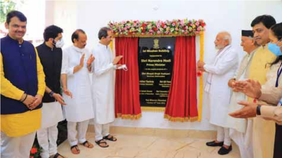
Prime Minister Narendra Modi inaugurating the newly reconstructed 'Jal Bhushan' Building that houses the office and residence of Maharashtra Governor at Raj Bhavan in south Mumbai on Tuesday

Modi said that the inclusion of ancient values and memories of freedom struggle in the architecture of Raj Bhavan and praised the spirit of turning Raj Bhavan into Lok