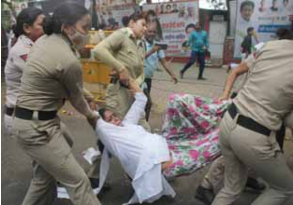
Police detain Congress workers staging a protest in support of party leader Rahul Gandhi outside the AICC headquarters in New Delhi on Tuesday

“They have been released now. Today also police had denied them permission to organise a gathering because Section 144 has been invoked,” said the Special CP.