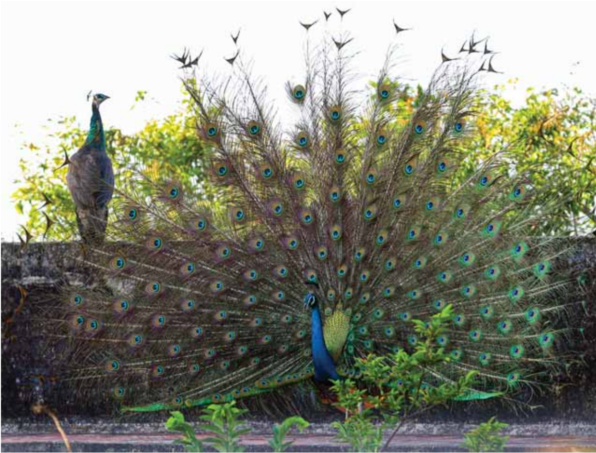
A peacock spreads its feathers at a tourist spot in Kanyakumari on Tuesday

Experts from the ICAR, NCERT, CBSE along with various school principals and teachers participated and deliberated on the need and process for the introduction of agriculture as a subject in school curriculum.