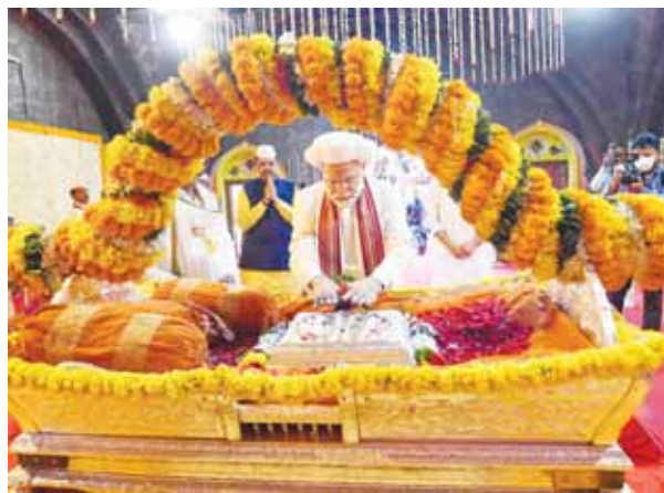
Prime Minister Narendra Modi visits the Jagatguru Shrisant Tukaram Maharaj temple in Dehu Pune on Tuesday

Opposition parties have been critical of the Government and alleged that it