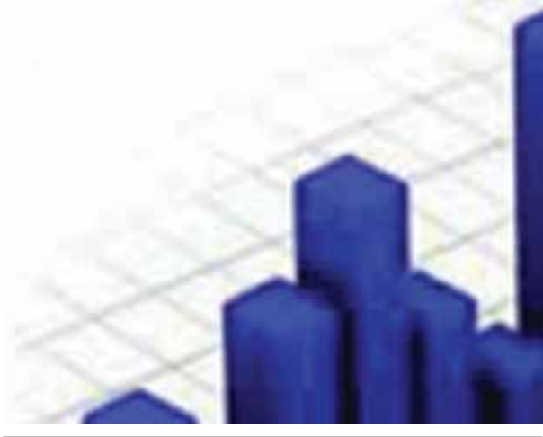
IN 2019, PRIME MINISTER NARENDRA MODI ENVISIONED TO MAKE INDIA A USD 5 TRILLION ECONOMY AND GLOBAL POWERHOUSE BY 2024-25

The CEA said there is a need for climate tagging of the budget. “GDP is the worst measure of economic activities but for all others. Because everything else you take, comes