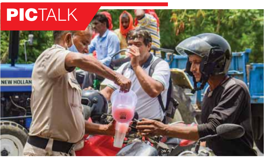
Volunteers serve 'sherbet' to commuters on a hot summer day in Gurugram

documents and several other legal documents in a "time-bound" manner, they added. Saxena also suggested that even as government departments start the exercise of simplifying language of official papers, the courts could be requested to simplify language being used in legal matters and documents, the sources said. The LG also instructed the officials to prepare a department-wise list of reforms that could be introduced to make system transparent and more people-friendly. The departments concerned have been instructed to seek public opinion on such matters and based on feedback and viability of suggestions, specific reforms could be introduced.