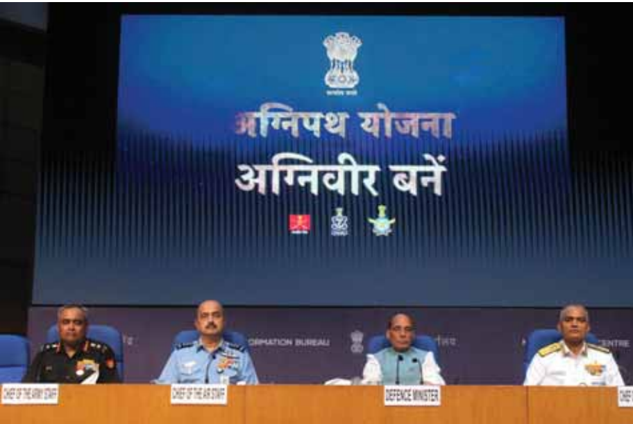
Union Defence Minister Rajnath Singh with three services chiefs during a press conference at National Media Centre in New Delhi