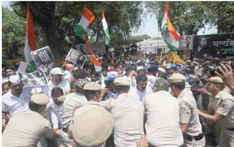
Police stop Congress workers who were staging a protest outside the AICC office against the summoning of party leader Rahul Gandhi by the Enforcement Directorate in connection with the National Herald case, in New Delhi on Wednesday

The Congress leaders alleged that the Delhi Police forcibly entered the AICC headquarters in the national