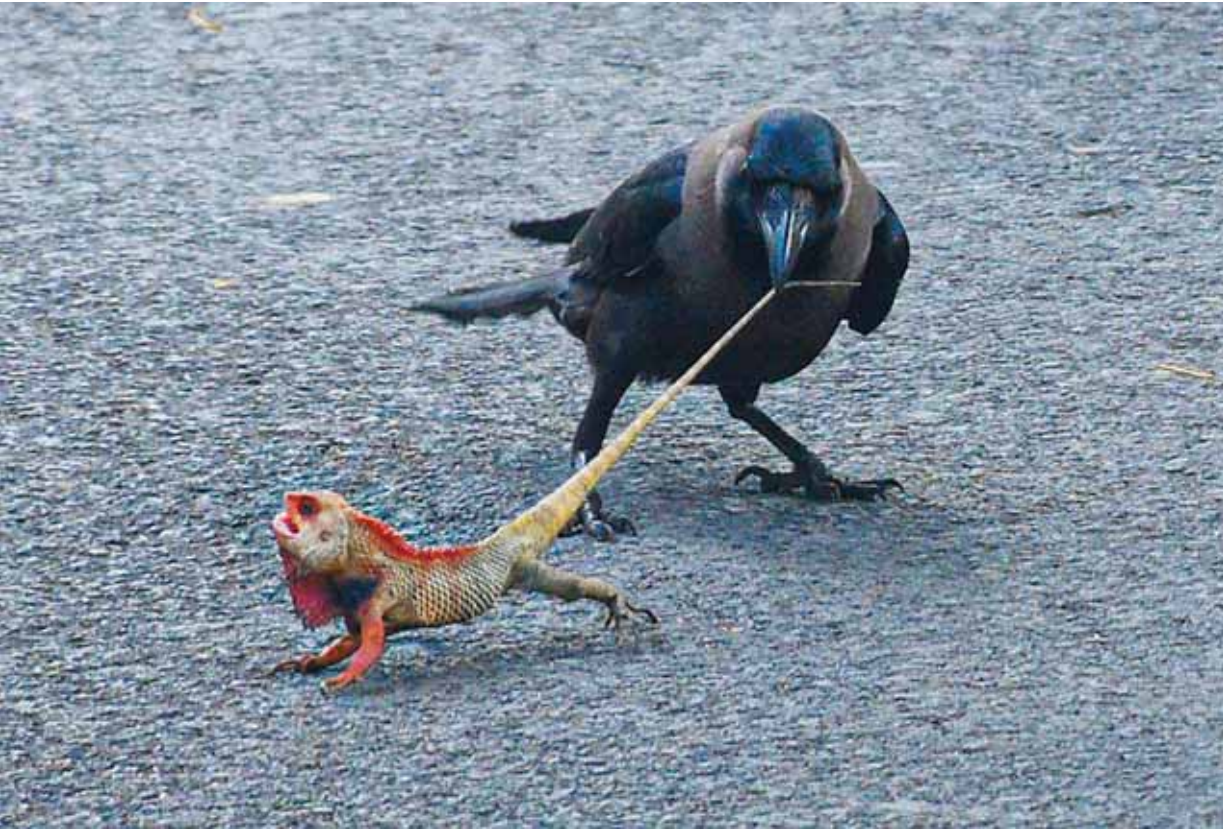
A hungry crow catches a chameleon by its tail, in Surat on Wednesday.

Taking forward the cooperation between Singapore and UP in various fields, Wong discussed the proposed skill university in the state. He said that if Singapore could become a partner in this project in some way, it would be useful in further improving the relations between the two countries.