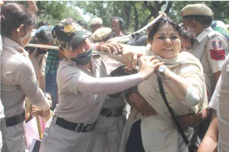
Police detain a woman Congress worker during a protest outside the AICC HQ in New Delhi on Wednesday