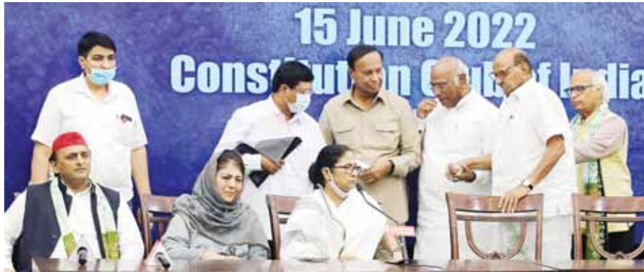
Samajwadi Party president Akhilesh Yadav, PDP chief Mehbooba Mufti, West Bengal Chief Minister and TMC chief Mamata Banerjee, NCP chief Sharad Pawar and Congress leader Mallikarjun Kharge during a press conference after the Opposition leaders meeting regarding upcoming Presidential elections, in New Delhi on Wednesday

"I sincerely appreciate the leaders of the Opposition parties for suggesting my name as a candidate for the election of the President of India, at the