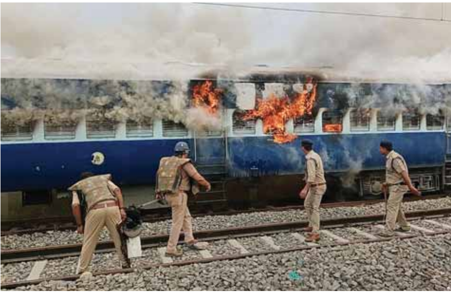
Policemen try to douse a fire in a train, set by people protesting against Agnipath scheme, in Ballia on Friday