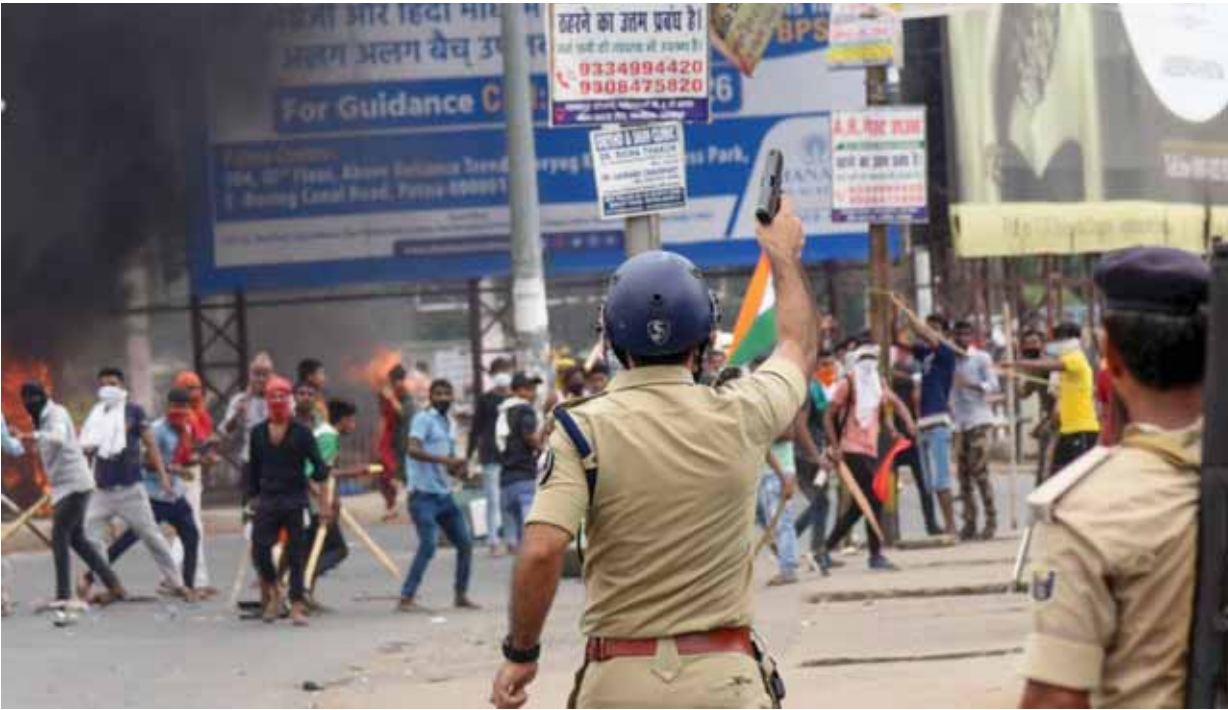
A policeman aims to fire in the air to disperse people protesting against Agnipath scheme in Danapur on Friday