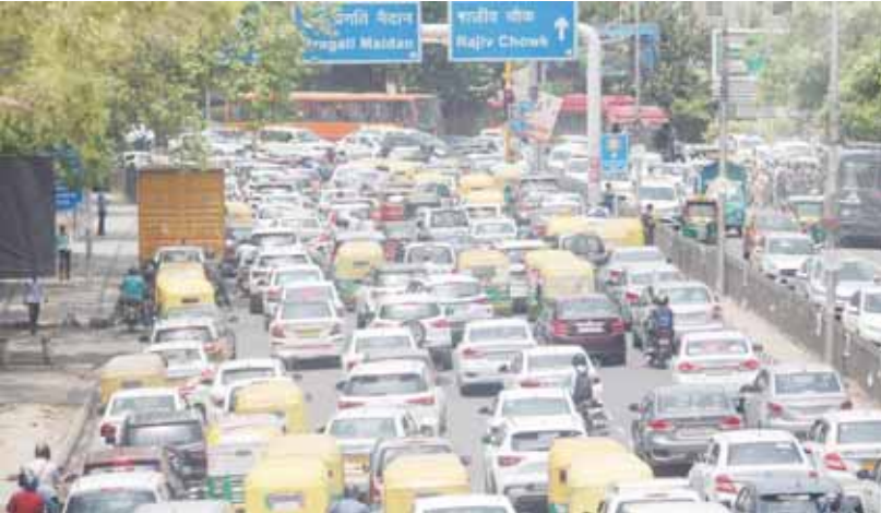
Traffic jam at ITO as students stage protest against Centre's Agnipath scheme in New Delhi on Friday (L); Delhi Metro closed gates of ITO Metro station as students launched a protest against the Centre's Agnipath scheme in New Delhi on Friday (M); Military aspirants damage bus during protest against Centre's Agnipath scheme on Yamuna Expressway near Gautam Buddha Nagar on Friday (R)