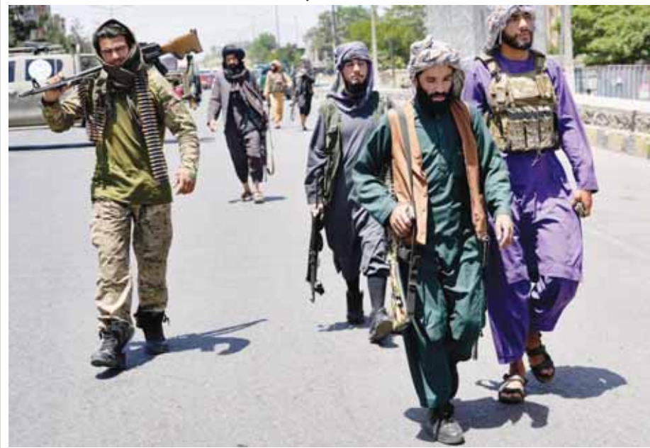
Taliban fighters stand guard after explosions and gunfire rip through a gurdwara in Kabul on Saturday