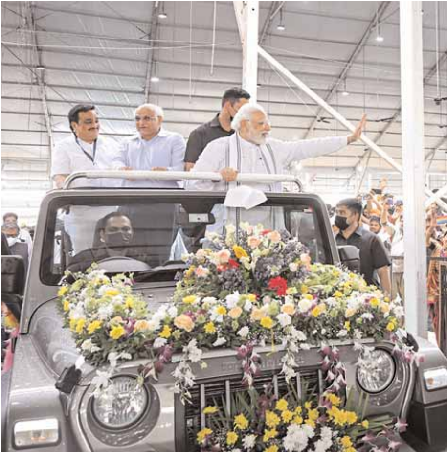
Prime Minister Narendra Modi with Gujarat Chief Minister Bhupendra Patel and Gujarat BJP president CR Patil during the inauguration of the various development projects, at the 'Gujarat Gaurav Abhiyan' programme, in Vadodara.

"Congress president has approved the appointment of Pawan Khera as the chairman of media and publicity in the new Communications department, with immediate effect," said an official release. Till now, Khera was the national spokesperson of the Congress.