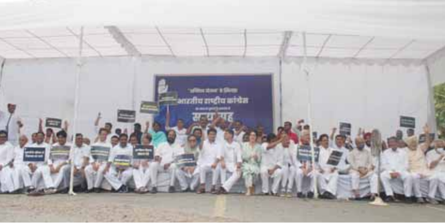
Congress leaders Priyanka Gandhi Vadra, KC Venugopal, Sachin Pilot, Deepender Singh Hooda and others shout slogans during the Congress satyagraha against the Central Government's Agnipath scheme, at Jantar Mantar in New Delhi on Sunday

Recognise ‘fake nationalists’, ensure that new Govt formed which shows real patriotism: Gandhi to protesters