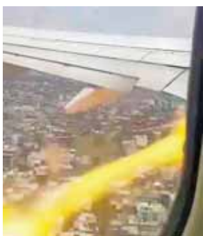
A Delhi-bound SpiceJet airplane catches fire mid-air, in Patna on Sunday

SpiceJet plane lands at airport, passengers safe