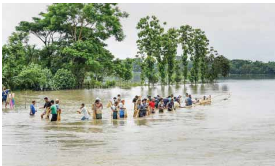
Villagers catch fish at a flooded area after heavy rains, in Nalbari district, in Assam on Sunday

According to the daily flood report of the ASDMA, eight people lost their lives in various places due to the floodwaters. The death toll in this