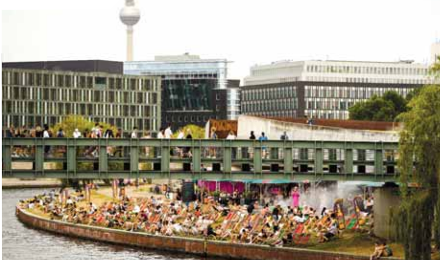
People enjoy a summer day at a bar at the river Spree in central Berlin, Germany