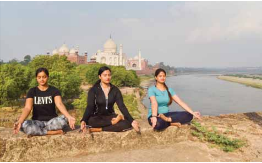
Women perform yoga asanas on the bank of the Yamuna river, behind the Taj Mahal, ahead of the International Day of Yoga, in Agra, Sunday

CRPF's 'Madadgaar' helpline has handled over nine lakh calls and helped more than 37,000 families in its five years of operation, officials said here on Sunday. The Srinagar-based 24x7 helpline—14411—was set up on June 16, 2017 to help the people of Kashmir. "The CRPF Madadgaar Helpline has completed five years of operation. So far, it has handled more than nine lakh calls and provided assistance to more than 37000 families across Jammu and Kashmir," officials said. The helpline played a vital role in