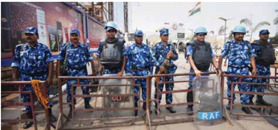
Security personnel outside Patna railway station after several trains were cancelled due to protests against the Centre's 'Agnipath' scheme, in Patna on Sunday