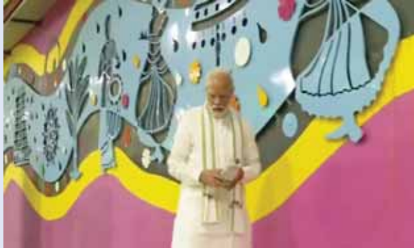
"Commitment to cleanliness is an article of faith for the Prime Minister. Even at the inauguration of the ITPO tunnel, he