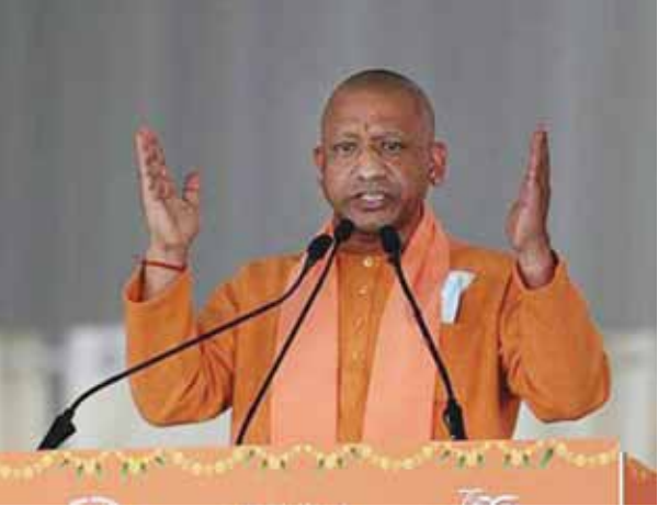
PNS ■ LUCKNOW

Chief Minister Yogi Adityanath, on Sunday, appealed to the youth not to get misled by the propaganda of Opposition parties against the Agnipath scheme as it was in their interest. He pointed out that the scheme, which has been lauded by the world, would not only see employment of 10 lakh