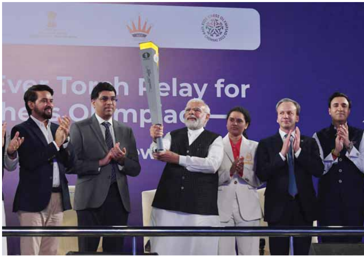
Prime Minister Narendra Modi with Union Minister for Youth Affairs and Sports Anurag Thakur, Indian chess grandmaster Viswanathan Anand and FIDE president Arkady Dvorkovich during the launch of torch relay for the 44th Chess Olympiad, at Indira Gandhi Stadium in New Delhi on Sunday