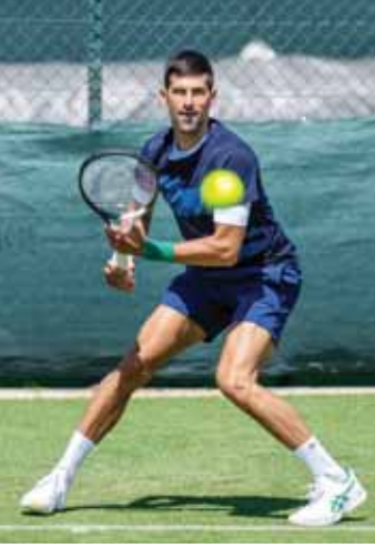
That wasn't the case at the French Open last month, when Nadal beat Djokovic in the quarterfinals en

This time, Novak Djokovic and Rafael Nadal will be on opposite sides of the draw. The seedings for Wimbledon were announced on Tuesday, with Djokovic and Nadal being Nos. 1 and 2, respectively, in the men's draw because of the absence of Daniil Medvedev and Alexander Zverev. The top-ranked Medvedev cannot take part as a result of the All England Club's decision to not allow players from Russia or Belarus to enter the event in 2022 over the invasion of Ukraine. Medvedev is Russian. The No 2-ranked Zverev is out because of an ankle injury. That means Djokovic and Nadal have been bumped up to being the top two seeded players and cannot now meet until the final.