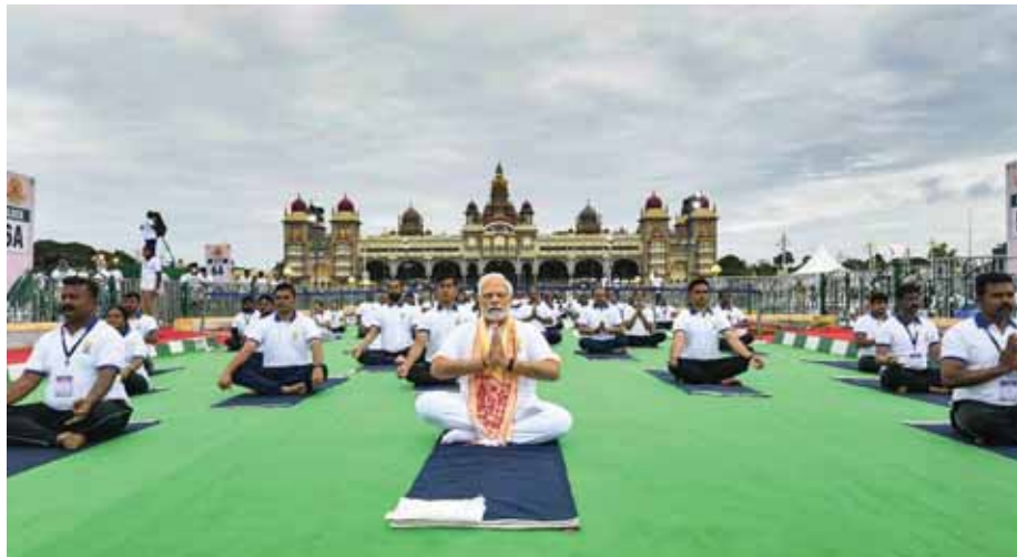
Prime Minister Narendra Modi performs yoga at a mass yoga session to celebrate the 8th International Day of Yoga at Mysore Palace in Mysuru on Tuesday