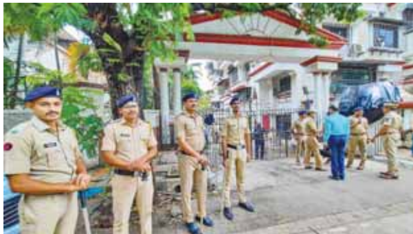
Policemen stand guard outside the residence of Shiv Sena leader Eknath Shinde, amid speculation of him joining the BJP, along with other Shiv Sena MLAs, in Thane on Tuesday

According to reports emanating from Surat, as many as 33 rebel Shiv Sena MLAs and four Independents — all supporters of Shinde — are being flown to Guwahati to ensure they don't return to the parent