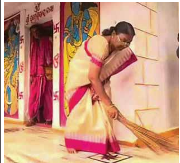
Jharkhand ex-Governor and NDA's Presidential candidate Draupadi Murmu sweeps at Purnandeswar Shiv temple in Rairangpur, Mayurbhanj, on Wednesday