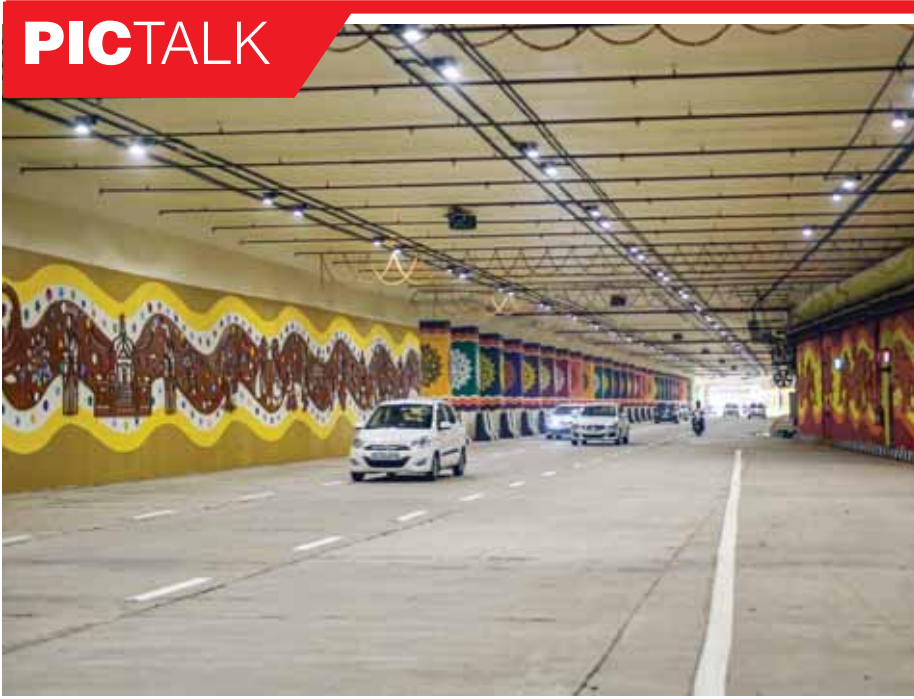
Vehicles move through the main tunnel of Pragati Maidan Integrated Transit Corridor in New Delhi on Wednesday

The Bharat Stage Emission standards are instituted by the Government to regulate air pollutants from motor vehicles. The Bharat Stage VI (or BS-VI) emission norm came into force from April 1, 2020 across the country.