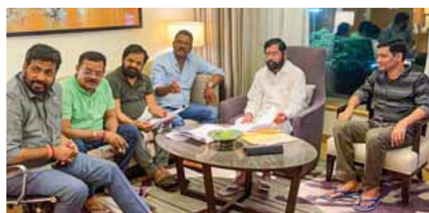
Rebel Shiv Sena leader Eknath Shinde with other MLAs at a hotel in Guwahati on Wednesday

Shinde's reaction came hours after Chief Minister Uddhav Thackeray reached out to the rebels, saying he would quit his post if even one Sena MLA comes and tells him on his face that he was incompetent. The Sena strongman, a Cabinet Minister, said the MVA, formed in