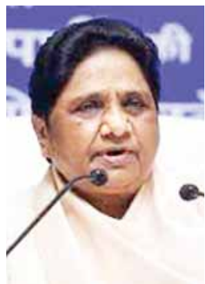
Mayawati made a strong appeal to the people to participate enthusiastically in the voting.