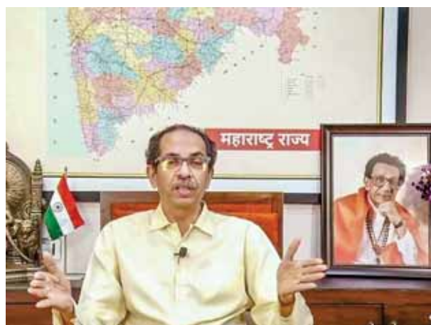
Maharashtra CM and Shiv Sena chief Uddhav Thackeray virtually addresses the people of the State, in Mumbai on Wednesday

On part, Sena president and Chief Minister Uddhav Thackeray played an emotional card as he went live on Facebook and spoke to the people of Maharashtra, wherein he made it clear: "I have no greed for power. Nor would I remain stuck to the chair. Let the rebel MLAs come and tell me that I am not good enough to hold this position. I will quit as both