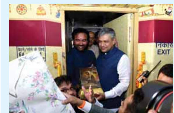
Union Minister for Railways, Communications, Electronics and Information Technology, Ashwini Vaishnav, and the Union Minister for Culture, Tourism and Development of North Eastern Region (DoNER), G. Kishan Reddy flag off 'Bharat Gaurav Tourist Train' on Shri Ramayan Yatra, in New Delhi on Tuesday.