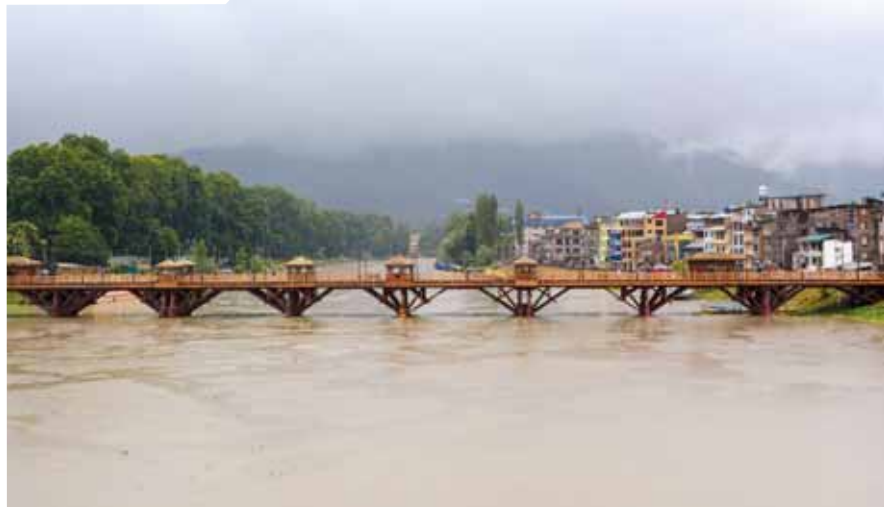
A view of the swollen Jhelum river following incessant rain, in Srinagar