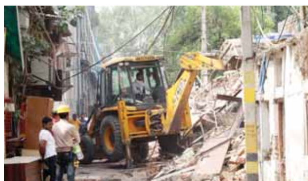
A bulldozer being used to demolish illegal structures during an anti-encroachment drive behind the Bahadur Shah Zafar Marg lane in New Delhi on Wednesday

removal drive, three JCB machines and five trucks were used. As many as 50 permanent structures in the form of shops, godowns, offices, tea stalls, etc were demolished and approximately 1,800 square metre of public land was freed," the MCD said in the statement.