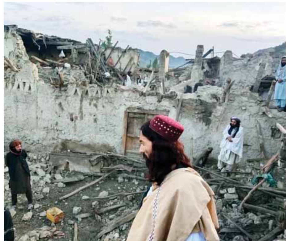
In this photo released by a state-run news agency Bakhtar, Afghans look at destruction caused by an earthquake in the province of Paktika, eastern Afghanistan, on Wednesday