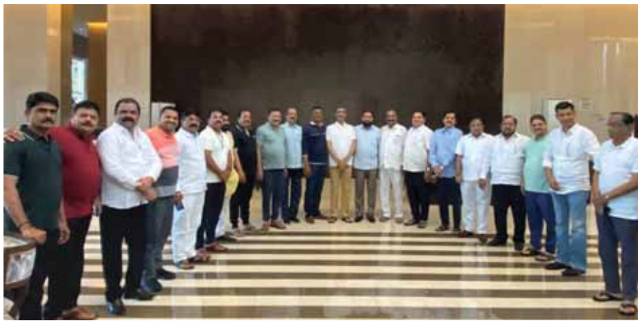
Shiv Sena leader Eknath Shinde along with other rebel Shiv Sena MLAs at a hotel in Guwahati on Friday

If the Deputy Speaker accepts the rebel Sena camp's claim that Shinde enjoys the support of 37 out of the total 55 Sena MLAs in the Assembly and declares him as the Sena legislature party leader, the