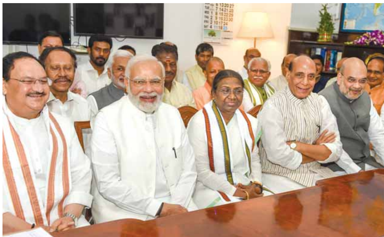
NDA candidate Draupadi Murmu files her nomination papers for presidential election in the presence of Prime Minister Narendra Modi, Union Ministers Rajnath Singh, Amit Shah, Nitin Gadkari and BJP president JP Nadda at Parliament House in New Delhi on Friday

Responding to a query on when will the political crisis in Maharashtra end, Shinde, a minister in the Uddhav Thackeray-led Government in the state, said things will be clear after some time. "Out of 55 Shiv Sena MLAs, 40 have come with me to Guwahati. In a democracy, the majority and numbers count," he said.