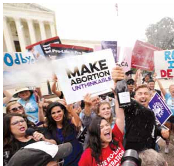
A celebration outside the US Supreme Court in Washington on Friday. The Supreme Court has ended constitutional protections for abortion that had been in place for nearly 50 years