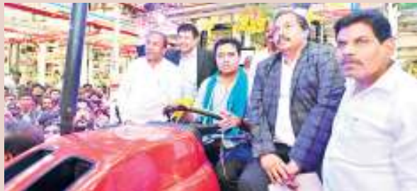
Minister for Municipal Administration K T Rama at the wheel of Mahindra's 300,000th Telangana-made tractor, which rolled out on Wednesday

Mahindra Tractors, part of Mahindra's Farm Equipment Sector, the world's largest tractor manufacturer by volume, rolled out its 300,000th Telangana-made tractor from the company's tractor manufacturing facility in Zaheerabad. Mahindra's 300,000th Telangana-made tractor was rolled out in the presence of Minister for Municipal Administration K T Rama at the wheel of Mahindra's 300,000th Telangana-made tractor, which rolled out on Wednesday