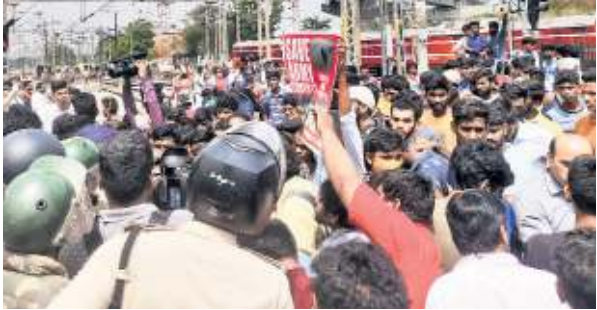
A group of Protestors facing the police on the railway tracks of Secunderabad Railway Station on June 17