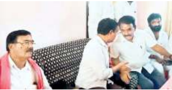
— KTR last week met Jupally Krishna Rao at his residence —