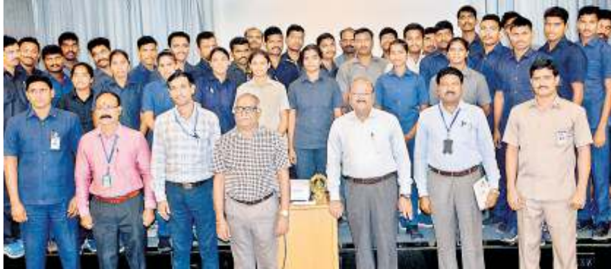
Intelligence officials participating in training programme in Hyderabad on Friday

The training model of GOCL focused on subjects like Safe Handling of Explosives and Detonators, Disposal of Explosives and Detonators, Precautions and