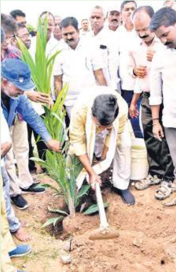
Minister for Agriculture S Niranjan Reddy planting oil palm sapling at Chityal village in Wanaparthi district on Saturday

To overcome import of edible oils from other countries, the farmers are required to focus attention on oil palm cultivation.