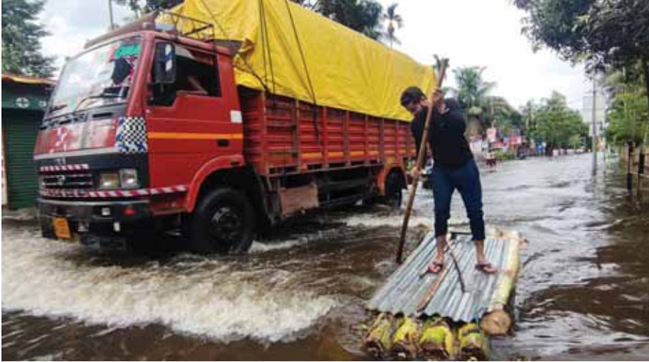
A man uses a makeshift boat to travel on a flooded road in Kamrup district in Assam on Friday