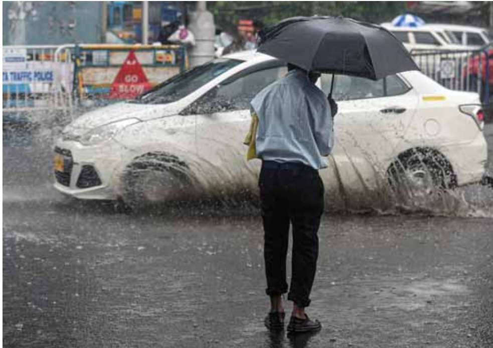
A vehicle plies on a road amid rain in Kolkata on Friday

Yadav, who is now the leader of the opposition, however, declined to comment on whether he foresaw any political instability in Bihar where the saffron party and Kumar’s JD(U) appear at daggers drawn, specially in the aftermath of ‘Agnipath’ scheme which triggered violent protests across Bihar. PTI