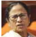
West Bengal CM —Mamata Banerjee

Why are you (BJP) disturbing the Assam Govt when they are facing floods?