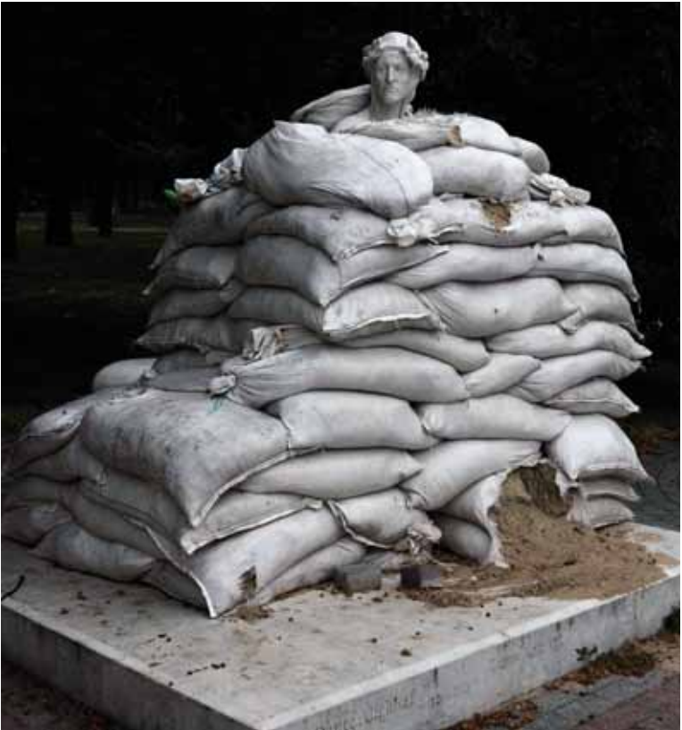
The sculpture of prominent Italian poet Dante Alighieri, is protected by sandbags, on Vladimir's Hill in Kyiv, Ukraine