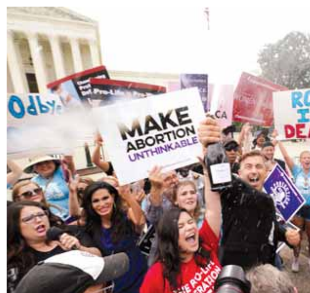
A celebration outside the US Supreme Court in Washington on Friday. The Supreme Court has ended constitutional protections for abortion that had been in place nearly 50 years

It puts the court at odds with a majority of Americans who favored preserving Roe, according to opinion polls. The ruling came more than a month after the stunning leak of a draft opinion by Justice Samuel Alito indicating the court was prepared to take this momentous step. See P10