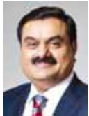
Asia’s richest person —Gautam Adani

This (₹60,000 crore) is one of the largest transfers to a foundation in Indian corporate history.