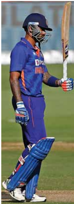
■ MALAHIDE

Dashing stroke-players Suryakumar Yadav and Sanju Samson will be returning to the India playing XI in place of Shreyas Iyer and Rishabh Pant in the two-match T20I series against Ireland starting Sunday.