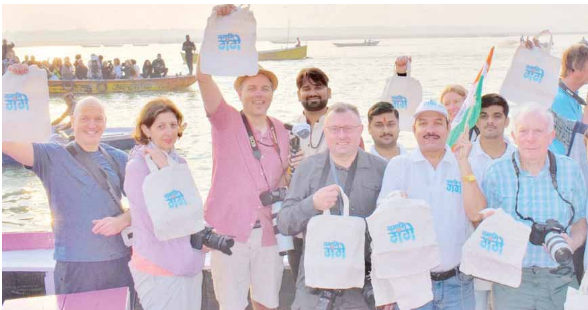
Foreign tourists supporting Namami Gange campaign in Varanasi on Friday.