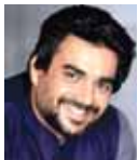
Actor —R Madhavan

Three films from down south did really well. Films in Hindi have also done well.