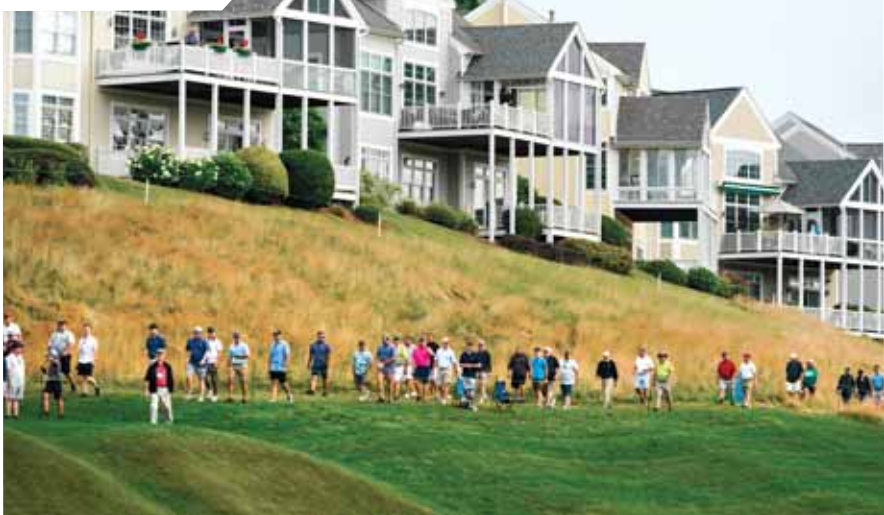
Crowds walk along on the 12th hole at the Travellers Championship tournament, at TPC River Highlands