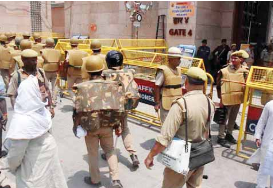
Tight security for Friday prayers at Gyanvapi mosque in Varanasi.

Amidst tight security arrangements, yet another Friday namaz at Gyanvapi mosque passed off peacefully in this holy city. It was the third Friday prayers since Kanpur violence over the controversial statement of suspended Bhartiya Janata Party (BJP) spokesperson Nupur Sharma when the district administration and Varanasi police commissionerate had made elaborate security arrangements not only at gate No 4, the entry point of Kashi Vishwanath Mandir and Gyanvapi Masjid but also in all the adjoining sensitive areas. Actually, in the city the local administration is facing a tough challenge for about seven weeks since the survey was done in Gyanvapi mosque on the instructions of the court. The matter became more sensitive when a section of pro-Hindutva forces intensified their movement demanding regular prayers of Adi Vishweshwar which was claimed to be found during the survey led by advocate commissioner in Gyanvapi mosque. In wake of such prevailing circumstances, the maintenance of law and order situations in this parliamentary constituency of Prime Minister Narendra Modi is a big challenge for the administration. It was the reason why right from the morning, heavy police forces were deployed both outside and inside the newly-constructed Shri Kashi Vishwanath Dham (Corridor)