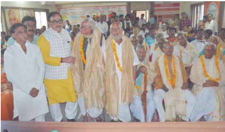
Union Minister Dr MN Pandey honouring Emergency fighters in Varanasi on Saturday evening.

Praising the role of Rashtriya Swayamsevak Sangh (RSS) and its frontal wings and narrating the memoirs of Emergency, he said that at that time he was a student of Banaras Hindu University (BHU) and being a member of the Akhil Bhartiya Vidyarthi Parishad (ABVP) he also opposed the Emergency and as a result of which he was sent to