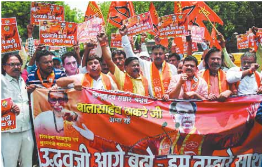
Shiv Sena supporters stage a protest in support of Chief Minister of Maharashtra Uddhav Thackeray at Jantar Mantar, in New Delhi on Sunday

Shiv Sena had filed a petition before the Deputy Speaker for disqualifying 16 rebel MLAs after they revolted against the party and pushed the Government on the brink of collapse. The Deputy Speaker's office has issued 'summons' to these MLAs, seeking written replies by the evening of June 27. In their petition filed in the top court, the rebel leaders have also challenged the appointment of Ajay Choudhary as the Shiv Sena Legislature Party