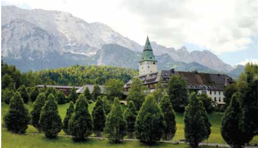
Castle Elmau and surroundings during the G7 summit in Kruen, near Garmisch-Partenkirchen, Germany