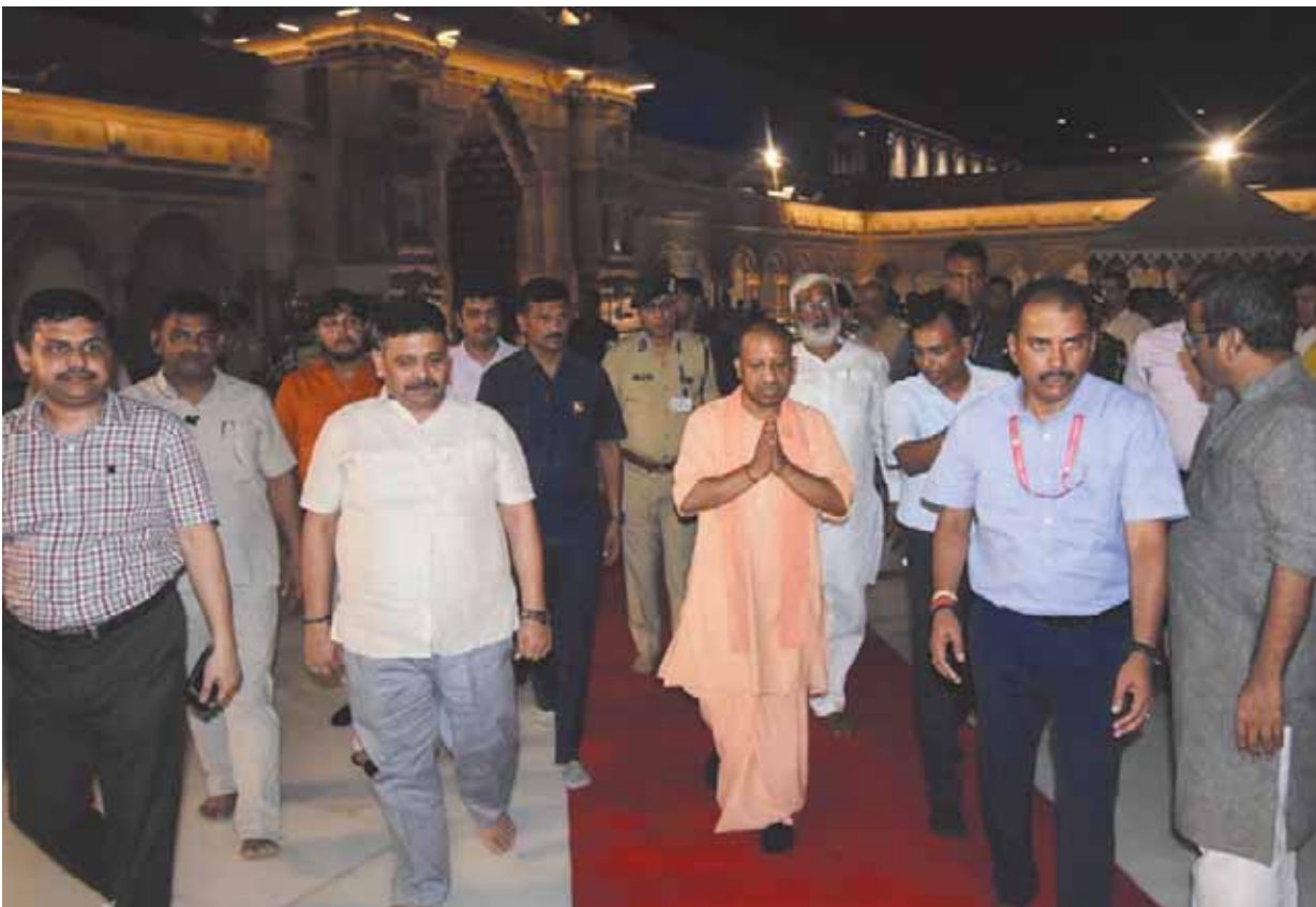
CM Yogi Adityanath inspecting Kashi Vishwanath Corridor in Varanasi on Saturday night.