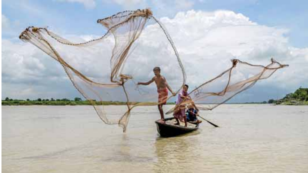
Fishermen spread fishing nets while sailing in the Hooghly river, in Nadia on Sunday