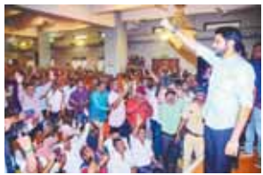
Shiv Sena leader Aaditya Thackeray during his interaction with party workers from Kalina and Kurla Assembly constituencies, at Santacruz, in Mumbai on Sunday

On a day when the Shinde camp prepared itself to battle it out both within and outside the State Assembly and the parent Sena camp went about the task of keeping its flock together, Aaditya, addressing the