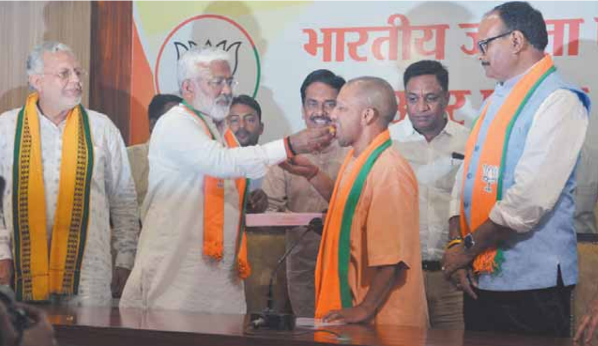
Bharatiya Janata Party state president and Cabinet Minister Swatantra Dev Singh offering sweets to Chief Minister Yogi Adityanath to celebrate the party's victory in Lok Sabha bypolls at BJP office in Lucknow on Sunday

Highlighting the success of the BJP in winning public support, Yogi said, "After the thumping victory in assembly