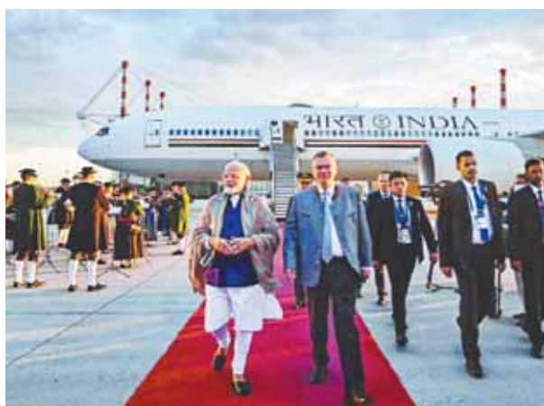
Prime Minister Narendra Modi being received by officials, upon his arrival in Munich, Germany on Sunday

However, he cautioned that June 26 marks the Emergency as well. "Today is June 26, which is also known for the day when India's democracy that is in the DNA of every Indian,