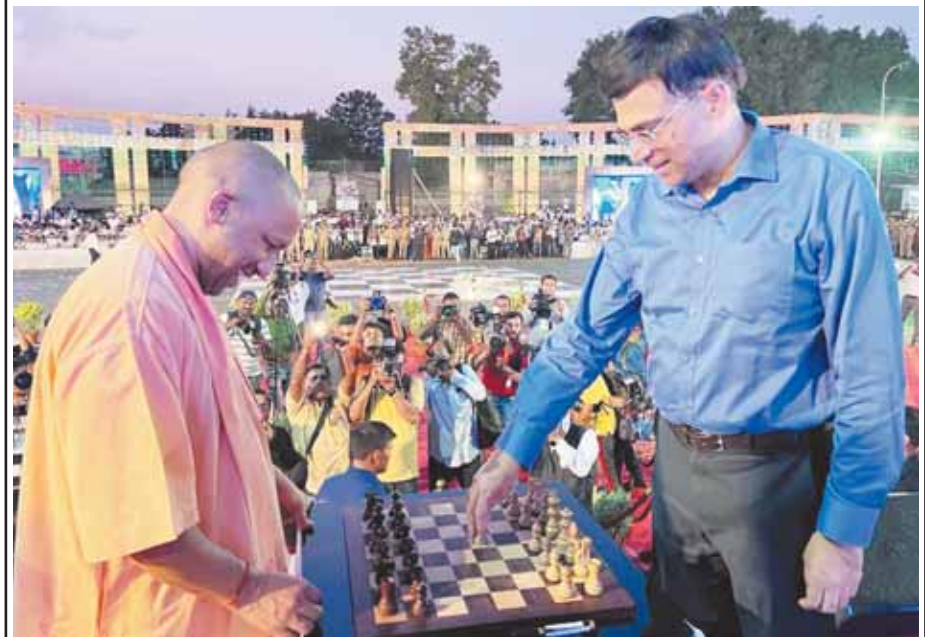
Viswanathan Anand making a ceremonial move on the chess board against Chief Minister Yogi Adityanath during the 44th Chess Olympiad Torch Relay event in front of Vidhan Bhawan in Lucknow on Sunday

The CBI has started a probe against three Income Tax department officials and nine private persons for allegedly facilitating fictitious refunds of