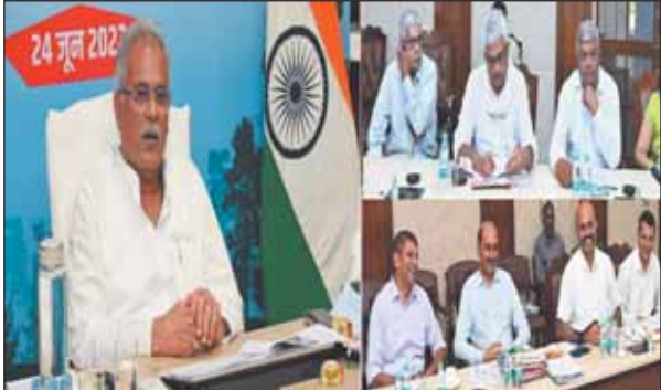
events based on the works and personality of Mahatma

Addressing a meeting of the Chhattisgarh Culture Council, Baghel also told officials to organize cultural