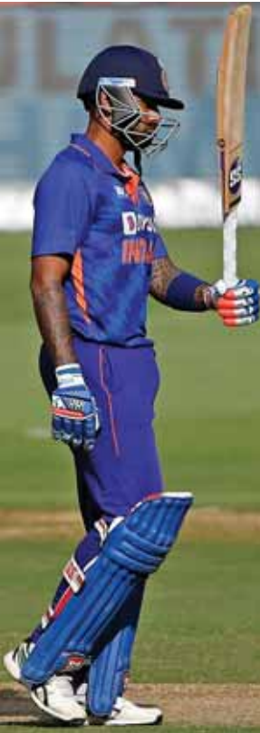
MALAHIDE

Dashing stroke-players Suryakumar Yadav and Sanju Samson will be returning to the India playing XI in place of Shreyas Iyer and Rishabh Pant in the two-match T20I series against Ireland starting Sunday.