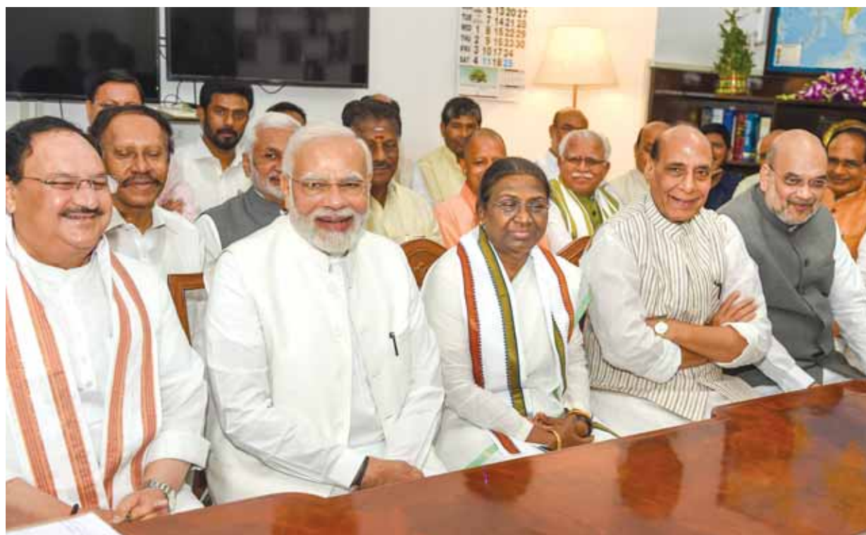
NDA candidate Droupadi Murmu files her nomination papers for presidential election in the presence of Prime Minister Narendra Modi, Union Ministers Rajnath Singh, Amit Shah, Nitin Gadkari and BJP president JP Nadda at Parliament House in New Delhi on Friday

Responding to a query on when will the political crisis in Maharashtra end, Shinde, a minister in the Uddhav Thackeray-led Government in the state, said things will be clear after some time. "Out of 55 Shiv Sena MLAs, 40 have come with me to Guwahati. In a democracy, the majority and numbers count," he said.