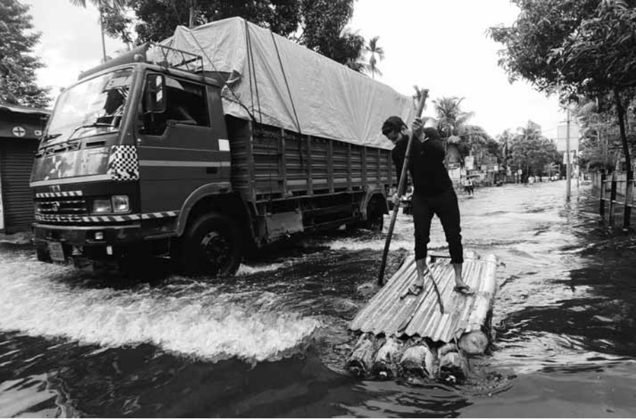
A man uses a makeshift boat to travel on a flooded road in Kamrup district in Assam on Friday