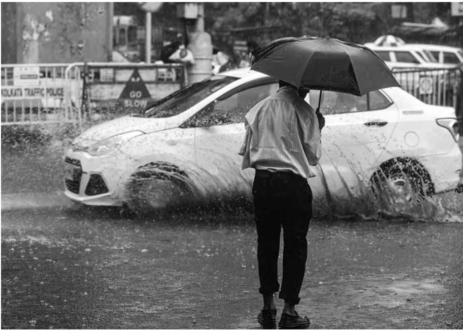
A vehicle plies on a road amid rain in Kolkata on Friday

Mumbai police have stepped up security at several locations including Shiv Sena ‘shakhas’ (local offices) in the city to prevent any untoward incident following Shinde’s rebellion. PTI