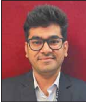
declared him dead.

Bhati sustained head injuries and was rushed to a hospital where doctors