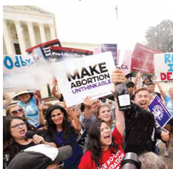
A celebration outside the US Supreme Court in Washington on Friday. The Supreme Court has ended constitutional protections for abortion that had been in place nearly 50 years

It puts the court at odds with a majority of Americans who favored preserving Roe, according to opinion polls. The ruling came more than a month after the stunning leak of a draft opinion by Justice Samuel Alito indicating the court was prepared to take this momentous step. See P9