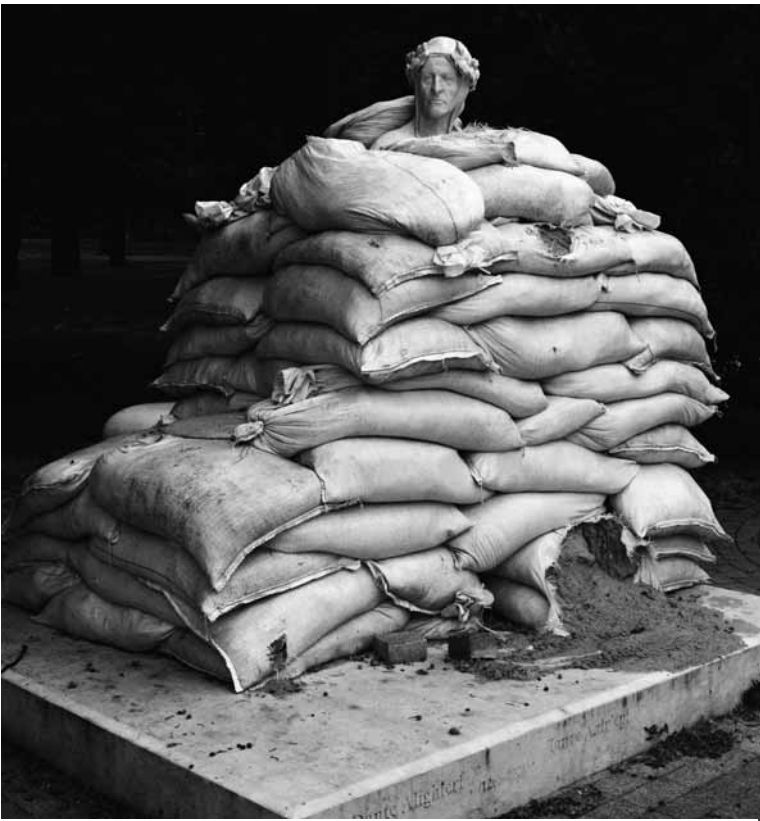
The sculpture of prominent Italian poet Dante Alighieri, is protected by sandbags, on Vladimir's Hill in Kyiv, Ukraine