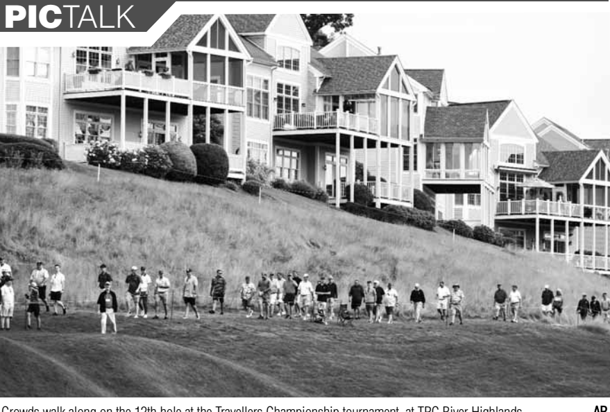
Crowds walk along on the 12th hole at the Travellers Championship tournament, at TPC River Highlands