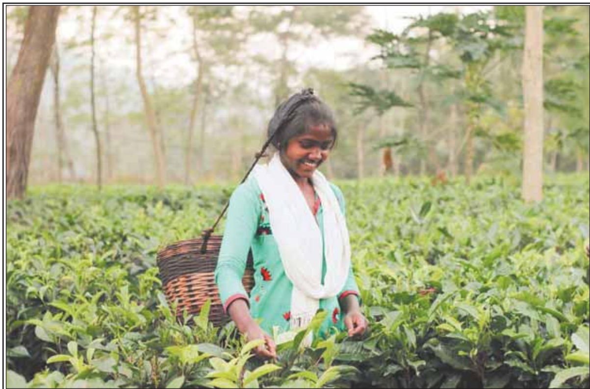
A girl plucking tea leaves in Sarudih village in Jashpur district of Chhattisgarh. The plateau and laterite soil helps in cultivating tea in the region.

Bhedia informed that more than 100 public buildings have been made barrier-free in the state capital to make public places accessible for the differently-abled. Naya Raipur has been developed barrier-free for the differently abled.