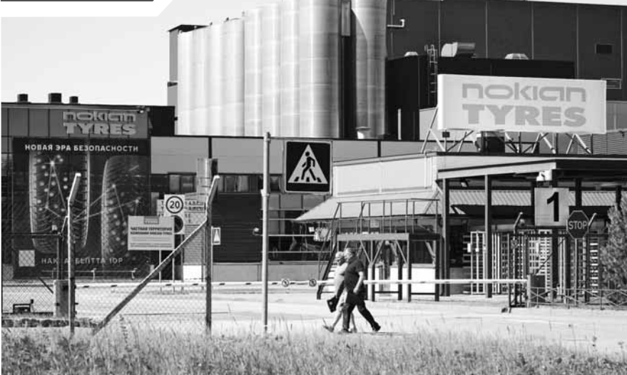
Men walk at the Nokian Tyres manufacturing plant in Vsevolozhsk, outside St Petersburg, Russia