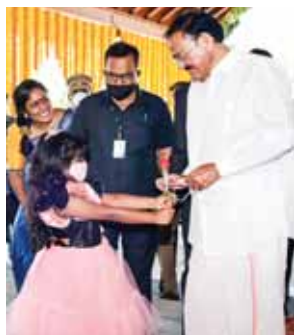
Vice President M Venkaiah Naidu being greeted by a young girl near Kelambakkam in Chennai

As per Article 68 of the Constitution, the election to fill the vacancy caused by the expiration of the term of office of the outgoing Vice President is required to be completed