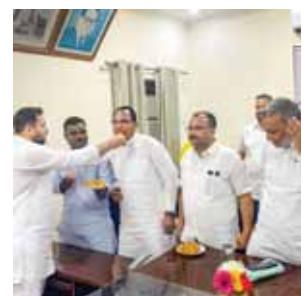
RJD leader Tejashwi Yadav offers sweet to AIMIM MLAs after they joined the RJD in Patna on Wednesday