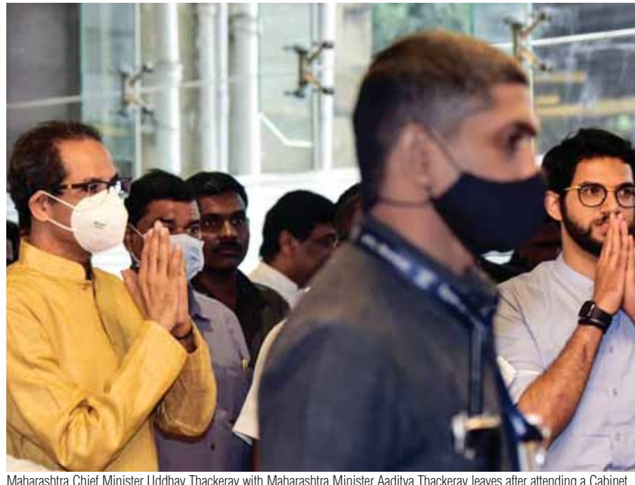
Maharashtra Chief Minister Uddhav Thackeray with Maharashtra Minister Aaditya Thackeray leaves after attending a Cabinet meeting, in Mumbai on Wednesday

Singhvi questioned the act of the Governor in showing undue haste in calling for floor test. "The Governor is bound to act on the aid and advice of the Council of Ministers. Here