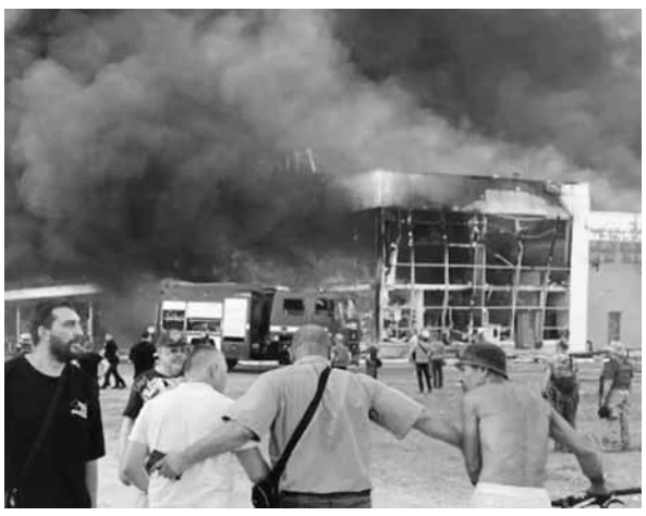
KREMENCHUK (UKRAINE)