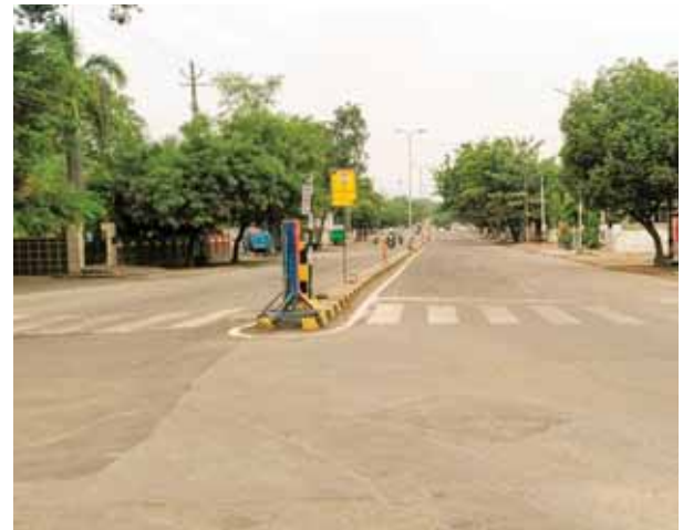
Streets wear a deserted look amid restrictions following the murder of tailor Kanhaiya on Tuesday, in Udaipur on Wednesday

Stones were hurled at a burial ground and some people tried to vandalise its gate as the procession passed by. Elsewhere in Rajasthan, markets were closed in Sojat (Pali), Bhinmal and Sanchore (Jalore) and Reodar (Sikar) in protest