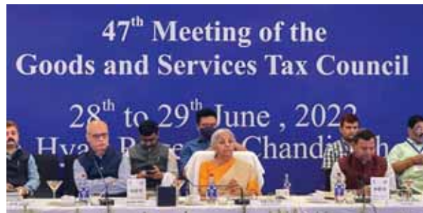
Union Finance Minister Nirmala Sitharaman chairs the 47th meeting of the GST Council in Chandigarh on Wednesday

However, the council decided to refer the report of