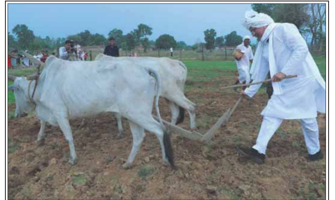
Chhattisgarh Chief Minister Bhupesh Baghel on Wednesday ploughed a field with a pair of oxen in Paradol village in Manendragarh assembly segment. He also sowed paddy seeds.

Appreciating the officers and employees, he said the feedback from the people was excellent. He urged to keep going a good job.