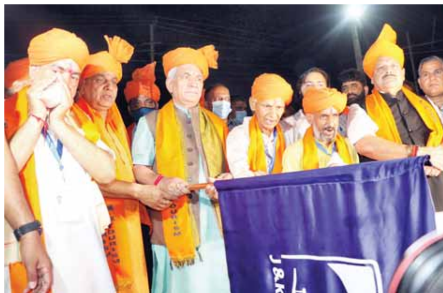
Jammu & Kashmir Lt Governor Manoj Sinha flags off the first batch of pilgrims for the Amarnath Yatra 2022 after conducting a puja at the Bhagwati Nagar base camp in Jammu on Wednesday

The atmosphere inside the base camp was upbeat since