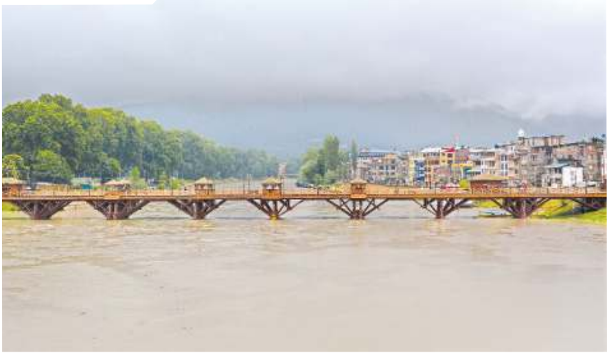
A view of the swollen Jhelum river following incessant rain, in Srinagar