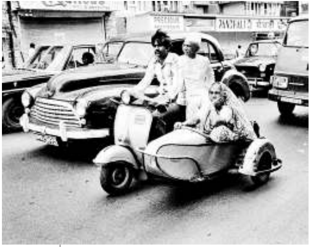
Family on a scooter, Bombay, 1976