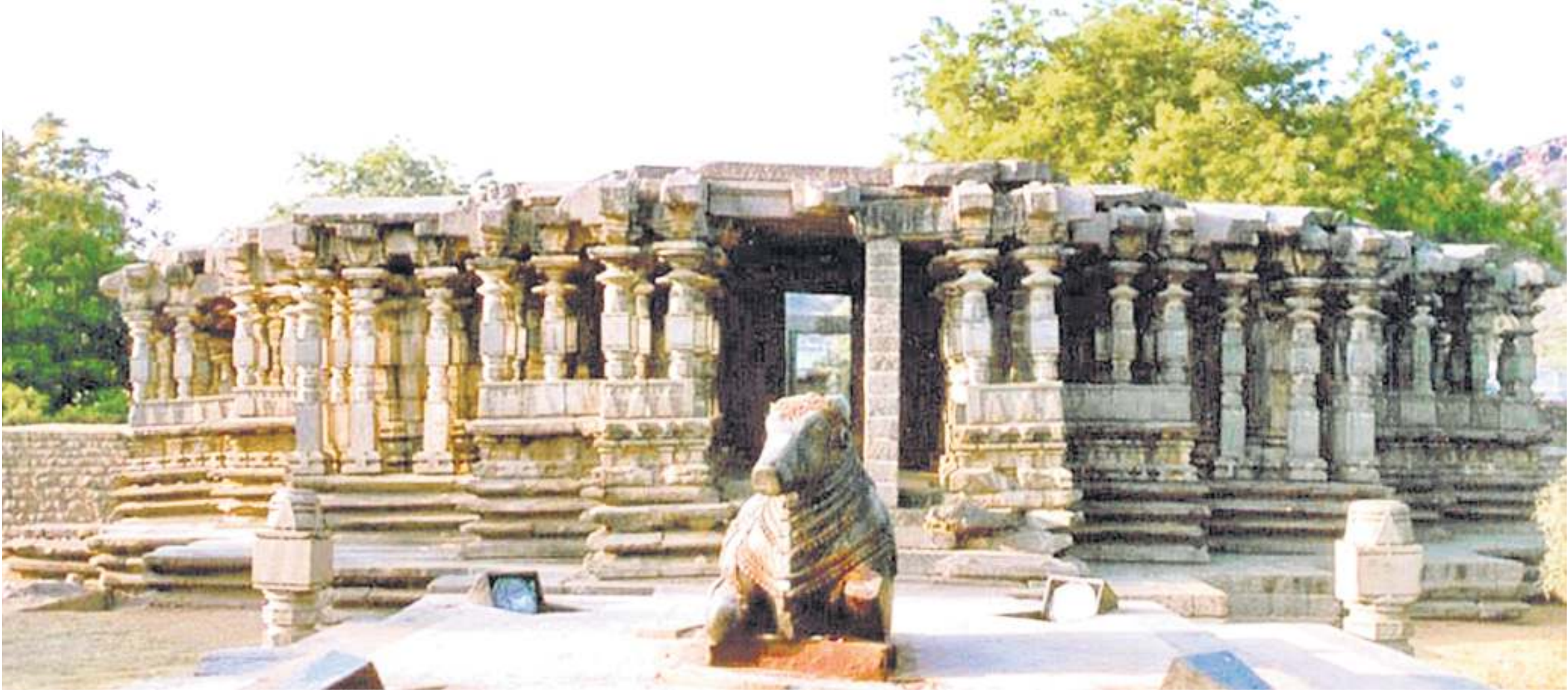
Thousand Pillar Temple, Warangal