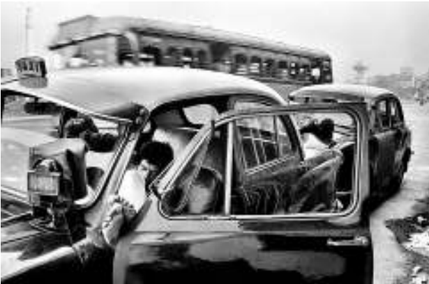
Siesta for taxi drivers, Kolkata, 1990