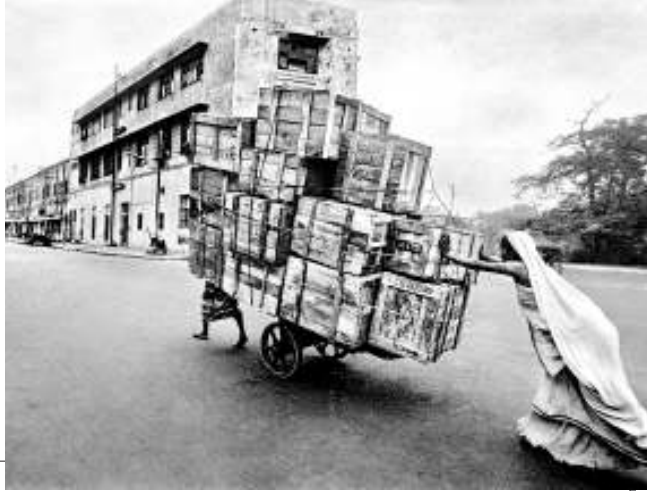
Cart pusher, Delhi, 1979