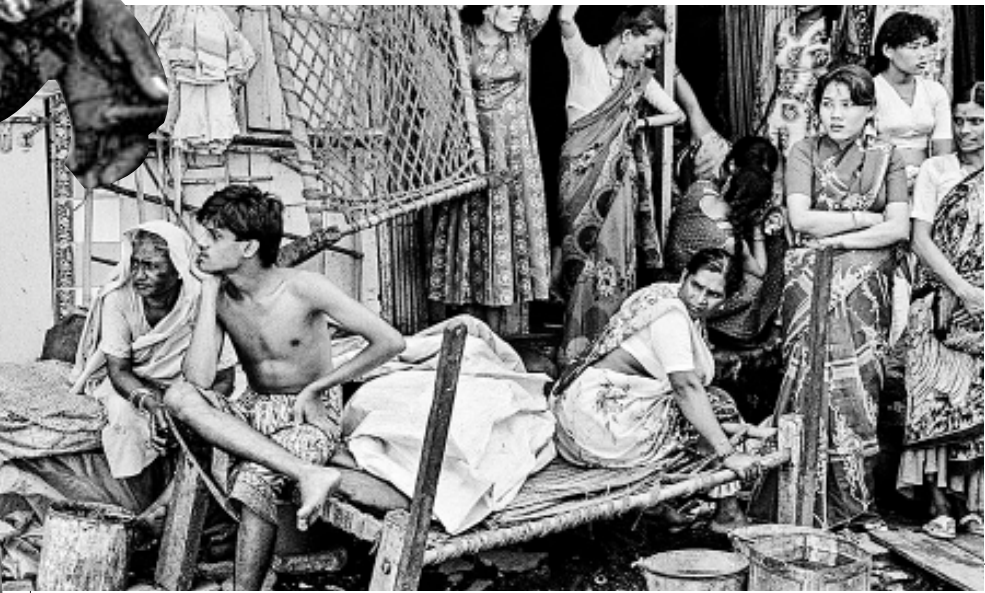
Women of Kamathipura red light district, Bombay (now Mumbai), 1987