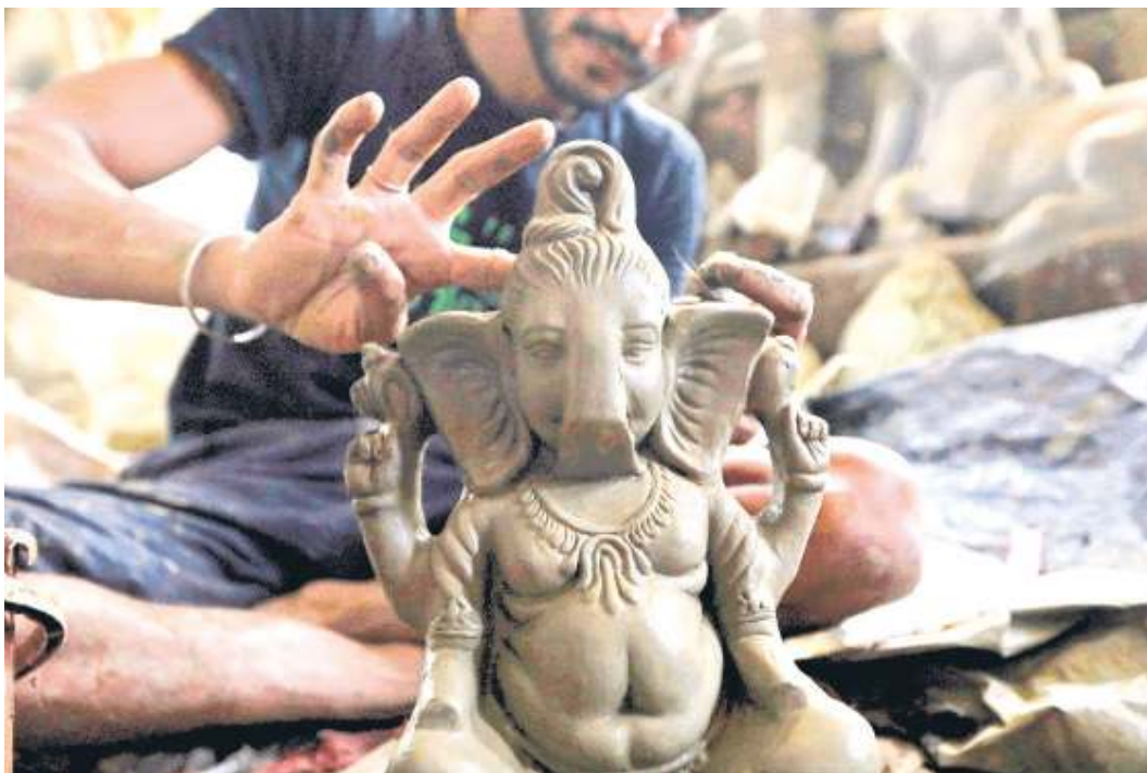
An artisan prepares eco-friendly idols of god Ganesha for Ganesh Chaturthi festival in Hyderabad on Saturday

India's overall economy during Mughals was several times more than many European countries which attracted many Europeans to India. It is believed that the only reason of this richness and prosperity was peace and tranquility. However, economic destruction began during the British rule. They divided people along religious lines in order to loot India's resources. People were dying in starvation but the British were busy draining the wealth of India.