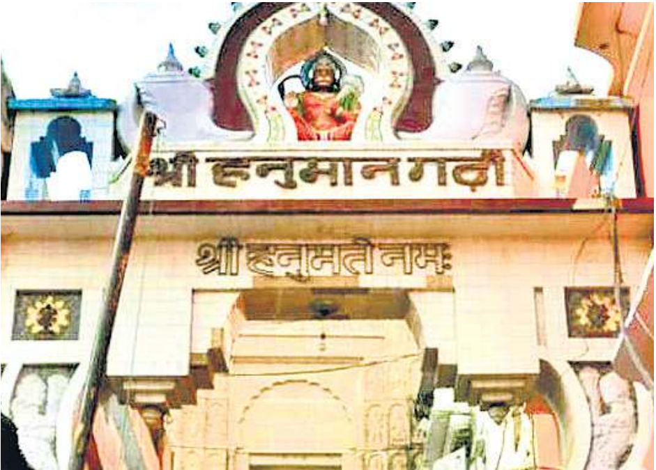
Hanumangarhi Temple, Ayodhya

IBRAHIM ADIL SHAH II (1580 CE TO 1627 CE) WAS A GREAT PATRON OF MUSIC AND IS CREDITED WITH THE COMPOSITION OF KITAB I NAURAS, A BOOK OF COUPLETS AND VERSES DEDICATED TO HINDU DEITIES AND MUSLIM SAINTS. WHAT IS OF INTEREST IS THAT MOST ARE DEDICATED TO SARASWATI, GANESH, AND OTHER HINDU DEITIES. THE TEXT BEGINS WITH AN INVOCATION TO GODDESS SARASWATI FOR HER BLESSINGS AND FAVOURS. DESCRIPTIONS OF LORD GANESH AND LORD SHIVA HAVE BEEN BEAUTIFULLY DESCRIBED BY THE SULTAN IN HIS COMPOSITIONS