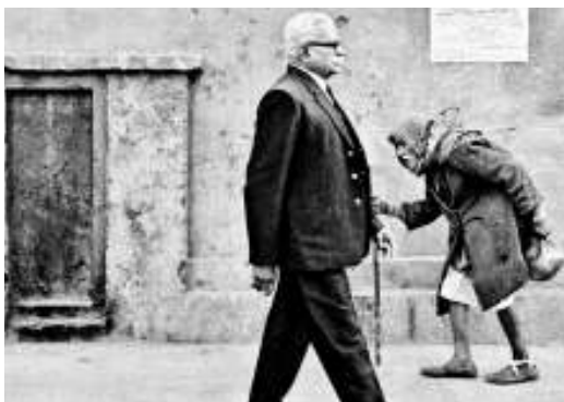
Two men, old Delhi, 1970

"A picture speaks a thousand words," goes a maxim. Although mobile phones have made photography a click away on one's palm and that too in true-to-life colours, there is nothing to match a black-and-white photograph in terms of its fidelity to detail. Yesteryear photographers who had struggled for hours in dark rooms to get the right shade of light on the photographic paper will vouch for this. Delhi-based PHOTOINK recently organised an exhibition that threw the spotlight on time-honoured tradition of street photography. A collection of 23 photographs, the black and white streetscapes were shot by Ketaki Sheth, Pablo Bartholomew, Raghu Rai and Sooni Taraporevala, among the country's most celebrated photographers. The stunning photographs, spanning between 1970 and 2000, reflect the golden period of street photography in India. The Pioneer presents the choicest ones among them.