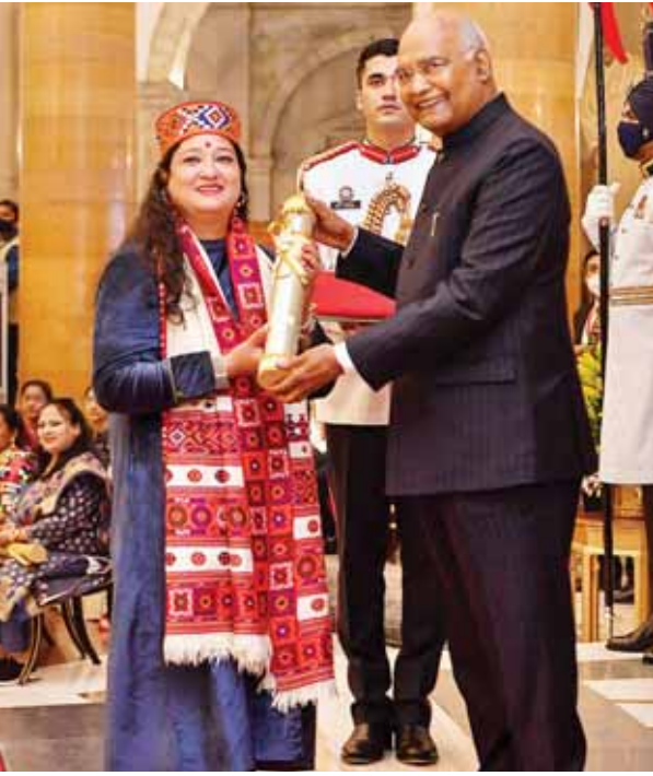
President Ram Nath Kovind honours awardees during the presentation of the Nari Shakti Puraskar for the years 2020 and 2021 on the occasion of International Women's Day, at Rashtrapati Bhavan, in New Delhi, on Tuesday