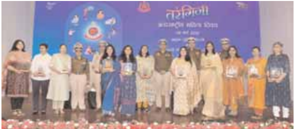
Delhi Police Commissioner Rakesh Asthana on Tuesday interacted with around 50,000 women from 1,784 police beats across the city on the occasion of International Women's Day through a hybrid platform “Tarangini”. THE PIONEER

“On the occasion of International Women's Day today, I salute the women who have achieved great heights despite all the challenges. I want to assure you that the Delhi Police is with you and we are working every moment to make your dreams come true,” said the Police Commissioner.