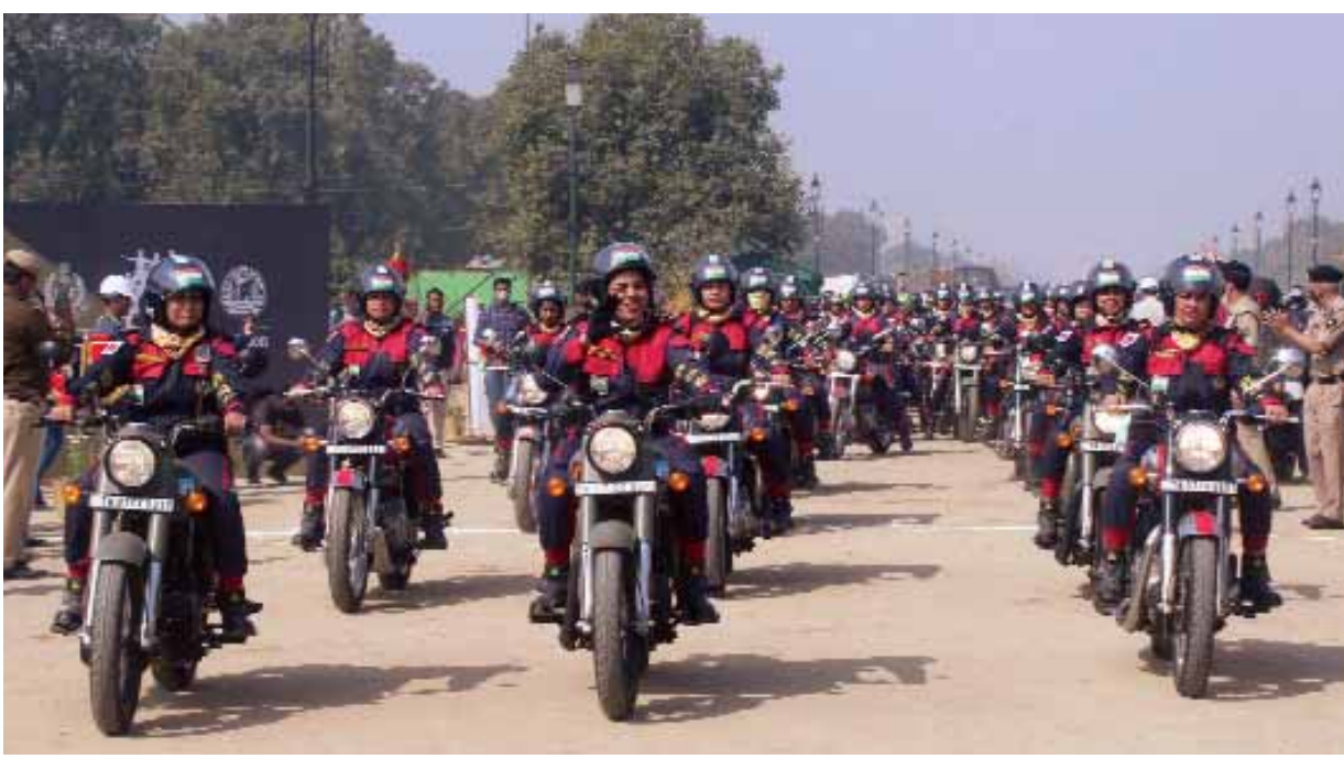
Members of Seema Bhawani Shaurya Expedition-Empowerment Ride 2022 of BSF during their flag off ceremony on International Women's Day, at India Gate, in New Delhi on Tuesday