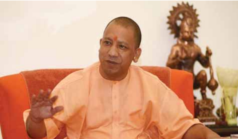
PNS ■ LUCKNOW

Congratulating people for creating history, Chief Minister Yogi Adityanath said that the people of Uttar Pradesh have reposed faith in the welfare policies of Prime Minister Narendra Modi, discarding politics of casteism, religion and dynasty. “This victory with a thumping majority is the blessing of 25 crore people of Uttar Pradesh. We accept this blessing, and we will take forward our principle of ‘sabka saath, sabka vikas, sabka vishwas and sabka prayas’ as per the aspirations of the people,” Yogi said during his address at state BJP headquarters in Lucknow on Thursday. Congratulating the office bearers and workers, Yogi expressed happiness over the historic victory of the BJP in