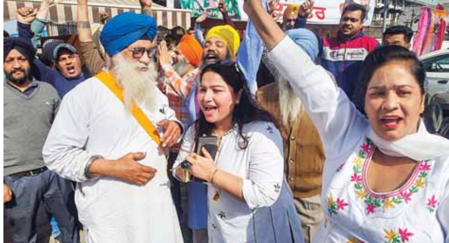
Aam Aadmi Party (AAP) supporters celebrate their party's lead during counting day of Punjab Assembly elections, in Amritsar on Thursday

AAP pushed the ruling Congress to the distant second spot with just 18 seats while limiting the State's regional outfit Shiromani Akali Dal to just three seats. State's political heavyweights, including five-time Chief Minister Parkash Singh Badal, two-time Chief Minister Capt Amarinder Singh, State's only woman Chief Minister Rajinder Kaur Bhattal, incumbent Charanjit Singh