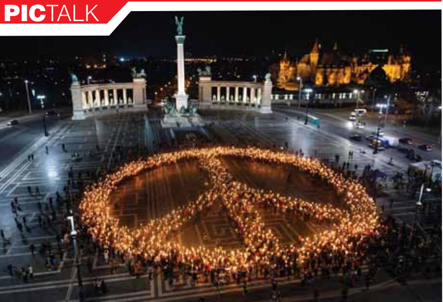
A Greenpeace demonstration for Ukraine at Heroes Square in Budapest, Hungary

anybody. Congress has to take the initiative first because it is losing the most. Legacy politics is no longer currency in a country where the young are in a majority and already struggling with their aspirations and have no time for, or clue about, what one's ancestors did and achieved. The results caution Congress against playing politics based on past laurels. The hara-kiri in Punjab and Uttarakhand is a classic example of not just the leadership's naivete but the arrogance of its lineage. The party will need a stronger justification for sticking to its leadership in the coming organisational elections. It has also to tackle the "revisionist" group within it has ignored so far and protected the 'first family' from. But how will it be protected from the people? Congress replaced a Chief Minister in Punjab and got decimated by a novice. BJP replaced two in Uttarakhand and still trounced Congress, the pre-poll favourite. On top of it all, Congress is challenged on the national turf by the emerging AAP. Is Arvind Kejriwal's party a softer ideological clone of BJP or a credible copy of what Congress could not be?