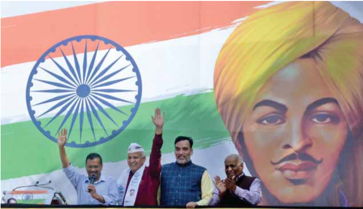
Delhi CM and AAP Convener Arvind Kejriwal, with party leaders Manish Sisodia and Gopal Rai, celebrates the party's win in Punjab Assembly polls, at the party headquarters, in New Delhi on Thursday,