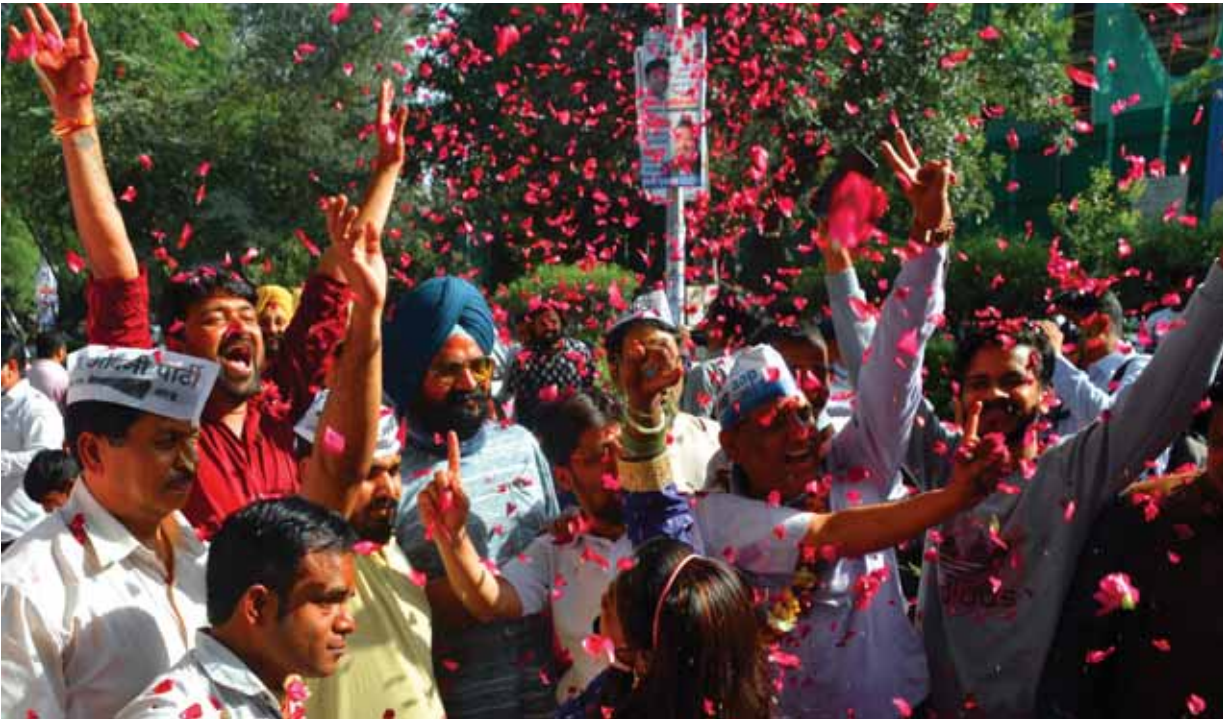
AAP supporters celebrate with flowers at the party office in New Delhi on Thursday