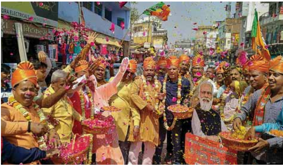
BJP supporters celebrate after landslide victory in the UP Assembly elections, in Varanasi on Thursday

With deft crisis management during the Covid pandemic and a rainbow of welfare programmes and much-improved law and order scenario, the BJP dislodged the caste-based identity politics of the SP and BSP and created a class-based vote bank that