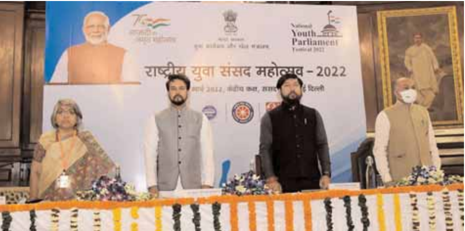
Union Minister for Youth Affairs & Sports Anurag Thakur addressed the inaugural session of the National Round of the 3rd edition of the National Youth Parliament Festival (NYPF) 2022 on Thursday in the central hall of Parliament, New Delhi. Minister of State of Youth Affairs and Sports Nisith Pramanik also graced the event

Many party leaders simply tweeted "Jai Shri Ram" to hail the trends projecting a big win for the party which is also ahead in Goa and Manipur. "The silent BJP voter gives the loudest message on poll day," BJP youth wing president Tejasvi Surya tweeted.