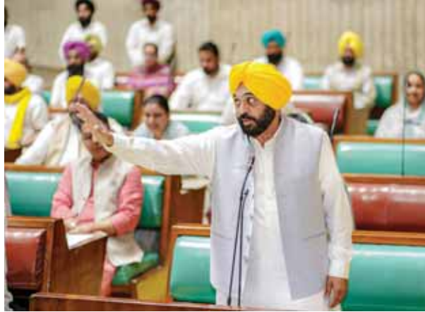
Punjab Chief Minister Bhagwant Mann addresses the Punjab Vidhan Sabha session, in Chandigarh on Tuesday

"Today AAP Punjab Govt has taken another historic decision and started the process to regularise 35,000 contractual Government employees...We're here to fulfil every promise made to people before the elec-