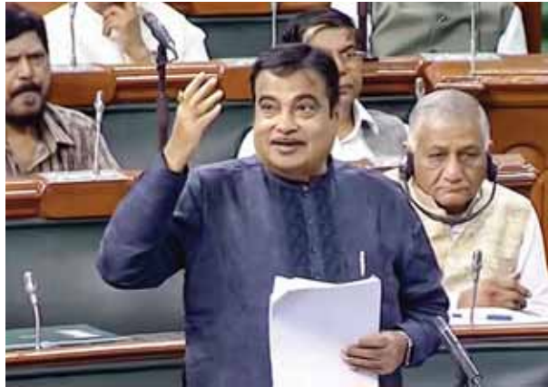
Union Minister of Road Transport and Highways Nitin Gadkari speaks in the Lok Sabha during the second part of the Budget Session of Parliament, in New Delhi on Tuesday

Replying in the Lok Sabha on the Demands for Grants for Road Transport and Highways Ministry, 2022-23, Gadkari said the transport and energy scene is rapidly changing with electric and solar energy,