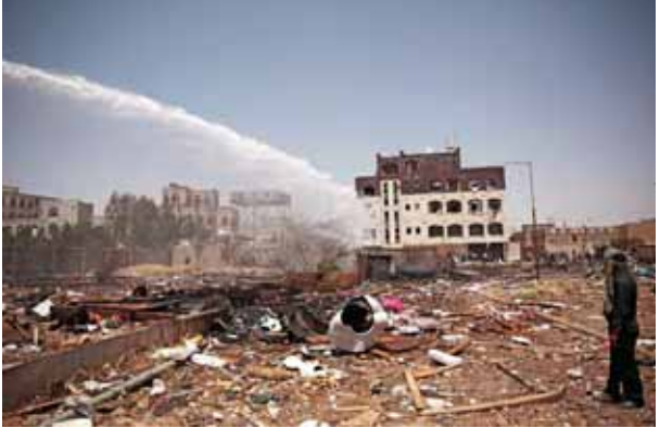
Firefighters extinguish the fire following Saudi-led airstrikes targeting two houses in Sanaa, Yemen. A Houthi media office claimed an airstrike hit houses for guards of the social insurance office, killing at least seven people and wounding three others, including women and children

The escalation is likely to complicate efforts by the U.N. Special envoy for Yemen, Hans Grundberg, to reach a humanitarian truce during the holy month of Ramadan” in early