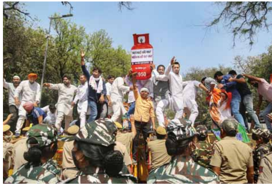
Indian Youth Congress (IYC) members stage a protest over the rising inflation and hike in prices of petrol, diesel and LPG cylinders, in New Delhi on Saturday

The decision was taken at the meeting of State Congress chiefs, General Secretaries, in-