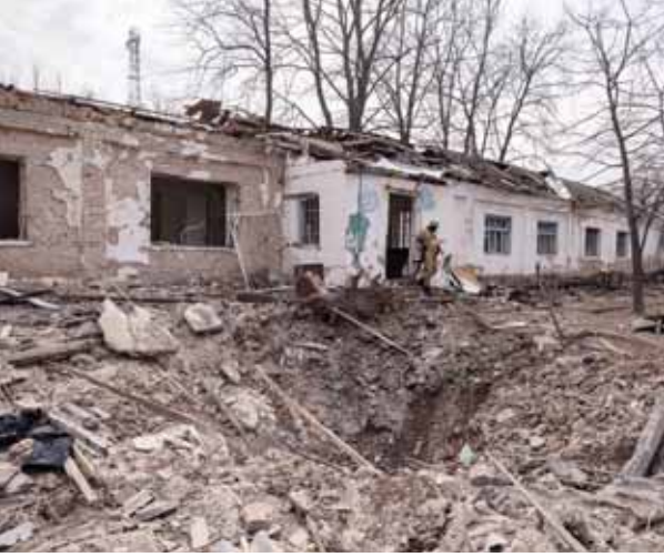
An Ukrainian soldier exits a Psychiatric hospital damaged by a Russian bombing earlier this week, in Mykolaiv, Ukraine on Friday

The fear is not misplaced. Russian bombs destroyed Chernihiv's main bridge over the Desna River on the road leading to Kyiv on Wednesday; on Friday, artillery shells rendered the remaining pedestrian bridge impassable, cutting off the last possible route for people to get out or for food and medical supplies to get in. Just over a month into the invasion, Russia's attack has slowed into a grinding war of attrition as its military tries to pound cities like Chernihiv into submission. Bombings of hospitals and other non-military