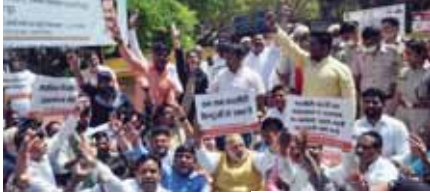
always attacked Sanatan dharma which is shameful. He said someone hurting the Sanatan dharma which believes in sarva dharma sadbhavana can never be pardoned.