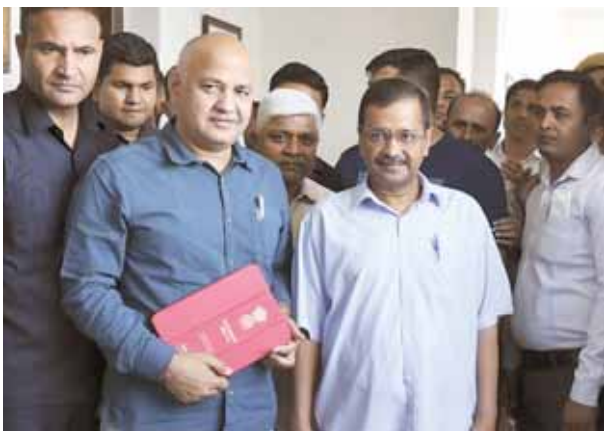
Delhi Dy CM and Finance Minister Manish Sisodia with Chief Minister Arvind Kejriwal before presenting the annual budget 2022-23 in Delhi Assembly, in New Delhi on Saturday

Under its 'Rozgar Budget', the Arvind Kejriwal Government will organise shopping festivals to promote retail and wholesale markets in the city, seeking to make these places attractive for tourists and