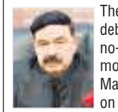
Pak Interior Minister — Sheikh Rashid

There will be a debate on the no-confidence motion on March 31; voting on April 3.