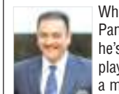
Former India coach — Ravi Shastri

When (Hardik) Pandya bowls, he's twice the player he is. He's a match-winner.