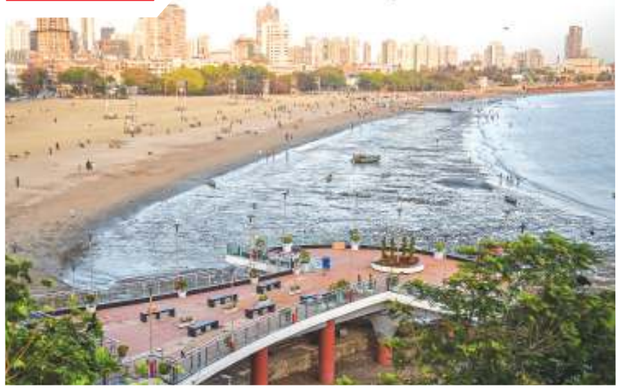
A view from the soon-to-be-inaugurated viewing deck, at Girgaum Chowpaty in Mumbai