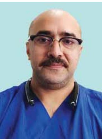
The writer is an expert in health care management

than hundred beds, fully-equipped with latest machines, contemporary Modular Operation Theatres, ICU,