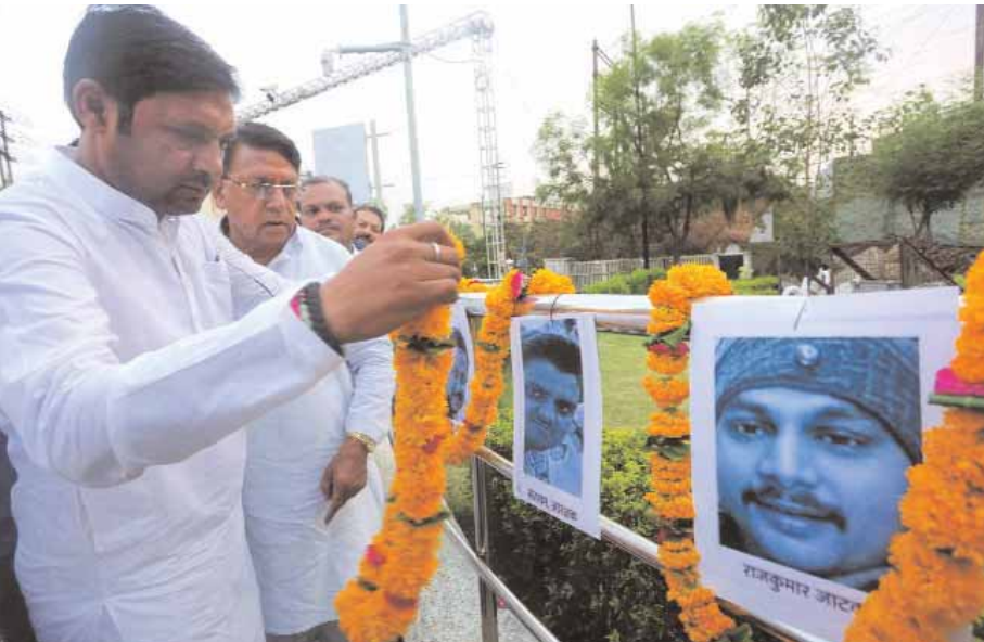
Congress party workers pay tribute to three police personnel who were killed by the poachers in Guna district, in Bhopal on Saturday.