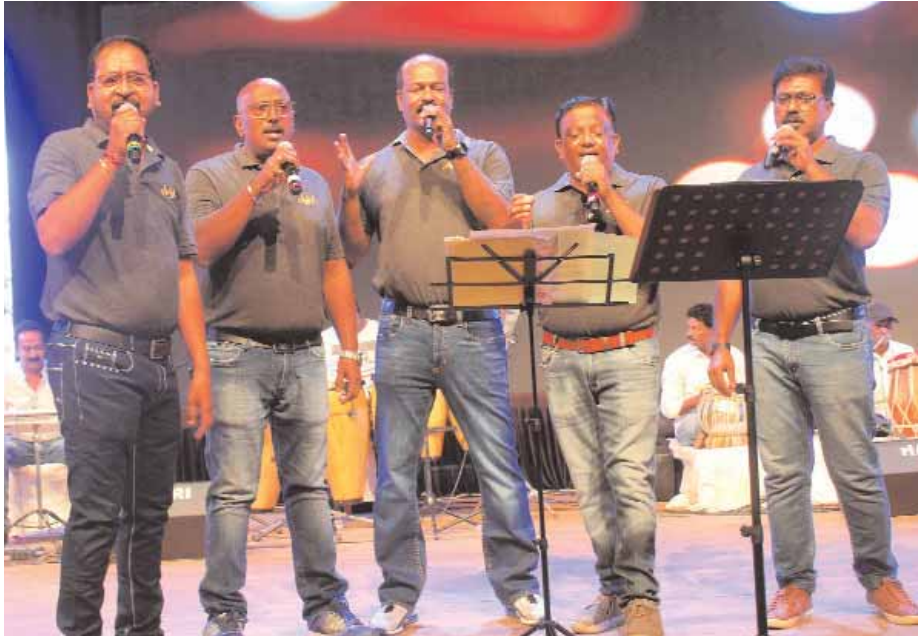
Artists from Anubhuti Melody group present songs at a cultural programme 'Nostalgic-90' at Ravindra Bhawan in Bhopal on Saturday.

the forecast. Severe heatwave observed at Nowgong and Khajuraho. Heat wave conditions observed at Rajgarh, Guna, Sagar, Damoh, satna, Gwalior, Sidhi, Rewa. Seven regions recorded day temperature above 46 degree celsius, Shivpuri (Karaira) - 47.3, Rajgarh - 47, Khajuraho - 47, Vidisha (Kurwai)- 46.9, Khargone 46.5, Khandwa - 46.1 and Guna - 46. In the prevailing weather conditions no active system is present which would provide relief in the next 3-4 days. After the advent of pre-monsoon little relief could be provided. The forecast of monsoon hitting Andaman in the last week of May is very pleasing and if monsoon movement is not disturbed much needed relief would be provided.