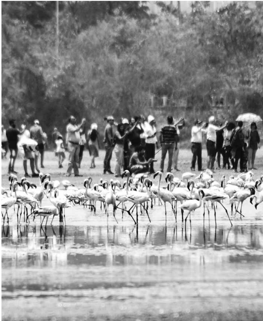
People click photos of a flock of flamingos standing in a pond during the Flamingo Festival on the occasion of World Migratory Bird Day, at Talawe wetlands in Navi Mumbai on Saturday