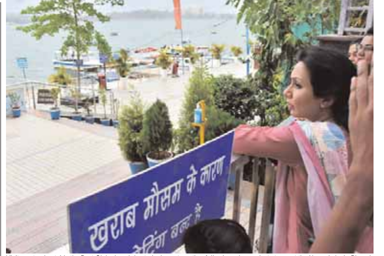
Visitors stand outside the Boat Club closed due to inclement weather following a heavy dust storm, at the Upper Lake in Bhopal on Monday.

Chief Minister Shivraj Singh Chouhan has expressed grief over the untimely demise of two persons in a fire accident in a chemical factory in Pachama Industrial Area of Sehore.