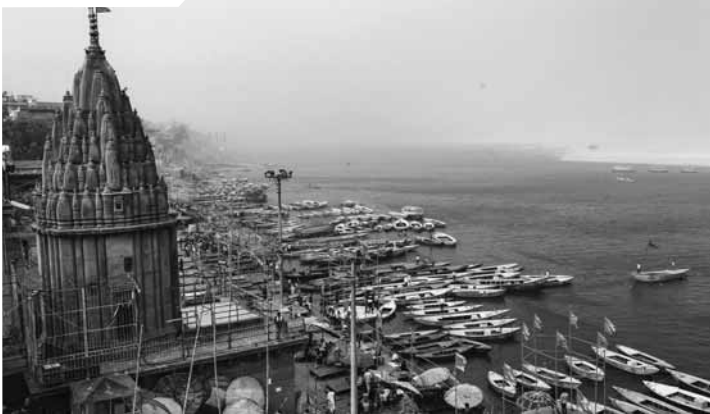
Anchored boats during a dust storm at a ghat in Varanasi