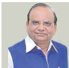
Vinai Kumar Saxena

"The President of India has accepted the resignation of Shri Anil Baijal as Lt Governor of National Capital Territory of Delhi. "The President of India has been pleased to appoint Shri Vinai Kumar Saxena to be the Lt Governor of National Capital Territory of Delhi with effect from the date he assumes charge of his office," read a communiqué issued by