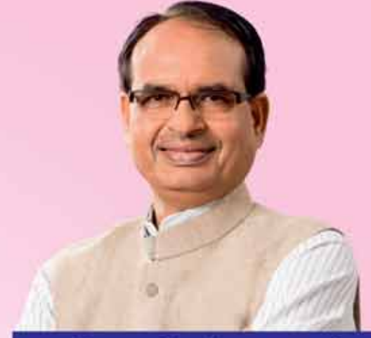
शिवराज सिंह चौहान, मुख्यमंत्री