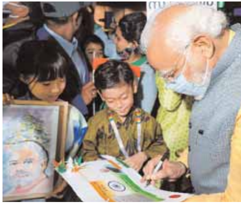
Prime Minister Narendra Modi on Monday fondly interacted with a boy who was waiting outside his hotel here and praised him for his fluency in Hindi and signed him an autograph in his tricolour drawing, in Tokyo on Monday

Terming this a vote of confidence in India's economic potential, Modi invited greater participation by Japanese companies in India and proposed celebrating Japan's contribution to India's