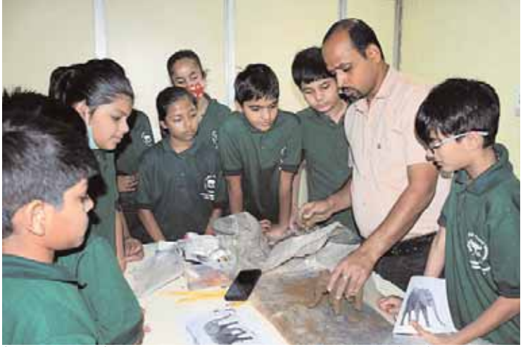
Children during Animal Clay Model Making Workshop at Regional Museum of Natural History (RMNH) in Bhopal on Monday.