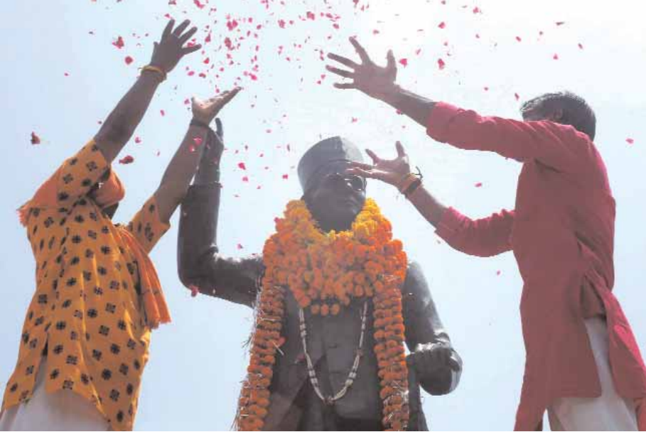
Bharatiya Janata Party (BJP) workers pay floral tributes at the statue of freedom fighter Veer Savarkar on his birth anniversary in Bhopal on Saturday.