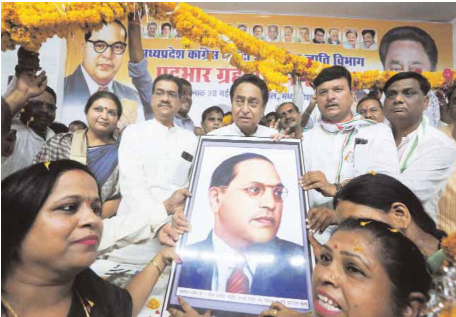
Congress State President Kamal Nath being garlanded during the party's SC cell workers meeting at PCC headquarters in Bhopal on Saturday.

unprecedented services during the Corona period in Madhya Pradesh. The state government has done the work of providing excellent health services by increasing the facilities in the state. The health of the people could be protected. President Kovind has travelled to small countries of the world to give a message of peace and harmony. He is felicitated on behalf of eight and a half crore people of the state on his arrival in Madhya Pradesh. Chouhan said that the President could not come to Madhya Pradesh due to Corona, but now he has come after Corona has been brought under control, for which we are grateful.