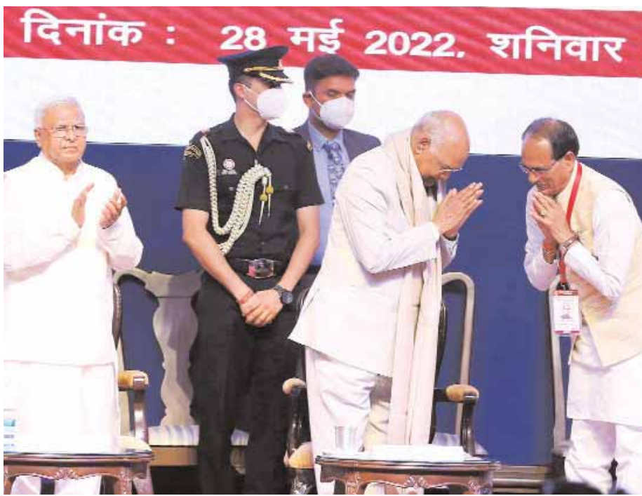
President Ram Nath Kovind being greeted by CM Shivraj Singh Chouhan at 'Arogya Manthan' programme on 'One Nation-One Health System-Is the Need of Hour' organised by Arogya Bharti in Bhopal on Saturday.