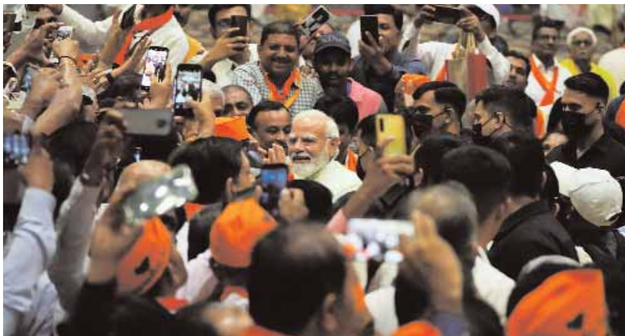
Prime Minister Narendra Modi greets the crowd at an event in Gandhinagar on Saturday

The UP Government has notified the exemptions to women workforce across all the mills and factories in the state under the powers vested in the Factories Act-1948 following the work plan of women employees.