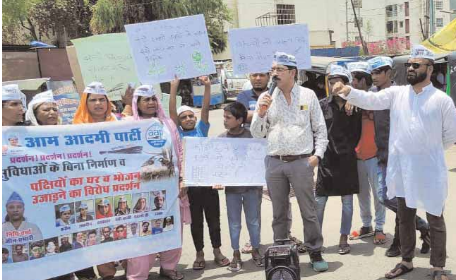
Aam Aadmi Party activists stage a protest against BMC over chopping of trees and destroying greenery despite the Supreme court orders, in Bhopal on Saturday.