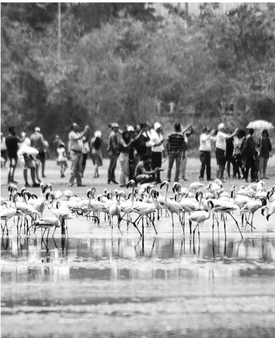
People click photos of a flock of flamingos standing in a pond during the Flamingo Festival on the occasion of World Migratory Bird Day, at Talawe wetlands in Navi Mumbai on Saturday