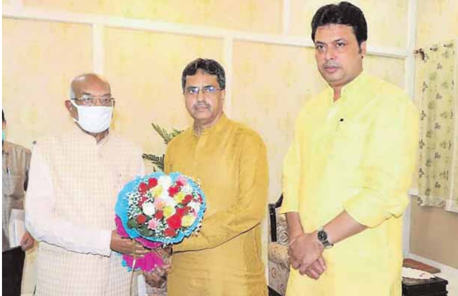
BJP leader Manik Saha meets Tripura Governor Satyadev Narayan Arya to stake claim to form the government, at Raj Bhavan in Agartala. Former Tripura Chief Minister Biplab Kumar Deb is also seen