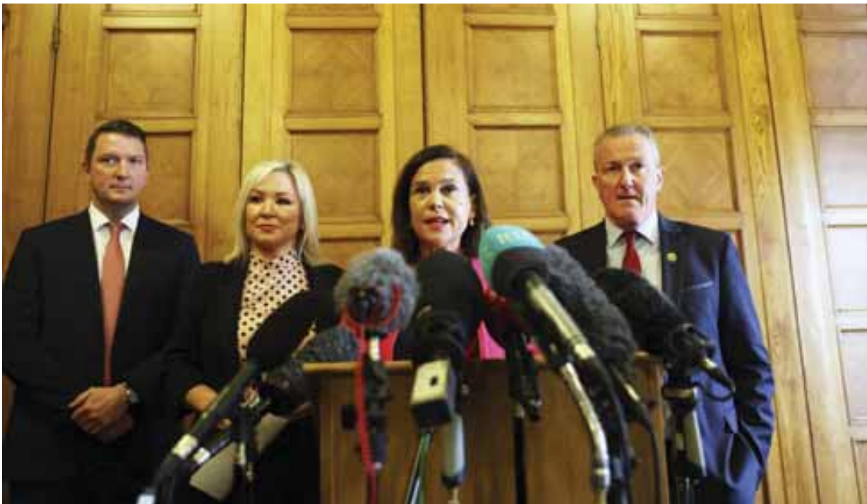
From left, Sinn Fein's John Finucane, deputy leader Michelle O'Neill, party leader Mary Lou McDonald, and Conor Murphy speak to the media at Parliament Buildings, Stormont, Belfast, on May 9

What is Sinn Fein all about? Why is its win so significant for Northern Ireland? The Irish phrase "Sinn Fein"