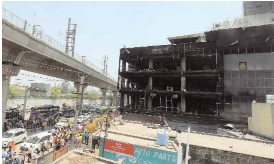
Security personnel and civil defence officials at the site, as NDRF personnel carry out rescue and relief work after a massive fire at an office building near the Mundka Metro Station, in West Delhi on Saturday

"We have found charred remains and it is difficult to ascertain whether they are of one person or more. Initial investigation suggests an explosion in an air-conditioner may