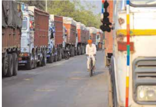
Trucks loaded with sacks of wheat stand at a wholesale grain market in Amritsar on Saturday

"The export policy of wheat is prohibited with immediate effect," the Directorate General of Foreign Trade (DGFT) said in a notification on Friday. However, the export shipments for which irrevocable letters of credit (LoC) have been issued on or before the date of this notification will be allowed, the DGFT