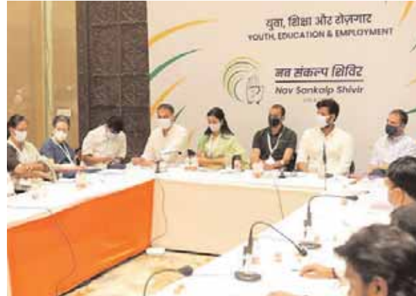
Congress interim president Sonia Gandhi with party leader Rahul Gandhi and others during a meeting on day 2 of the party's 'Nav Sankalp Shivir', in Udaipur

A section of leaders appeared to be pitching for a different candidate and another wanted to bring back Rahul Gandhi to lead the party,