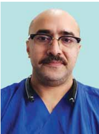
The writer is an expert in health care management

than hundred beds, fully-equipped with latest machines, contemporary Modular Operation Theatres, ICU,