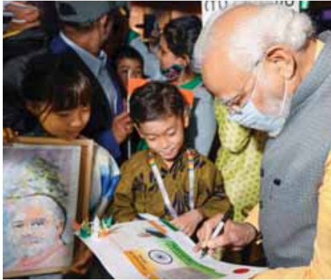
Prime Minister Narendra Modi on Monday fondly interacted with a boy who was waiting outside his hotel here and praised him for his fluency in Hindi and signed him an autograph in his tricolour drawing, in Tokyo on Monday

Prime Minister Narendra Modi on Monday underlined several steps taken for ease of doing business in India and invited Japanese industry to explore more investment opportunities here. Underlining India's robust economy, he said despite the slowdown in global Foreign Direct Investment (FDI), India attracted record FDI of USD 84 billion in the previous financial year. Terming this a vote of confidence in India's economic potential, Modi invited greater participation by Japanese companies in India and proposed celebrating Japan's contribution to India's development