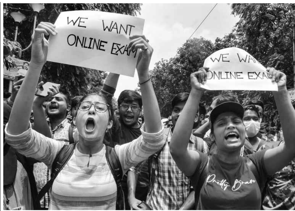
Students of Calcutta University raise slogans during a protest demanding online examinations, in front of the university's campus, in Kolkata

In Delhi, the morning temperature plunged 11 notches from 29 degrees Celsius to 18 degrees Celsius.