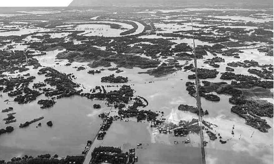
An aerial view of the flood-affected areas after heavy rainfall, in Assam