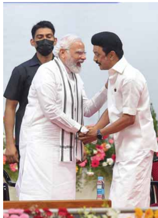
Prime Minister Narendra Modi greets Tamil Nadu Chief Minister MK Stalin during the ceremony for the laying of foundation stones of multiple developmental projects at Jawaharlal Nehru Stadium in Chennai on Thursday

He referred to the Subramania Bharathi chair at the Banaras Hindu University in his Varanasi constituency and the full funding to the Central Tamil Classical