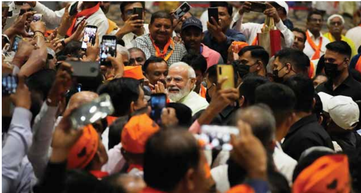
Prime Minister Narendra Modi greets the crowd at an event in Gandhinagar on Saturday

The UP Government has notified the exemptions to women workforce across all the mills and factories in the state under the powers vested in the Factories Act-1948 following the work plan of women employees.