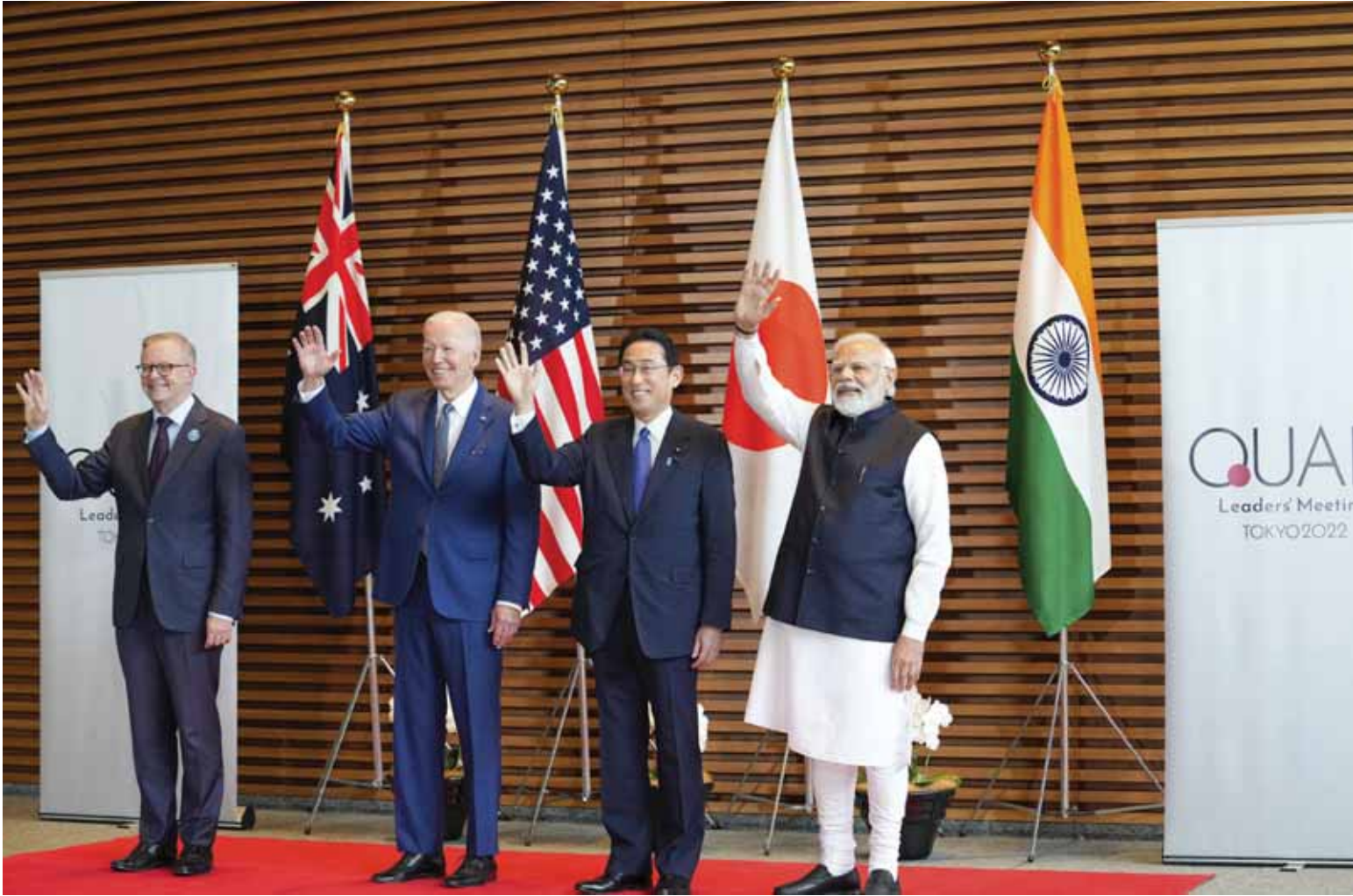
Leaders of Quadrilateral Security Dialogue (Quad) from left to right, Australian Prime Minister Anthony Albanese, US President Joe Biden, Japanese Prime Minister Fumio Kishida, and Indian Prime Minister Narendra Modi, pose for photo at the entrance hall of the Prime Minister's Office of Japan in Tokyo on May 24

The joint statement issued after the summit addressed the concerns emerging from the war in Ukraine. The statement underlined that the member countries “discussed respective responses to the conflict in Ukraine and the ongoing tragic humanitarian crisis and assessed its implica-