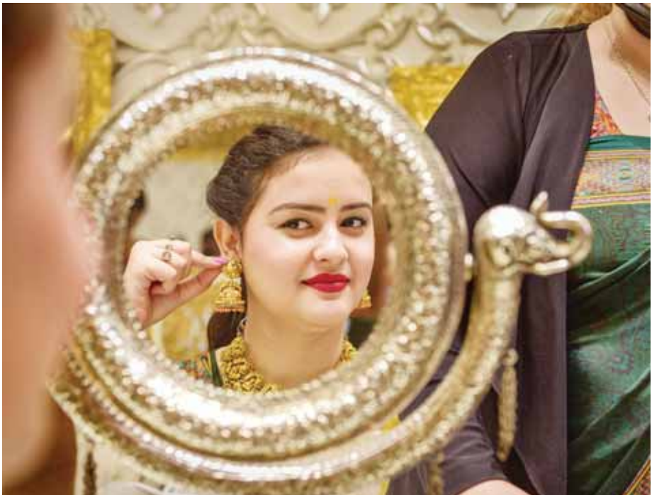
New Delhi: A woman tries jewellery at a showroom on the occasion of 'Akshay Tritiya', in New Delhi, Tuesday, May 3, 2022.