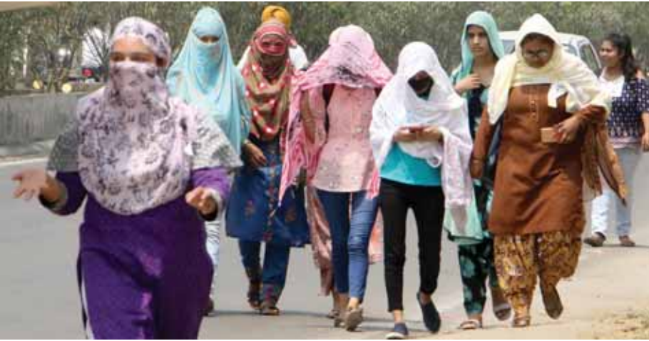
Women cover themselves with stoles to avoid the scorching heat on a hot summer day, in Amritsar

The India Meteorological Department (IMD) has attributed the frequent and prolonged spell of heatwave in April to absence of active western disturbances (WD) during the month. According to the IMD, the absence of active WDs in April over north India caused highly subdued rain and very less thunderstorm activities over northwest and central parts, leading to frequent and prolonged spell of heat wave to severe heat wave days and higher-than-normal temperature over these areas on most days. West Rajasthan, Himachal Pradesh, south Haryana-Delhi, west Madhya Pradesh and western parts of Uttar Pradesh experienced higher number of heat wave days and east Uttar Pradesh, east-central India reported lower number of heat wave days. Overall, the month recorded six WDs (April 1-4, 7-9, 13-15, 20-22, 23-25 and 28-29). However, most of them were feeble and dry and moved across higher ridges of Himalayas. Only last three systems caused gusty winds and dust-raising winds and dry