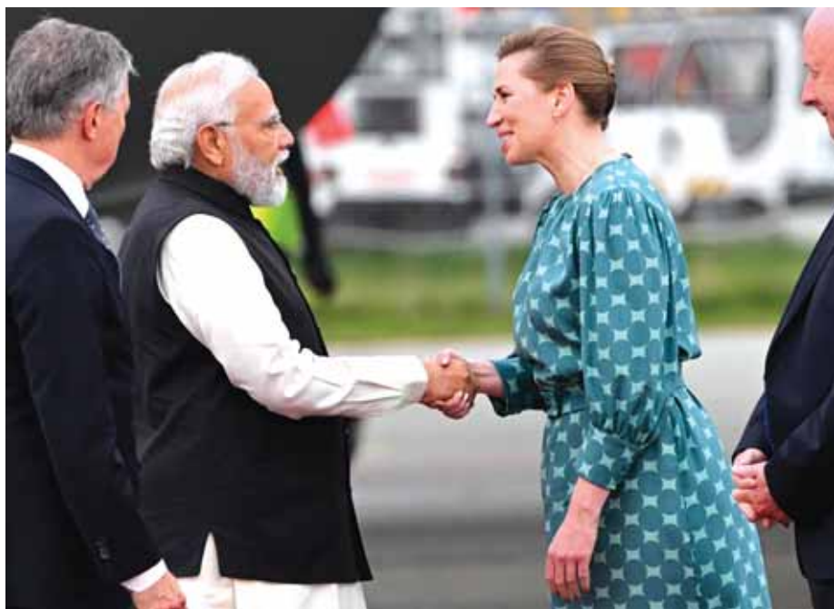
Denmark's Prime Minister Mette Frederiksen welcomes Indian Prime Minister Narendra Modi upon his arrival at Copenhagen Airport, Denmark, on Tuesday

Incidentally, Modi in his talks with German Chancellor Olaf Scholz in Berlin on Monday had said “no one will be the victorious party” in this war. His visit to three nations in the region comes at a time when many European nations are against Russian military action, while India, so far, has refrained from criticising Russia. Modi is on a visit to Germany, Denmark and France from Monday.