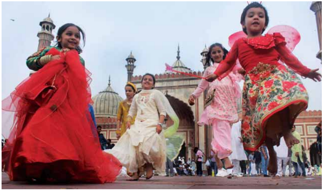
Children play after offering Eid-ul-Fitr prayers at Jama Masjid in Old Delhi on Tuesday