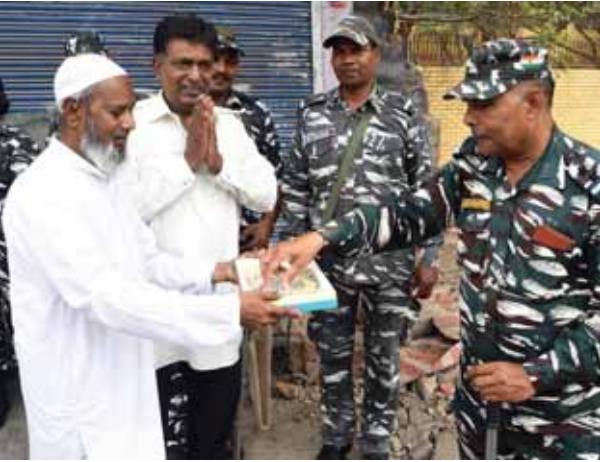
Security personnel enjoy Eid-al-Fitr sweets in violence-hit Jahangirpuri area in New Delhi on Tuesday

per cent. On Saturday, it had recorded 1,520 cases and one death, with the positivity rate at 5.10 per cent. On Friday, it saw 1,607 COVID-19 cases and two deaths, while the positivity rate was recorded at 5.28 per cent. The national capital had logged 1,490 cases and two deaths on Thursday, and the positivity rate stood at 4.62 per cent. The Delhi government has increased the number of beds dedicated to Covid patients at two of its facilities, including an 80 percent escalation in its count at the Lok Nayak (LNJP) Hospital. SF