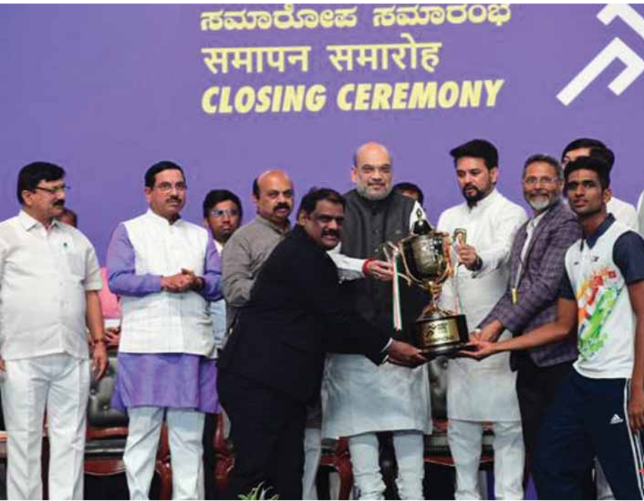
Home Minister Amit Shah, Union Minister for Sports and Youth Affairs Anurag Singh Thakur, Chief Minister of Karnataka Basavaraj Bommai, Minister for State Youth Affairs and Sports and Home Affairs Nisith Pramanik, at the star-studded closing ceremony of Khelo India games in Bengaluru