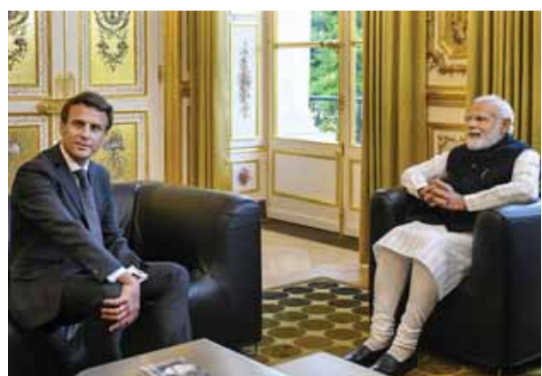
Prime Minister Narendra Modi with President of France Emmanuel Macron at Elysee Palace, Paris, on Thursday