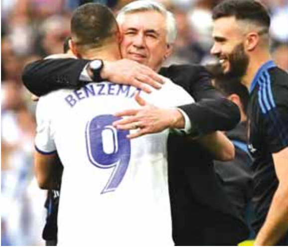
MADRID

Carlo Ancelotti said the "history of the club" helped his Real Madrid side stage another Champions League comeback to down Manchester City on Wednesday and reach the final.