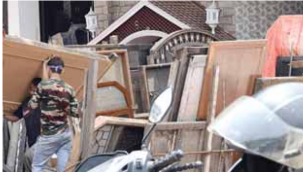
Shopkeepers seen moving out their furniture following a demolition drive against illegal structures at Shaheen Bagh in New Delhi on Thursday.