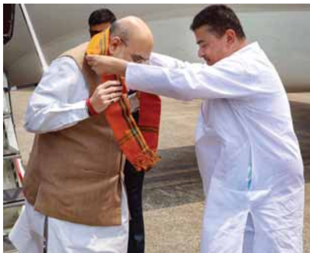
Union Home Minister and senior BJP leader Amit Shah being received by BJP MLA Suwendu Adhikari on his arrival in Kolkata on Thursday

"It seems that Mamata didi wants infiltration to continue but we will not allow that," Shah said much in the same way he told an audience at Hingalganj in North 24 Parganas hours ago how "the Border Security Force