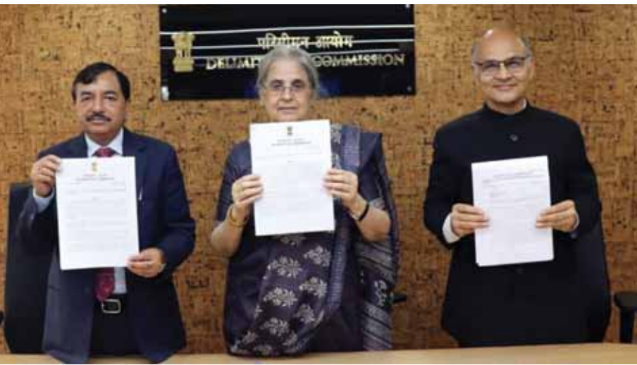
associated itself with the delimitation process be so audacious? They actually had the nerve of submitting one memorandum in Kashmir and a separate memorandum in Jammu. Ironically the memorandums were contradictory. The Jammu one seemed to have been copy pasted from the Hindutva brigade", the statement added.

43 to 47 while Jammu's share rose from 30 to 43. Who is responsible for systematic disempowerment of Kashmiris from 1947? Those who aided and abetted in the journey from Jammu 30 to 37 are the ones who aided and abetted from 37 to 43", the statement said. The statement further said that the PC had hoped that Kashmiri parties stayed away and not diluted the stigma associated with a people-less process, which was essentially a tool for disempowerment of Kashmiris. "Hope Kashmiris will now remember the parties who associated themselves with the delimitation process which was in essential a tool for disempowerment will always be in wonderment. How could a party which