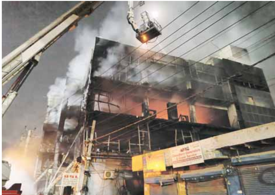
Firefighters try to douse a fire which broke out in a building at Mundka, in West Delhi on Friday