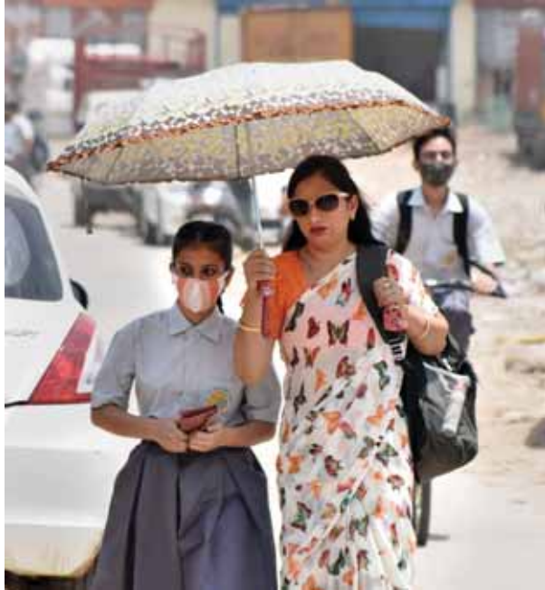
A mother and daughter use an umbrella to shield themselves from the heat on a hot summer day, in Gurugram

The Met department uses four colour codes for weather warnings -- "green" (no action