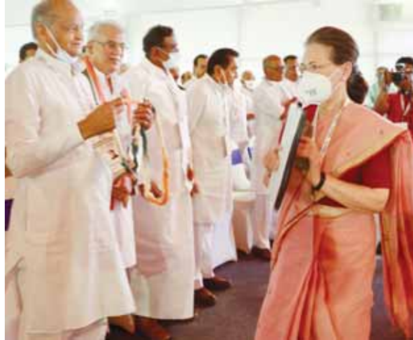
Congress interim President Sonia Gandhi greets Rajasthan Chief Minister Ashok Gehlot during the party's 'Nav Sankalp Chintan Shivir', in Udaipur

Sending out a clear message to Congress ranks while launching the brainstorming conclave, Sonia said the party will have to change its style of functioning and urged them to keep the organisation above their personal ambitions and pay back their debt to the