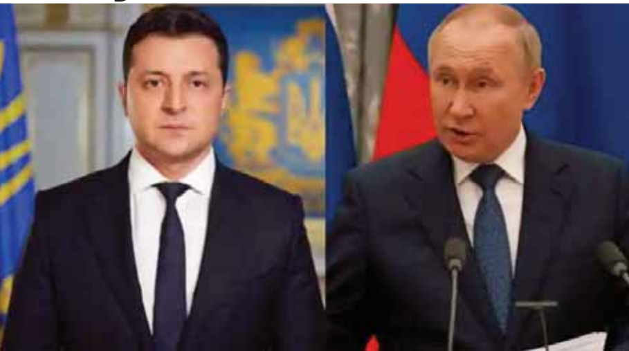
ROME

Ukrainian President Volodymyr Zelenskyy says that he's ready to talk with Russian President Vladimir Putin and that "we must find an agreement," but with no ultimatum as a condition. Zelenskyy also told Italian RAI state TV in an interview scheduled to be broadcast on Thursday night that Ukraine will never recognize Crimea as part of Russia, which annexed