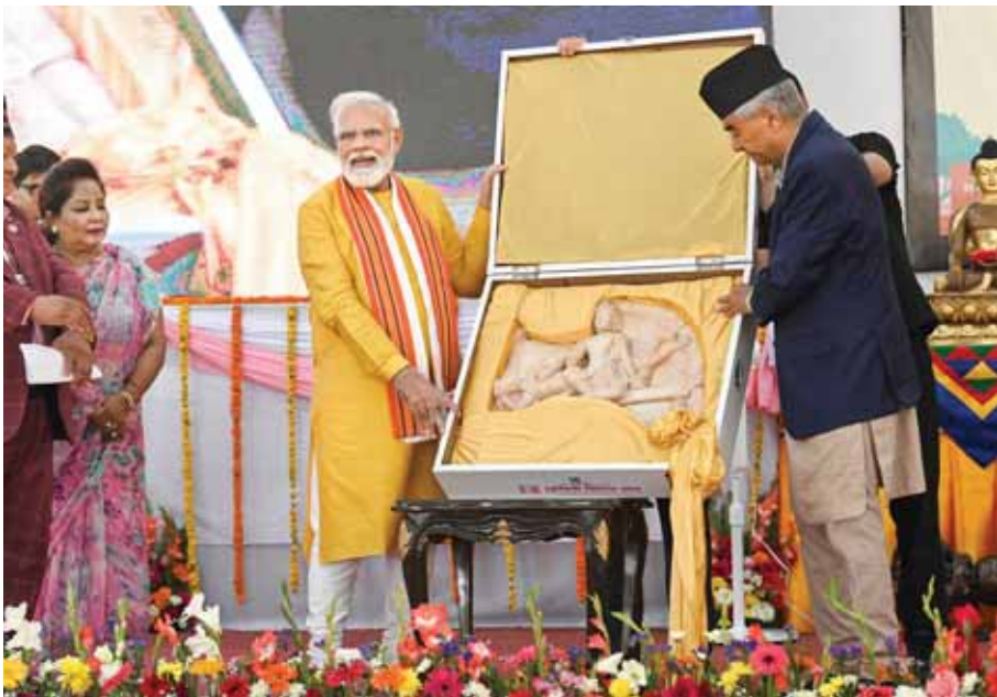
Prime Minister Narendra Modi with Nepal Prime Minister Sher Bahadur Deuba during an event on the 2,566th Buddha Jayanti and Lumbini Day 2022, in Lumbini, Nepal on Monday

"India and Nepal's ever-strengthening friendship and