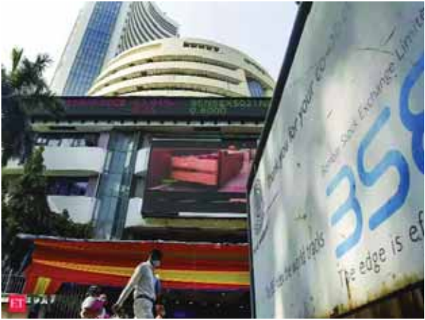
PTI ■ MUMBAI

The Sensex jumped nearly 274 points in early trade on