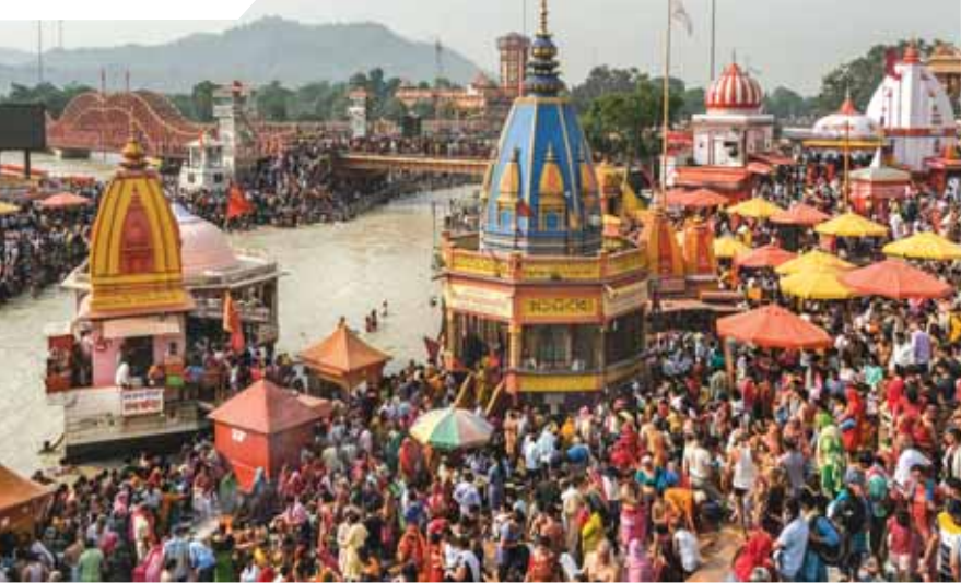
Devotees celebrate 'Buddha Purnima', at Har Ki Pauri in Haridwar