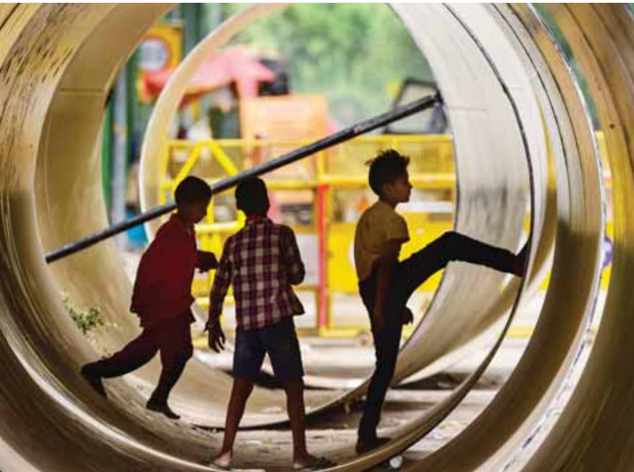
Children play inside a water pipe on a hot summer day in New Delhi Monday