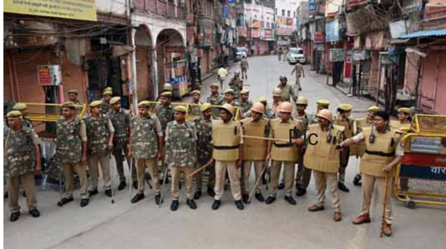
Policemen stand guard during the third and last day of a videographic survey at Gyanvapi complex in Varanasi on Monday

The Hindu side claimed that a "shivling" was found in a portion of Gyanvapi premises during the survey. It also