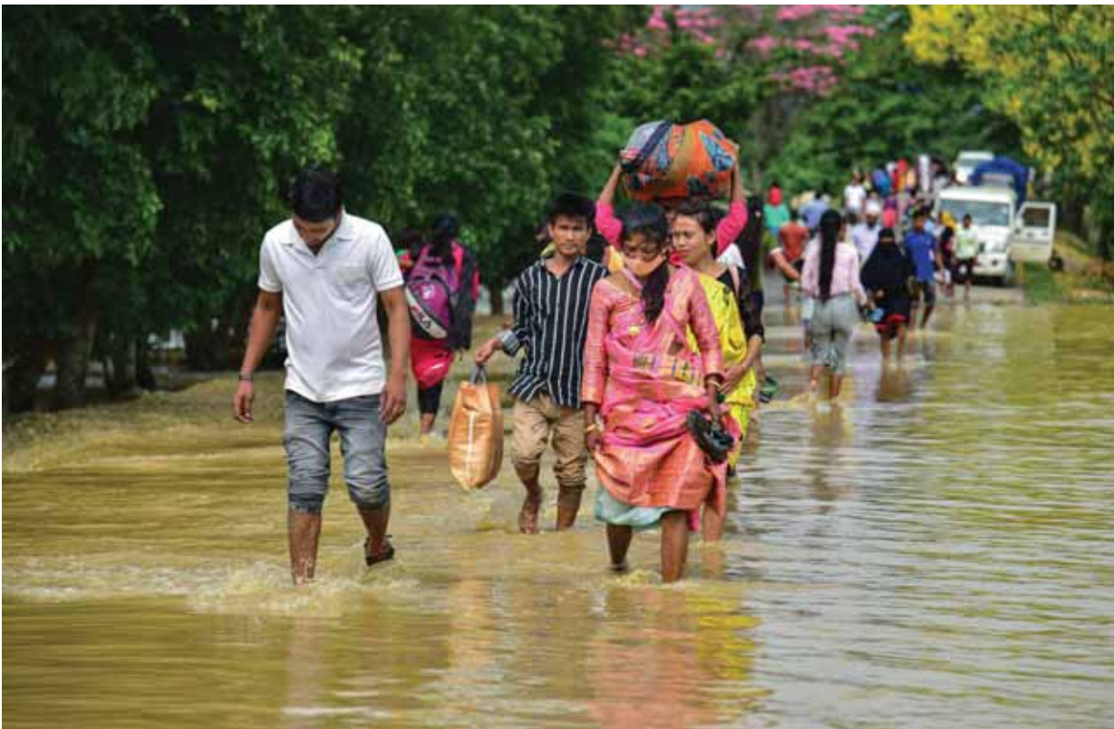
Villagers wade through a flooded road after rain at a village in Nagaon District on Tuesday

India is the second largest producer of wheat after China. Reddy is of the view that the Central Government should have given top priority to the interests of the domestic farmers. "We as farmers assure you that there is no domestic crisis which mandates a ban on wheat export. We do have enough buffer stock to address any issues and hence the interests of the farmers should have been protected," he said.