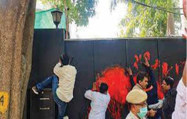
File photo of the attack on the CM's house in March