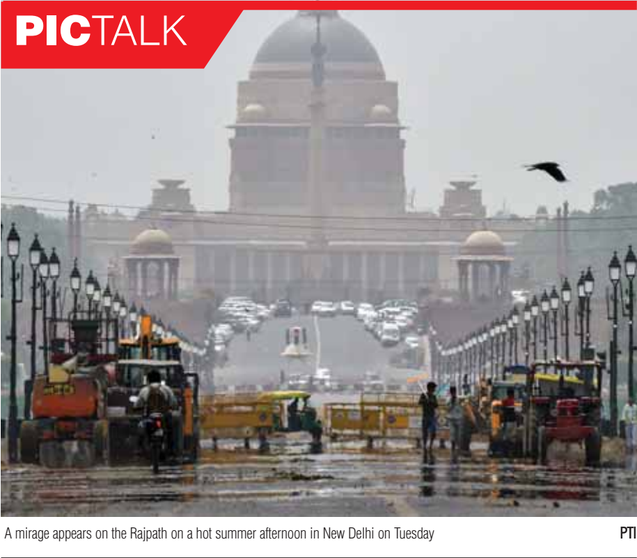
A mirage appears on the Rajpath on a hot summer afternoon in New Delhi on Tuesday