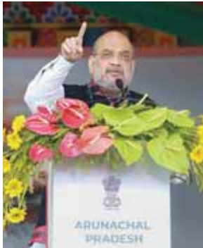
Union Home Minister Amit Shah speaks during a rally in Arunachal Pradesh's Namsal on Sunday

Taking a direct swipe at Congress leader Rahul Gandhi, Shah said that he should take out his Italian spectacles to look at the development work done by the double engine Government in Arunachal Pradesh. "Congress leaders ask what happened in eight years, these people are awake with their eyes closed. Rahul Gandhi should take out his Italian spectacles and must have a look at the development work done by PM Modi and CM Pema