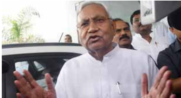
Bihar Chief Minister Nitish Kumar speaks to media persons after a meeting with senior leaders, in Patna on Sunday

The denial of an RS berth will mean the end of the road for RCP Singh, unless the BJP adopts him and offers him a nomination from its own quota. RCP Singh is reported to have paid the price for his "closeness" to the BJP leadership. In the event of the JD(U)