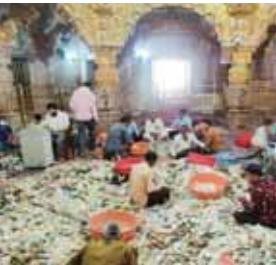
to 380 kg at Shirdi.

Others are Tirumala Tirupati, Rs 3023 crore; Vaishno Devi, Rs 2000 crore, Ambaji, Rs 4134 crore (Rs 5163 crore in 2019-20), Dwarkadhish, Rs 1172 crore, Somnath, Rs 1205 crore, Golden Temple, Rs 690 crore. Kamakhya temple in Guwahati, Krishna Janmabhoomi in Mathura, Banke Bihar Mandir in Vrindavan, Padmanabha mandir, Siddhivinayak mandir and Kashi Vishvanath mandir have similar large earnings. Gold donations at different temples vary from 130 kg at Tirupati