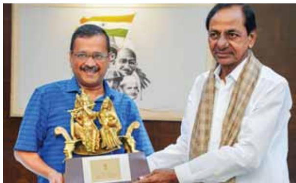
Telangana CM K Chandrashekar Rao with Delhi CM Arvind Kejriwal during a meeting, in New Delhi on Sunday

The second meeting in less than 24 hours between the two Chief Ministers, who also lead two regional political parties — the AAP and the Telangana Rashtra Samithi (TRS) — assumes significance