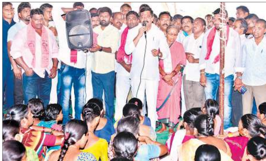
Minister for Roads and Buildings Vemula Prashant Reddy speaking at a programme in Bheemgal mandal in Nizamabad district on Saturday

Out of the 10 best villages identified on the basis of drinking water availability, sanitation, greenery, power supply, electric crematoria, CC Roads and drainage facilities, all the 10 best villages are found to be located in Telangana, he said. The survey projected Telangana as top-performing State. He attributed the delay in extending Aasra pensions to Covid-19 pandemic. Now, the State government set the stage for distribution of Aasra pensions as per revised guidelines reducing the pensionable age to 57 years. He said that the people need not be sceptical about it.