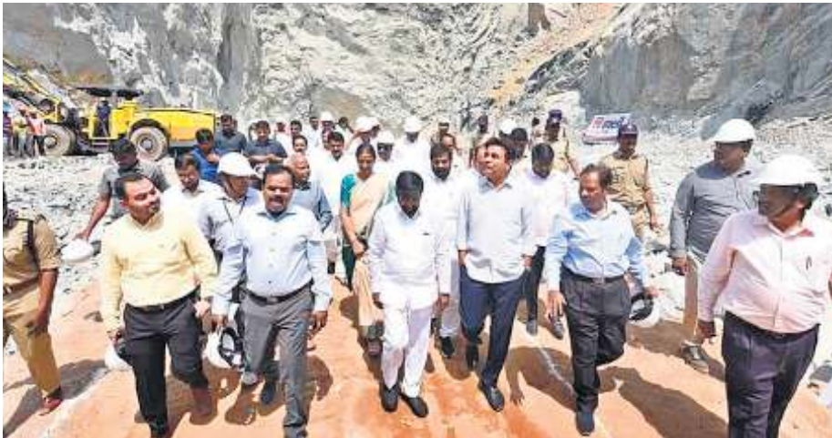
Minister for Municipal Administration K T Rama Rao at Sunkishala intake well inaugural function near Nagarjuna Sagar on Saturday

Every year in summer, emergency pumping is required to pump Krishna waters to the city at a cost of Rs 6 crore. He said the Sunkishala project would provide an opportunity to utilize water not only for drinking but also for industrial purposes. KTR said that