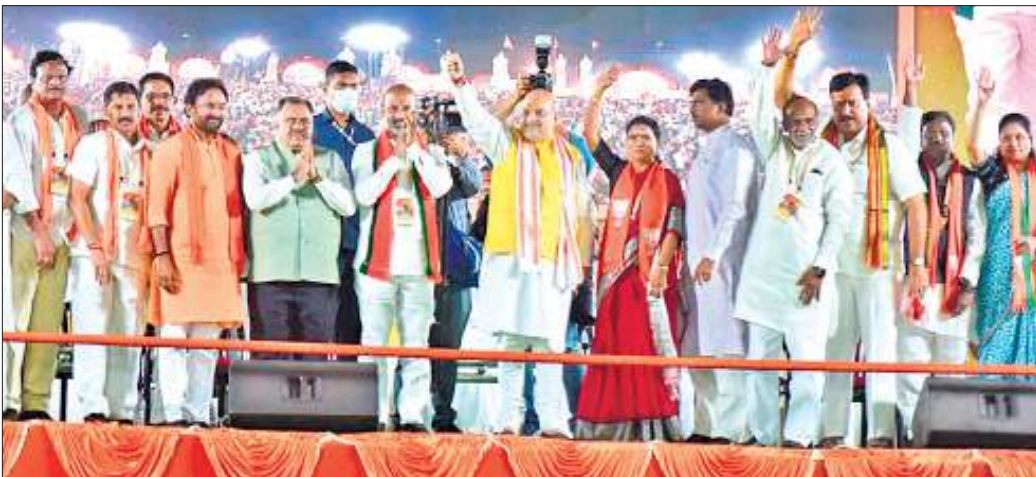
Union Minister Amit Shah greeting people at a public meeting held at Tukuguda on Saturday. State BJP leaders are also seen in the picture.

Slamming the TRS government, he said that in his entire life, he had never seen such 'nikamma and