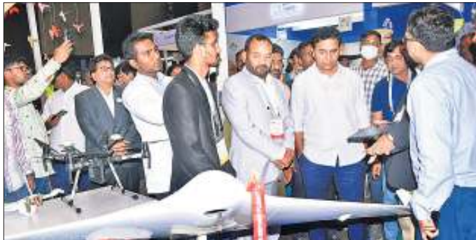
Telangana Minister KTR speaking at 'NATCON-21 Arch Utsav' on Saturday.

Speaking at the national conference 'NATCON-21 Arch Utsav' organised by the Indian Institute of Architects (IIA) in Hyderabad on Saturday, KTR said, "The city is growing, and it is important for the state and the country. The top 8 to 10 cities run our nation whether we like it or not. We have to make sure that the cities continue to perform and do well, if not the economy will tank. When we aspire and dream to be a global city, political opponents laugh at us, scoffing at us for dreaming too much. Unless you think big and think of the impossible, you cannot aspire to be a world-class city."