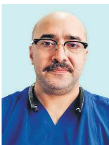
The writer is an expert in health care management

than hundred beds, fully-equipped with latest machines, contemporary Modular Operation Theatres, ICU,