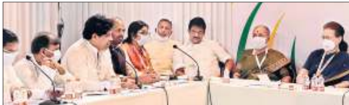
Congress president Sonia Gandhi having discussion with senior leaders at Chintan Shivir held on Saturday in Udaipur