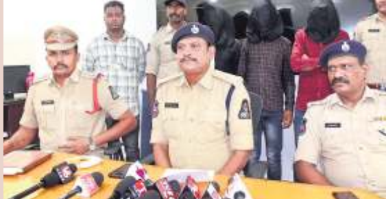
Police officers holding a media conference at Karkhana Police Station in Hyderabad on Saturday