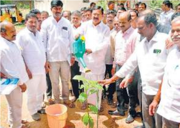
Minister for Agriculture S Niranjan Reddy planting a sapling on the premises of the National Research Centre on Meat in Hyderabad on Saturday

To overcome the situation, he called for developing quality meat by producing breeds in the State. A sheep on an average yields 13 kg of meat, he said suggesting increase meat production to 25 kg per animal on an average to meet the demand