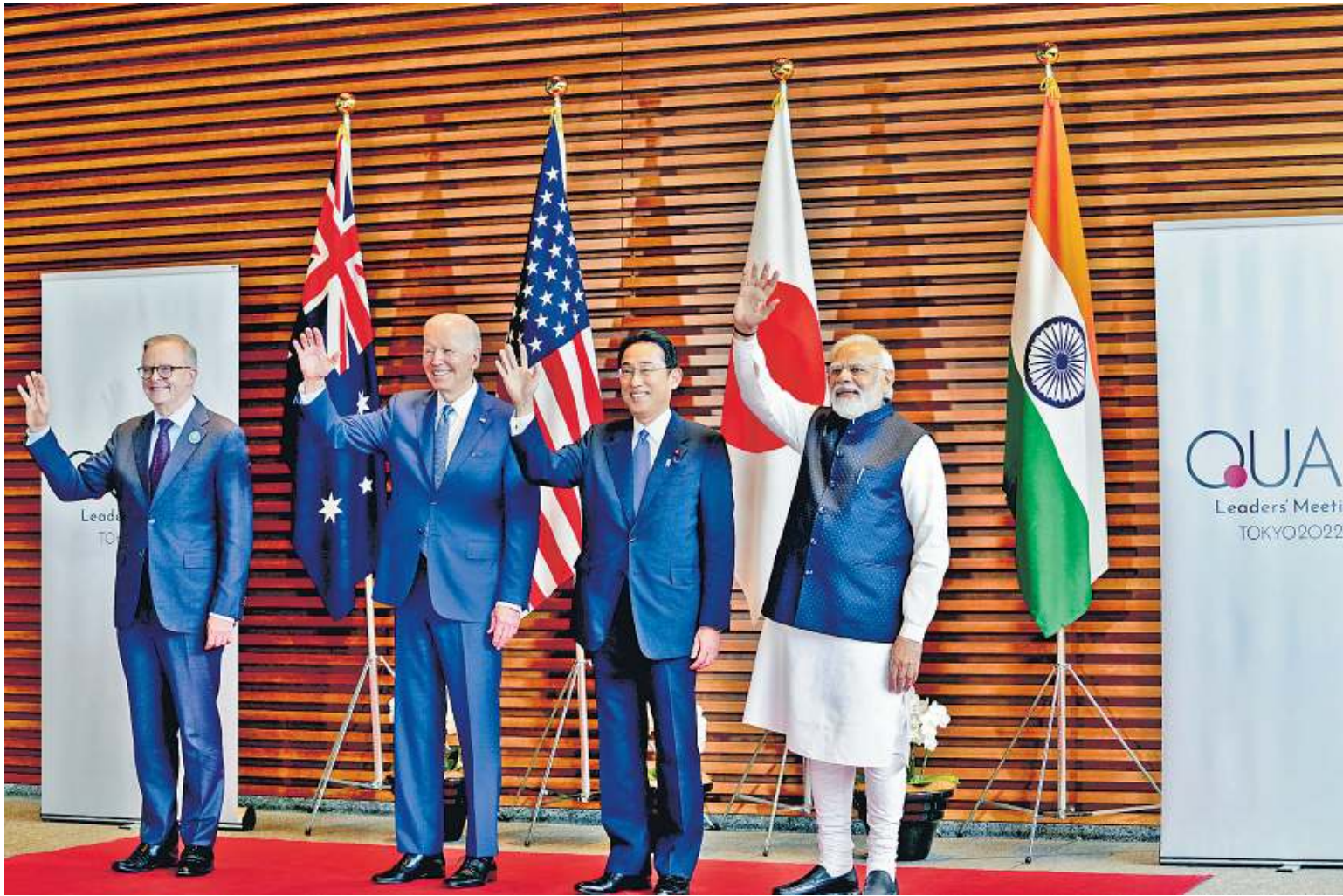
Leaders of Quadrilateral Security Dialogue (Quad) from left to right, Australian Prime Minister Anthony Albanese, US President Joe Biden, Japanese Prime Minister Fumio Kishida, and Indian Prime Minister Narendra Modi, pose for photo at the entrance hall of the Prime Minister's Office of Japan in Tokyo on May 24

The joint statement issued after the summit addressed the concerns emerging from the war in Ukraine. The statement underlined that the member countries “discussed respective responses to the conflict in Ukraine and the ongoing tragic humanitarian crisis and assessed its implica-