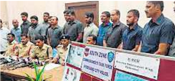
Police officers announcing the arrest of chain snatcher in Hyderabad on Saturday