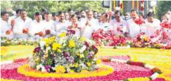
Political leaders paying homage to Telugu Desam Party founder and former Chief Minister N T Rama Rao on his 99th birth anniversary at NTR ghat in Hyderabad on Saturday