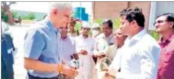
Nagarkurnool Collector P Uday Kumar welcoming SC judge Justice U U Lalit in Mahabubnagar district on Saturday

A group of villagers volunteered to move the chariot to a shed at the temple. When they were pulling the chariot, it came in contact with 11 kv live wire, leading to the tragedy. The injured were ferried to Nalgonda government hospital. Police registered the case and inquiring,