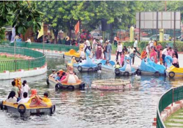
Denizens enjoying boating at Buddha Park in Lucknow on Tuesday

Chief Minister Yogi Adityanath directed officials to provide ex gratia assistance to the affected families within 24 hours. Ex-gratia assistance is given from State Disaster Response Fund in case of damages caused by notified calamities such as storm, lightning and drowning by Government of India and state government. Under this, in case of