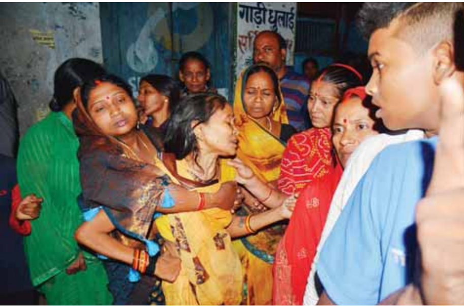
Bereaved family of a young girl killed when part of an under-construction building collapsed in Sonia area in Varanasi on Monday night.

In connection with the incident, Sigra police registered an FIR against four including the builder. The police will also seek the details