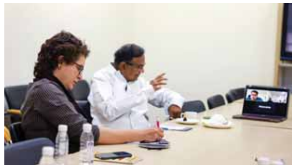
AICC general secretary Priyanka Gandhi Vadra with senior Congress leader P Chidambaram during the first meeting of 'Task Force 2024' at AICC HQ in New Delhi

Congress president Sonia formed three groups --- on political affairs for guidance on key issues, Task Force-2024 to implement the Udaipur "Nav