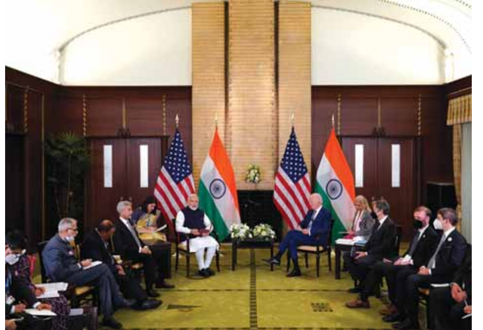
US President Joe Biden meets with Prime Minister Narendra Modi during the Quad leaders summit at Kantei Palace in Tokyo on Tuesday

Biden praised Modi for handling the Covid pandemic successfully in a democratic manner. He contrasted India's success with China's failure to handle the pandemic, though both countries are of comparable size, sources said. These