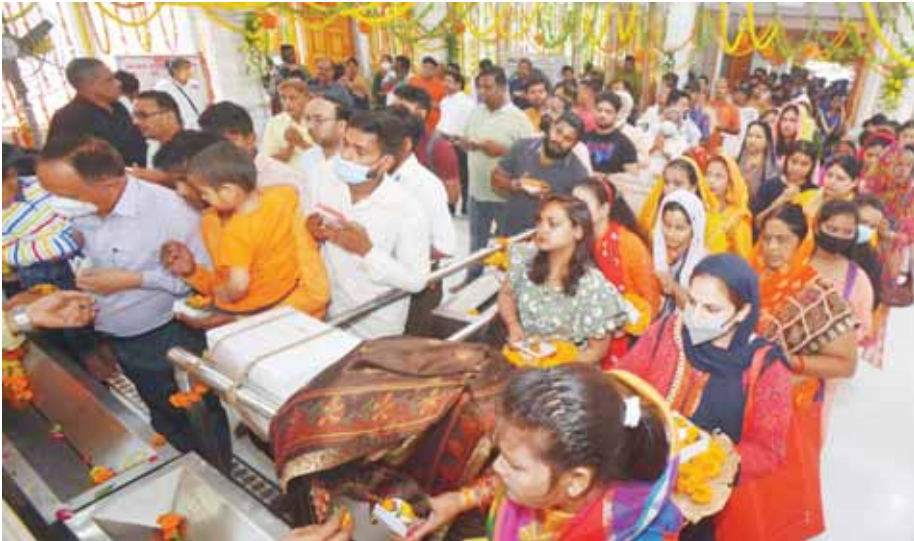
Devotees throng Hanuman Setu temple on the occasion of second Bada Mangal