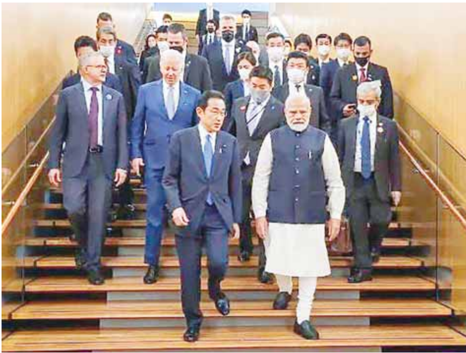
Prime Minister Narendra Modi, Prime Minister of Japan Fumio Kishida, US President Joe Biden, Prime Minister of Australia Anthony Albanese and other dignitaries at the venue of the Quad Leaders' Summit in Tokyo on Tuesday

Against the backdrop of China's aggressive posturing in the strategically important Indo-Pacific, the four leaders of the Quad strongly opposed any coercive, provocative, or unilateral actions that seek to change the status quo and increase tensions in the region.