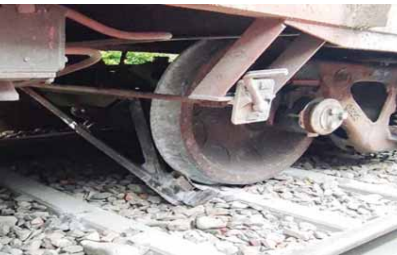
Two wagons of a goods train derailed near Chaubepur station on Tuesday morning.

A big accident was averted near Chaubepur railway station when the two wagons of a goods train going to Mathura derailed on Tuesday morning. A cattle that came in the way of the train and got stuck in the engine of the goods train is stated to be the cause behind the incident. Due to powerful jerk, two wagons of the goods train derailed from the track. This disrupted the Kanpur-Farrukhabad rail route for about 2.20 hrs. Due to disruption of the rail route, Kanpur-Kasganj Passenger and Loknayak Chhapra Express were stopped at Barrajpur and Chaubepur stations respectively. Assistant Superintendent, Chaubepur Station, Bhaskar Gangwar said the route remained disrupted for about 2.20 hours. Due to derailment of wagons brake shoes of some of the coaches were also damaged. Section Engineer Zaheer Khan along with other staff members rushed to the spot and launched a massive exercise to restore the route. Trains were stopped by caution on both sides. After carrying out the repair