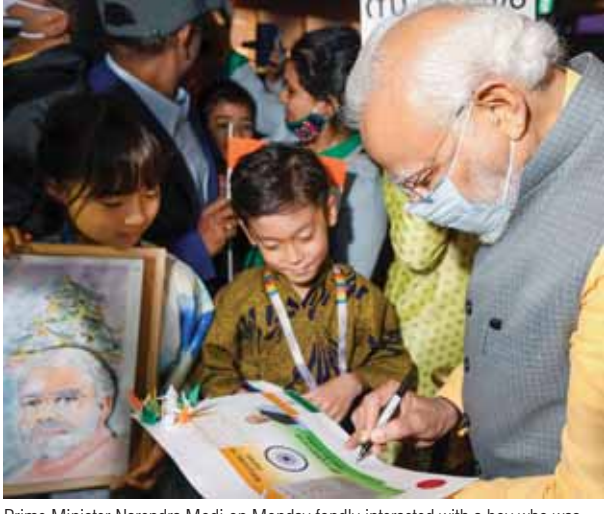
Prime Minister Narendra Modi on Monday fondly interacted with a boy who was waiting outside his hotel here and praised him for his fluency in Hindi and signed him an autograph in his tricolour drawing, in Tokyo on Monday

Prime Minister Narendra Modi on Monday underlined several steps taken for ease of doing business in India and invited Japanese industry to explore more investment opportunities here. Underlining India's robust economy, he said despite the slowdown in global Foreign Direct Investment (FDI), India attracted record FDI of USD 84 billion in the previous financial year. Terming this a vote of confidence in India's economic potential, Modi invited greater participation by Japanese companies in India and proposed celebrating Japan's contribution to