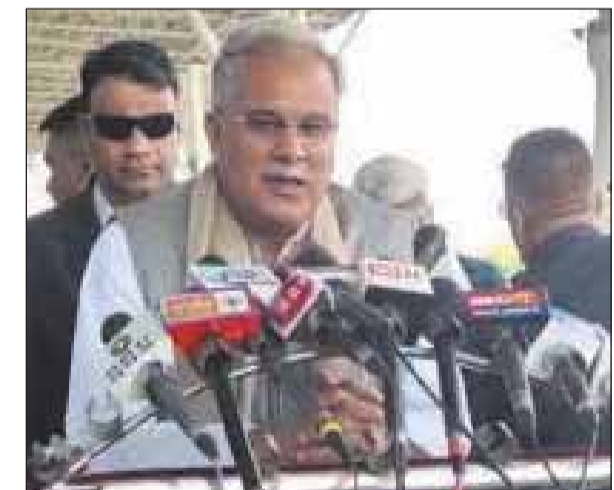
will reduce Value Added Tax (VAT) on petrol and diesel, Baghel said he could not understand Sitharaman's comment of Sunday that the reduction in excise duty will not impact the state's share in it. If the Central excise is cut, then 41 per cent of its share which goes to the state will be automatically reduced, he said. "The revenue collection

through VAT (which is levied on ad valorem basis) will also dip automatically. State officials have informed me that we will suffer a loss of around Rs 500 crore (annually)," the Chief Minister said.