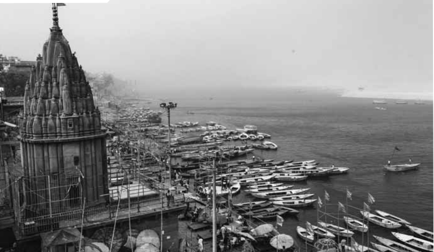
Anchored boats during a dust storm at a ghat in Varanasi