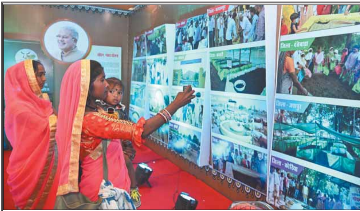
A glimpse from the month-long exhibition underway at the Deendayal Auditorium in Raipur. Through photographs and video clips, it showcases the achievements of the Bhupesh Baghel government in Chhattisgarh over the past three-and-a-half years.

Two minors among 10 miscreants were arrested on Saturday who were involved in the robbery.