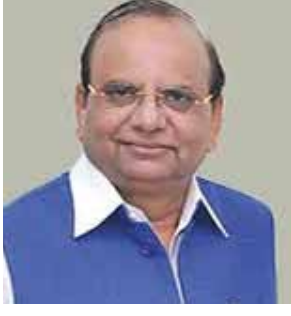
Vinai Kumar Saxena

Vinai Kumar Saxena, the Chairman of Khadi and Village Industries Commission, was on Monday appointed the Lieutenant Governor (L-G) of Delhi replacing Anil Bajjal. He is the first man from the corporate and social sector to be selected for such a gubernatorial post. He is the person who made Khadi a global brand. President Ram Nath Kovind on Monday issued a notification to this effect. "The President of India has accepted the resignation of Shri Anil Bajjal as Lt Governor of National Capital Territory of Delhi. "The President of India has been pleased to appoint Shri Vinai Kumar Saxena to be the Lt Governor of National Capital Territory of Delhi with effect from the date he assumes charge of his office," read a communiqué issued by Rashtrapati Bhawan.