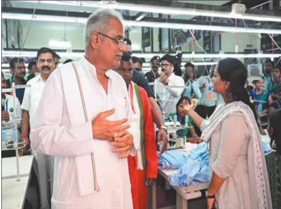
resources. He said the innovations taking place in Dantewada are compatible with the natural environment of the region, which is

He said that Dantewada has a huge potential to experiment with organic farming as the land is fertile and has abundance of forest resources.