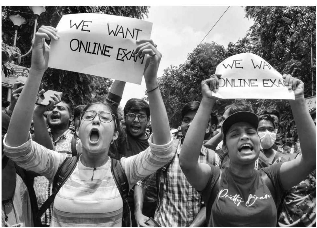
Students of Calcutta University raise slogans during a protest demanding online examinations, in front of the university's campus, in Kolkata

as a cyclonic circulation lies over north Pakistan extending upto middle tropospheric levels. An induced Low Pressure Area lies over northwest Rajasthan and an eastwest trough runs from this induced Low Pressure Area to north Bangladesh in lower tropospheric levels," the IMD said. According to the weather office, thunderstorms occurred at several places in Uttarakhand, while most parts of Jammu and Kashmir, Himachal Pradesh, Haryana, Delhi, Uttar Pradesh and isolated places in Rajasthan received rainfall. On Sunday, Fatehgarh in Uttar Pradesh had recorded the maximum temperature of 45.9 degrees Celsius. In Delhi, the morning temperature plunged 11 notches from 29 degrees Celsius to 18 degrees Celsius.