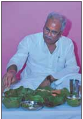
ginger, chili, salt and a bit of sugar to create a smooth, orange paste. Sometimes, they cook the paste further with oil and chopped onions. Tribal vendors also sell

To make the chutney, villagers first crush and dry all the ants and eggs, then grind them with a mortar and pestle. Then they add tomatoes, coriander, garlic,