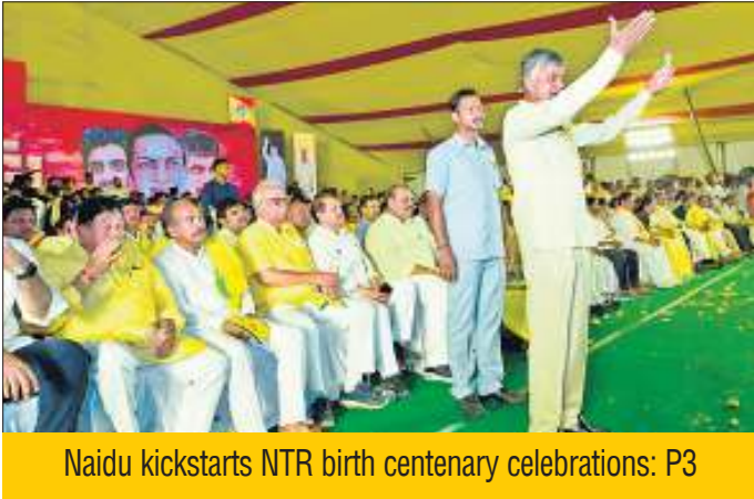
Naidu kickstarts NTR birth centenary celebrations: P3

While the family treasury of Jagan became full, the AP people got Rs. 8 Lakh Cr debt. How could