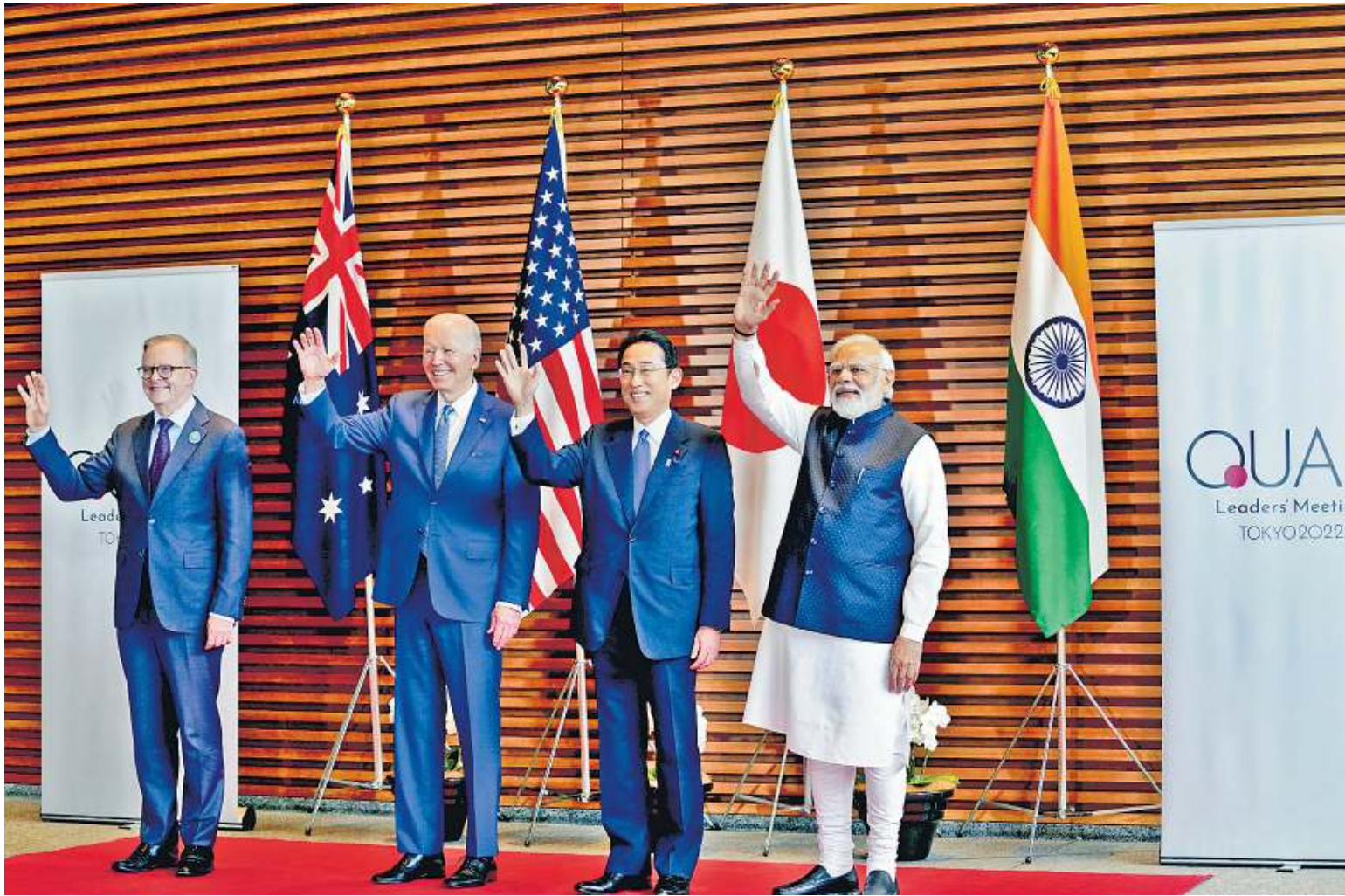
Leaders of Quadrilateral Security Dialogue (Quad) from left to right, Australian Prime Minister Anthony Albanese, US President Joe Biden, Japanese Prime Minister Fumio Kishida, and Indian Prime Minister Narendra Modi, pose for photo at the entrance hall of the Prime Minister's Office of Japan in Tokyo on May 24

The joint statement issued after the summit addressed the concerns emerging from the war in Ukraine. The statement underlined that the member countries “discussed respective responses to the conflict in Ukraine and the ongoing tragic humanitarian crisis and assessed its implica-