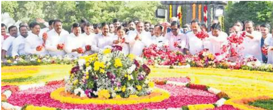
Political leaders paying homage to Telugu Desam Party founder and former Chief Minister N T Rama Rao on his 99th birth anniversary at NTR ghat in Hyderabad on Saturday.