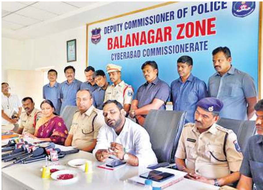
Police announcing the busting of spurious seeds racket in Hyderabad on Saturday

The last date for online submission of applications for entrance based regular Post Graduate, PhD and other courses at MANUU is June 1, 2022. Admissions are open for various Post Graduate, certificate and diploma courses too.