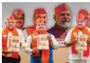
Gujarat Chief Minister Bhupendra Patel, BJP national president JP Nadda and State party chief CR Patil during release of the party manifesto for Gujarat polls, in Gandhinagar, on Saturday

Setting up an anti-radicalisation cell is another promise of the BJP.