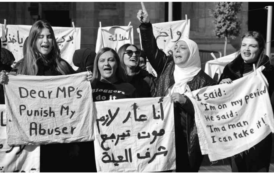
Activists from Lebanese NGO Aabad and sex abuse survivors chant slogans during a protest against sexual harassment, rape and domestic violence, in front of parliament building in Beirut: downtown Beirut, Lebanon on Saturday. The activists are protesting a Lebanese law that allows a rapist to get away with his crime if he marries the survivor. The law, in place since late 1940s. The Arabic banner, center, reads: "I am a disgrace, I should die so my family can retain their honor."

military wing of the elite Revolutionary Guard, and reiterated unsupported claims that protesters demonstrating countrywide are "tools" of the U.S. And its "mercenaries." "(The) Basij should not forget that the main clash is with global arrogance, or the U.S.," Khamenei said in address marking Basij week in Iran. (AP)