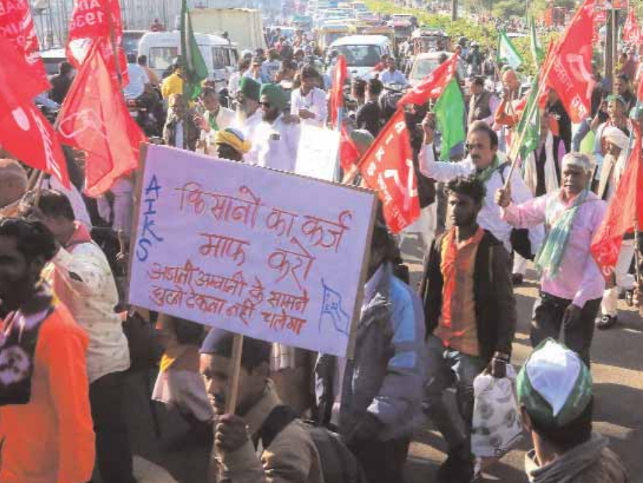
Farmers under the banner of Sanyukt Kisan Morcha take out a rally to submit a memorandum to Governor demanding waiver of farm loan, pension scheme and compensation of the damaged crops, in Bhopal on Saturday.