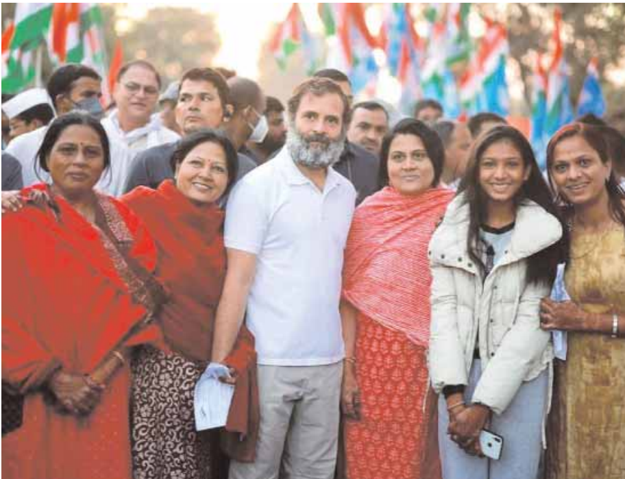
All India Congress Committee (AICC) leader Rahul Gandhi during the Bharat Jodo Yatra in Khandwa district, Madhya Pradesh on Saturday.