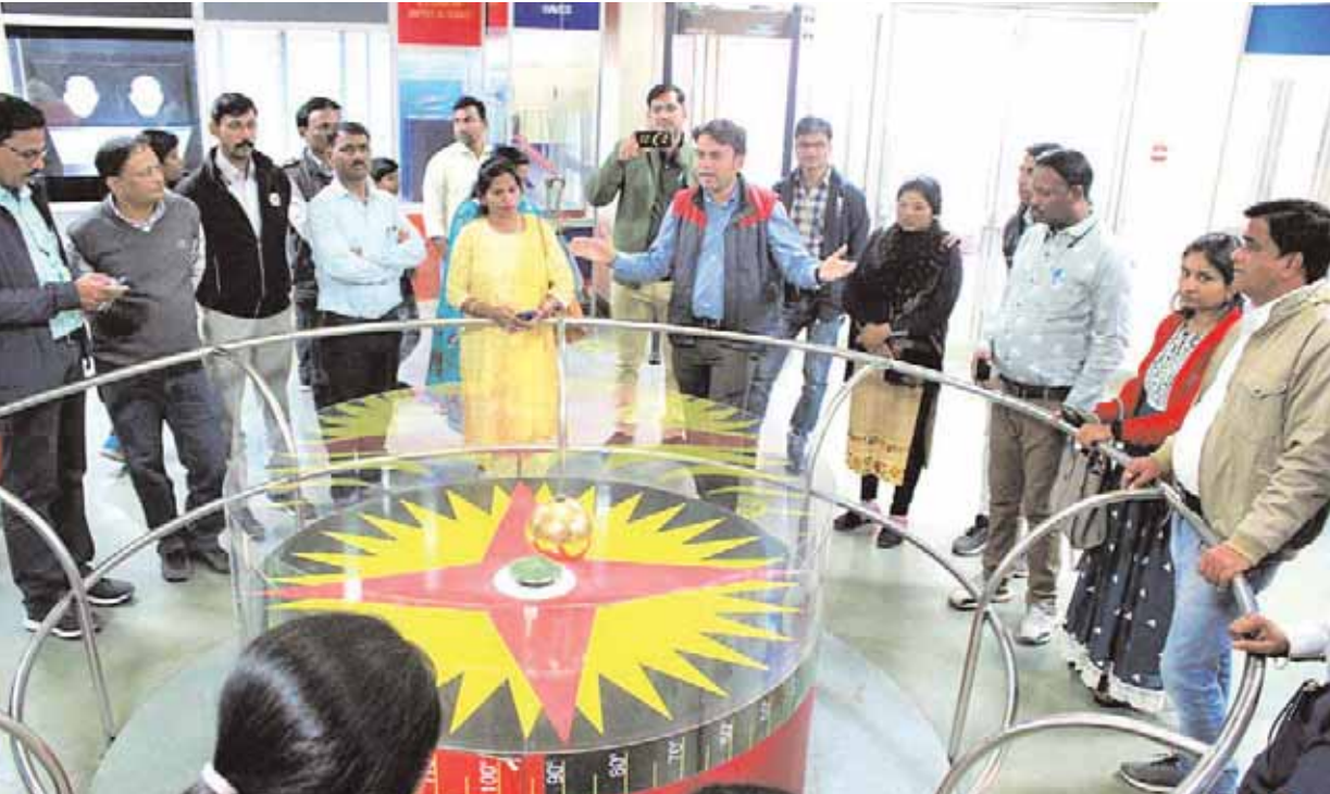
Teachers from all over the State of CM rise schools visit Regional Science Center during their ongoing training programme in Bhopal on Saturday.

said that just as a lion becomes the king of the jungle on the strength of his hard work, no one crowns him, in the same way, advocates also have to make their place on the strength of their knowledge and skills. He said that in Indian philosophy, the set of culture, thought, tradition and philosophy has been called nation, whereas in western philosophy, nation is bound only by geographical boundaries. The nation has been defined in our Vedas as well. Culture is created by rituals and our rituals are Vasudhaiva Kutumbakam, Atithi Devo Bhava. That is why our culture is unique in the whole world.